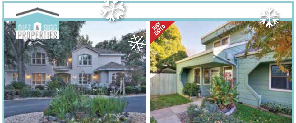
5244 Fair Oaks Boulevard, Carmichael | $1,295,000