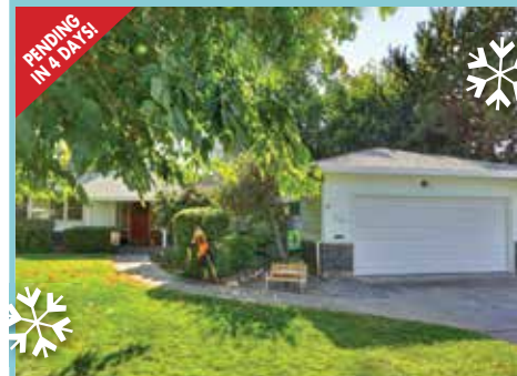
4320 Rio Vista Avenue, Sacramento | $485,000

This private upscale end unit with its own garage is tucked away in a charming neighborhood just minutes from Town and Country Village shopping, fabulous restaurants and freeway access. Step inside to a well thought out floor plan with 2 bedrooms, 1.5 baths and gorgeous natural lighting throughout. Enjoy a formal dining room with a dramatic cathedral ceiling, a large family room with a wood burning fireplace for those long winter nights ahead, and a beautiful kitchen with tons of storage space, and a new counter depth fridge. The bright and airy master bedroom has its own private viewing balcony. Additional highlights include new dual pane windows and water heater, interior LED lighting, upstairs laundry room, wood flooring, and tiled bathrooms. Enjoy your own private outdoor oasis with two patios and professional, low-maintenance landscaping. Timed LED electric lighting and sprinklers. New fence to be installed by the association. Clear pest and home inspection and low HOA dues. Must see!