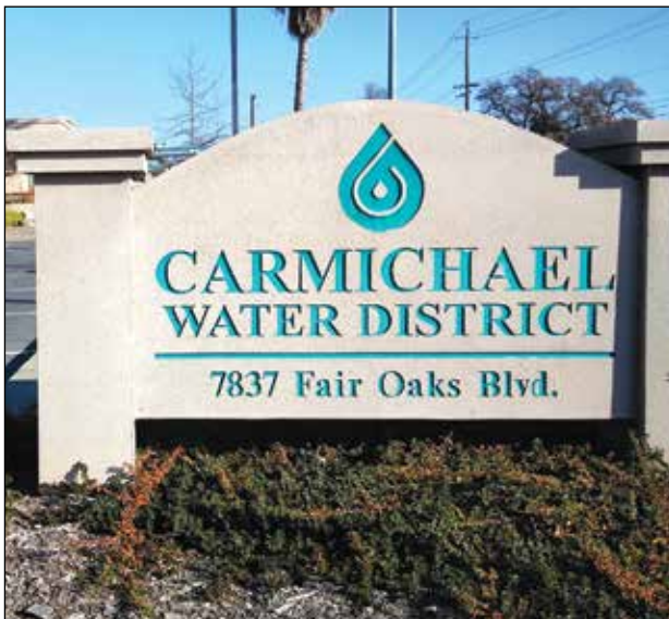
The Carmichael Water District audit was tasked to certified public accountants Richardson and Company.

Richardson and Company planned to compare the approved benefits offered to each position with the actual benefits received. They would also determine whether any unauthorized payments to