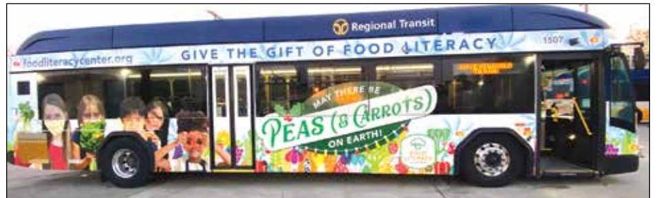
SacRT & Food Literacy Center unveiling this year's SacRT Holiday Bus. SacRT Holiday Bus travels on different routes spreading goodwill from December 1, 2020 to January 1, 2021.