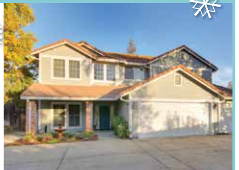
6610 Stanley Avenue, Carmichael | $979,000

Welcome home! This beautifully remodeled home is tucked away in an excellent neighborhood on a lovely cul-de-sac. A sprawling front lawn and charming porch add to this home's great curb appeal. Step inside to a spacious floor plan with 3 bedrooms and 2 full baths. Relax and unwind in the light-filled living room, complete with a cozy fireplace for those winter nights ahead. The remodeled kitchen features gorgeous marble countertops, stainless steel appliances, a farm-style sink, an island with bar seating and a wine fridge. The upgraded master bathroom features his-and-her farm-style sinks, a large walk-in closet and radiant heat tile flooring. The backyard is perfect for entertaining with an expansive deck and patio, low maintenance landscaping and possible RV access. Additional highlights include hardwood flooring throughout, dual pane windows, a newer roof, and a two-car garage.