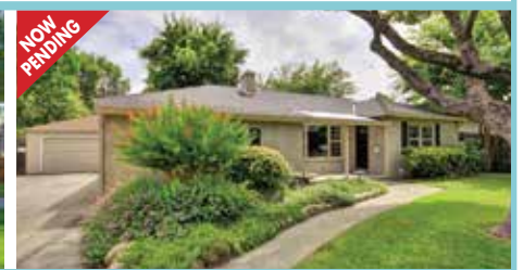
4308 Hazelwood Avenue, Sacramento | $639,500

PENDING IN 2 DAYS! From its charming storybook exterior to its perfectly polished interior, this beautiful 4 bedroom and 2 bath home has it all! An inviting porch and idyllic front yard add to this home's great curb appeal. Completely remodeled with gorgeous finishes throughout! The gourmet kitchen features stainless steel appliances, quartz countertops, and an oversized island with a breakfast bar. The family room has a cozy stone fireplace and beautiful French doors that open up to the private backyard. The exquisite master suite has a soaking tub, walk-in shower and custom fireplace. The backyard is set on .43 acres with gorgeous landscaping and an outdoor patio.