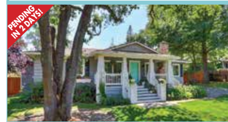
6644 Stanley Avenue, Carmichael | $729,000

This timeless English Tudor home is an entertainer's dream! Tucked away in a large corner lot in a well-established neighborhood, this estate captures the best of both worlds for a buyer who wants a private retreat with the ease of having in-town conveniences. Within 1 mile, you can access Lake Natoma, the American River and Highway 50. Step inside this immaculately kept home where you will find a grand entryway, formal dining room overlooking the picturesque backyard, spacious living room, family room and home office. Large kitchen offers tons of storage space for dinner parties/events. Two separate staircases lead to an oversized master bedroom and two guest bedrooms. Backyard is an entertainer's dream with two Brazilian hardwood decks overlooking gorgeous landscaping, including a bridge and water feature. New $80k roof installed 10/18. 3-car garage features a built-out shop and pristine epoxy floors. Tons of storage space inside and outside. Top rated schools K-12. House is 100% electric through SMUD.