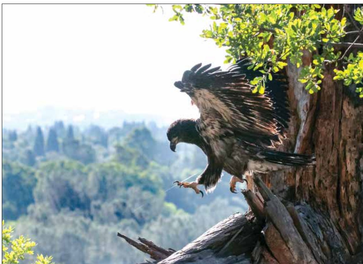
Bald eaglet "Miracle" launches into flight over the American River.