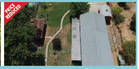
115 E Street, Rio Linda | $464,000

NOW PENDING Vacation at home! This beautiful ranch-style home is tucked away in one of Carmichael's most desirable locations near Ancil Hoffman Park. Enjoy a spacious floor plan with 4 bedrooms and 3 baths and separate living and family rooms. This home functions as a single-story home with a bedroom, bathroom and game room upstairs that could be used as a detached guest quarters. New carpet in the formal living and dining room, new flooring in the master and sunroom, freshly painted exterior, and a newly landscaped front yard. The backyard is an entertainer's dream with a large sparkling pool, stamped concrete patio, and mature oak trees that provide enhanced privacy and shade.