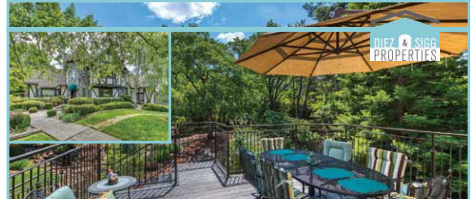
4030 Canonero Court, Fair Oaks | $949,000

His crimes earned him the nicknames of the Visalia Ransacker, the East Area Rapist, the Original Night Stalker, and the Golden State Killer. It was not until April 2018 that Sacramento authorities announced that Investigative Genetic Genealogy had identified DeAngelo as the person responsible. ★