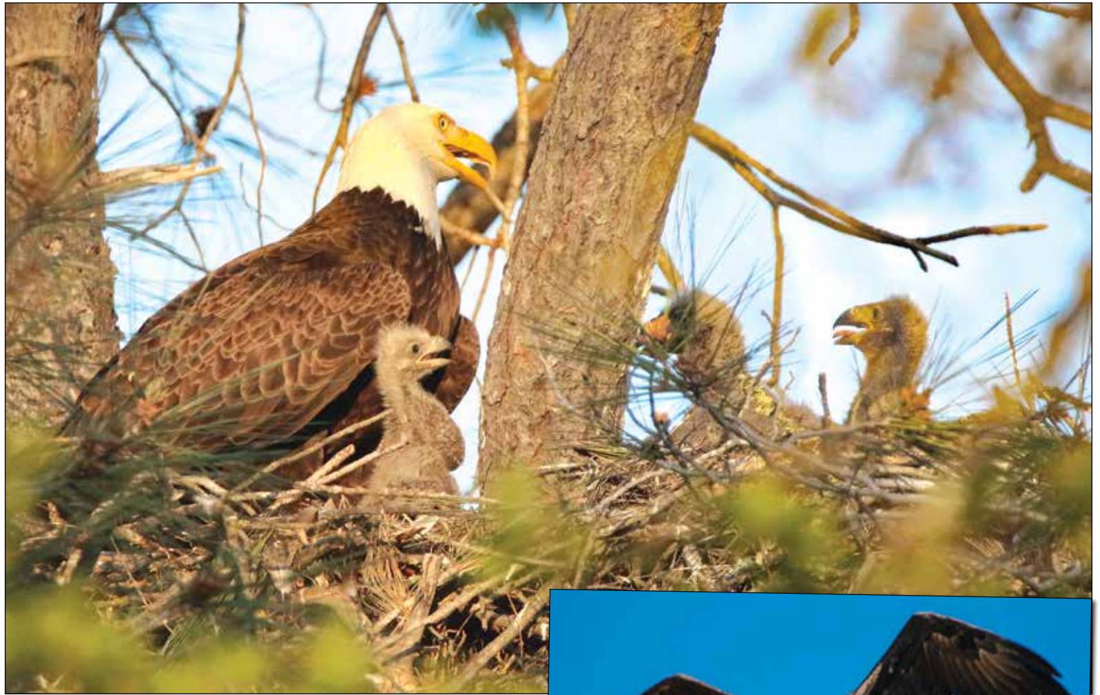
Above: The female bald eagle hatched three babies in this spring. Two survived to fly in June. Right: Mama bald eagle supplies a really big catch for her eaglets.

By last week, brother Miracle had also reached fly-by date and was jumping aggressively on branches outside the nest. Mama and Papa returned, bearing fish and a small rodent as gifts. Unplacated, their runt screamed from noon till sunset, seemingly demanding maternal permission to fly. Perhaps fearing an evening fledge and the risk another of baby on the ground,