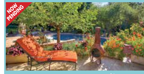
6476 Chiquita Way, Carmichael | $895,000

NOW PENDING This well-maintained ranch-style home is tucked away on a roomy .45 acre lot in a desirable tree-lined neighborhood. This gracious floor plan features a separate living and family room, and a remodeled kitchen with newer stainless steel appliances, granite counter tops, timeless open shelving and recessed lighting. Main house has 4 or 5 bedrooms (5th bedroom currently serves as a hobby room/laundry room). All 3 bathrooms have been tastefully updated/remodeled. The HUGE lot has a separate oversized one-car garage with a drive through door, and a large 1,200 sq. ft. detached 2-car garage and 1 bedroom, 1 bath guest home with living room and loft bedroom. Enjoy a wonderful neighborhood near top rated schools and fabulous shopping and restaurants.