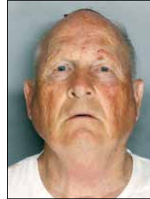
Joseph James DeAngelo Jr.,

sentenced to life in state prison without the possibility of parole. The sentence will run consecutive and concurrent to his sentence for the first-degree murders to which he has pled. His sentencing hearing will commence on August 17, 2020. Victims will be given the opportunity to deliver victim impact statements prior to DeAngelo's sentencing on