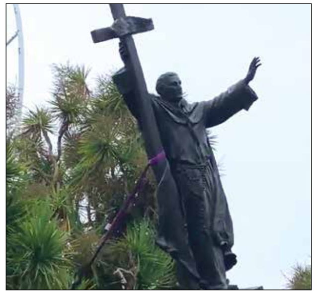
A screenshot from a video showing vandals removing the statue of St. Junipero Serra in Golden Gate Park in San Francisco on June 19, 2020.

Serra got along well with the Indians. His goal, and that of the Franciscan missionaries whom he led, was not to conquer the Indians - it was to make them good Christians. The missionaries granted the Indians