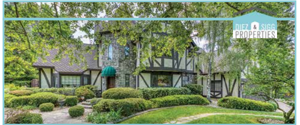
4030 Canonero Court, Fair Oaks | $949,000

This timeless English Tudor home is an entertainer's dream! Tucked away in a large corner lot in a well-established neighborhood, this estate captures the best of both worlds for a buyer who wants a private retreat with the ease of having in-town conveniences. Within 1 mile, you can access Lake Natoma, the American River and Highway 50. Step inside this immaculately kept home where you will find a grand entryway, formal dining room overlooking the picturesque backyard, spacious living room, family room and home office. Large kitchen offers tons of storage space for dinner parties/events. Two separate staircases lead to an oversized master bedroom and two guest bedrooms. Backyard is an entertainer's dream with two Brazilian hardwood decks overlooking gorgeous landscaping, including a bridge and water feature. New $80k roof installed 10/18. 3-car garage features a built-out shop and pristine epoxy floors. Tons of storage space inside and outside. Top rated schools K-12. House is 100% electric through SMUD.