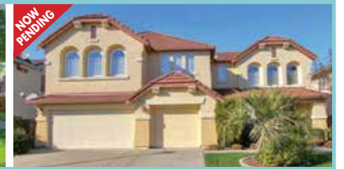
341 Menard Circle, Sacramento | $599,900

From its charming storybook exterior to its perfectly polished interior, this beautiful 4 bedroom and 2 bath home has it all! An inviting porch and idyllic front yard add to this home's great curb appeal. Completely remodeled with gorgeous finishes throughout! The gourmet kitchen features stainless steel appliances, quartz countertops, and an oversized island with a breakfast bar. The family room has a cozy stone fireplace and beautiful French doors that open up to the private backyard. The exquisite master suite has a soaking tub, walk-in shower and custom fireplace. The backyard is set on .43 acres with gorgeous landscaping and an outdoor patio.