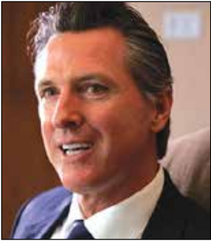
Governor Gavin Newsom

Office of Governor Gavin Newsom Press Release