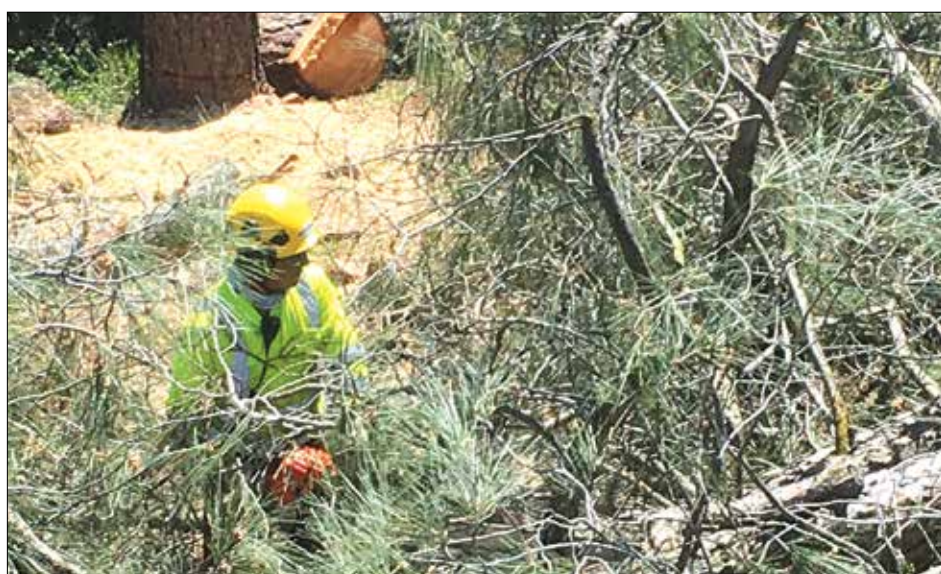
SMUD contract tree pruning workers clear high-fuel vegetation and brush under and near high-voltage transmission lines in Rescue, El Dorado County.

Though SMUD doesn't serve El Dorado County, the community-owned electric company works directly with property owners to plan the work, which in some cases crosses private property near homes and businesses including orchards and vineyards. In many cases, property owners request the removal of trees and brush on their properties as wildfire danger has become considerably more threatening in recent years.