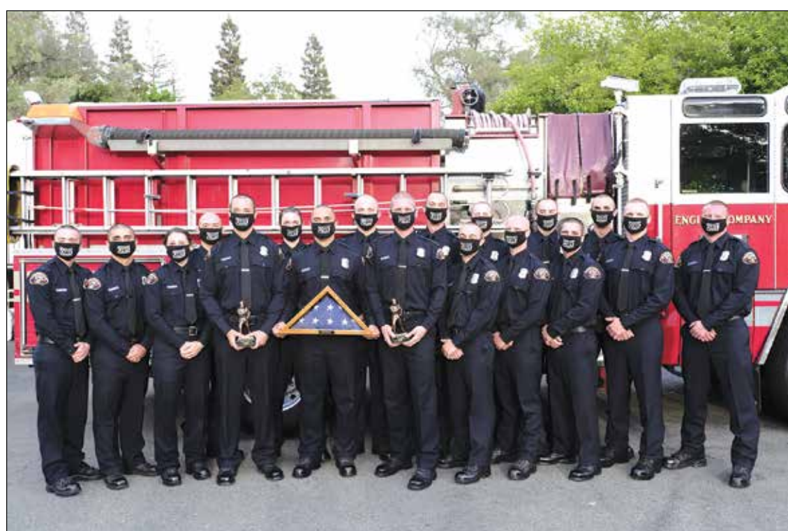
Firefighter Recruit Class 20-1 graduated from the Metro Fire Recruit Academy, receiving their badges and first station assignments.

skills critical for performing emergency operations on scene at fires, emergency medical incidents, and motor vehicle accidents. Recruits also trained in live structural fires, simulated structural collapses, wildland fire suppression, and learned countless other firefighting and rescue skills.