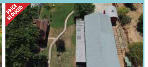
115 E Street, Rio Linda | $464,000

Vacation at home! This beautiful ranch-style home is tucked away in one of Carmichael's most desirable locations near Ancil Hoffman Park. Enjoy a spacious floor plan with 4 bedrooms and 3 baths and separate living and family rooms. This home functions as a single-story home with a bedroom, bathroom and game room upstairs that could be used as a detached guest quarters. New carpet in the formal living and dining room, new flooring in the master and sunroom, freshly painted exterior, and a newly landscaped front yard. The backyard is an entertainer's dream with a large sparkling pool, stamped concrete patio, and mature oak trees that provide enhanced privacy and shade.