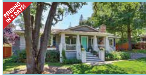
6644 Stanley Avenue | $729,000

This timeless English Tudor home is an entertainer's dream! Tucked away in a large corner lot in a well-established neighborhood, this estate captures the best of both worlds for a buyer who wants a private retreat with the ease of having in-town conveniences. Within 1 mile, you can access Lake Natoma, the American River and Highway 50. Step inside this immaculately kept home where you will find a grand entryway, formal dining room overlooking the picturesque backyard, spacious living room, family room and home office. Large kitchen offers tons of storage space for dinner parties/events. Two separate staircases lead to an oversized master bedroom and two guest bedrooms. Backyard is an entertainer's dream with two Brazilian hardwood decks overlooking gorgeous landscaping, including a bridge and water feature. New $80k roof installed 10/18. 3-car garage features a built-out shop and pristine epoxy floors. Tons of storage space inside and outside. Top rated schools K-12. House is 100% electric through SMUD.