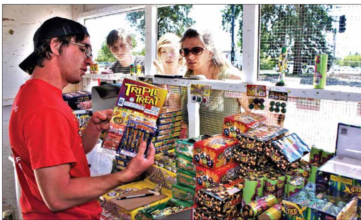
Cash-strapped non-profits are hoping for brisk business with so few professional displays being staged this season.