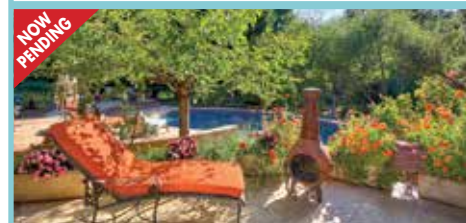
6476 Chiquita Way, Carmichael | $895,000

This beautifully-appointed home has it all! Built in 2002, this stunning 3,657 sq. ft. residence features a well-designed floor plan with spacious living areas including a separate living room with soaring ceilings, a formal dining room, an oversized kitchen overlooking the family great room, and downstairs bedroom and full bathroom. Upstairs, enjoy 3 bedrooms and 2 full baths with a large theater room that could be converted into an office or possible fifth bedroom. The large master suite has a gas fireplace, soaking tub, separate shower and his & hers walk-in closets. The backyard features a large covered patio with outdoor kitchen/bbq, stamped concrete area with a palapa and built-in fire pit, and another stamped concrete space with additional seating and outdoor fire pit.