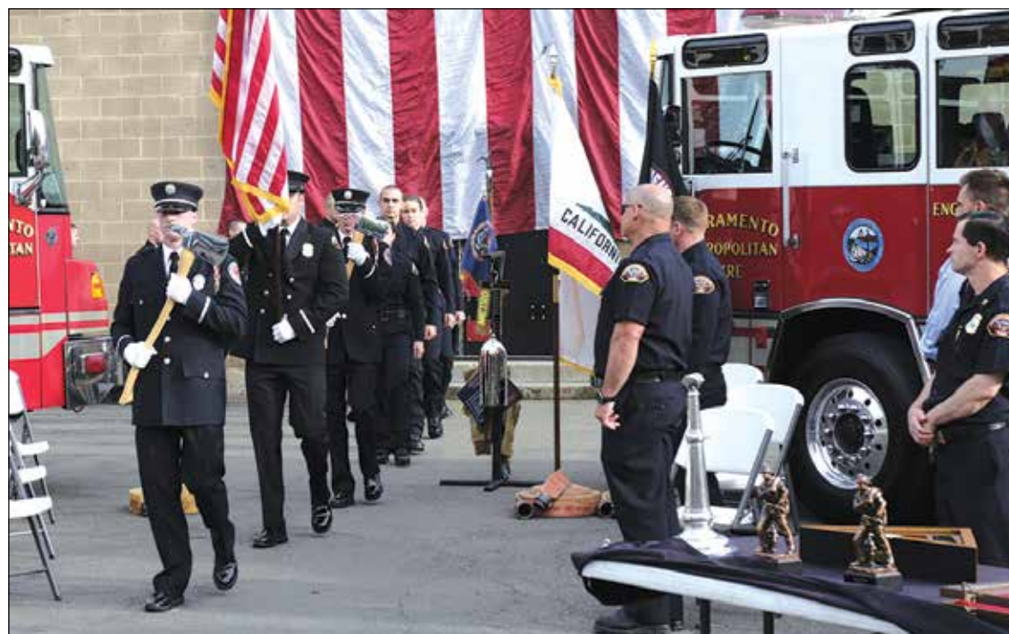
The Sacramento Area Fire Fighters Local 522 Honor Guard marked the opening of the ceremony with the presentation of the Colors.