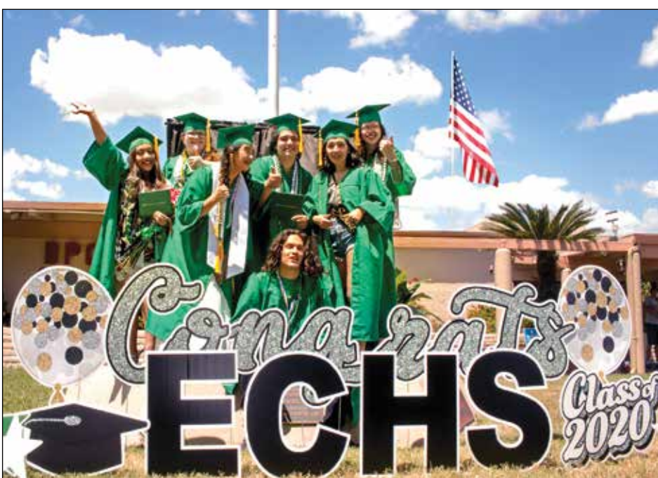
El Camino High School chums mob the dais during drive-through graduation festivities at Carmichael Elks Lodge.