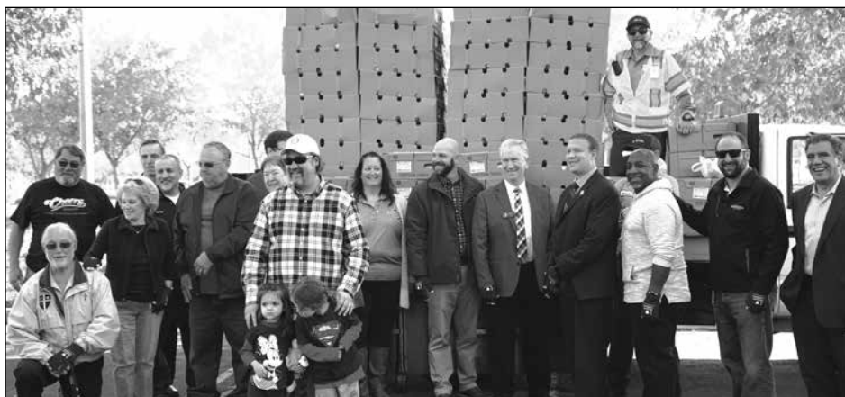
Rancho Cordova City Council, Rotary Club of Rancho Cordova, Grocery Outlet Rancho Cordova and Kiwanis Club of Rancho Cordova members are taking the turkeys to the streets.

Operation Gobble is a philanthropic partnership between Golden State Water, the California Water Association and local and state elected officials. This year, Golden State Water employees distributed more than 8,000 turkeys to local community-based organizations, churches, food banks, senior