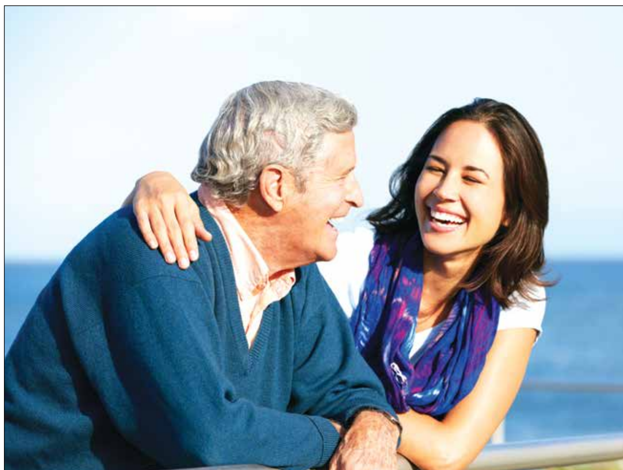
A family caregiver is anyone who helps take care of a family member or friend without any professional training. These caregivers want their loved ones to have the best care possible – at the doctor's office, hospital and home.