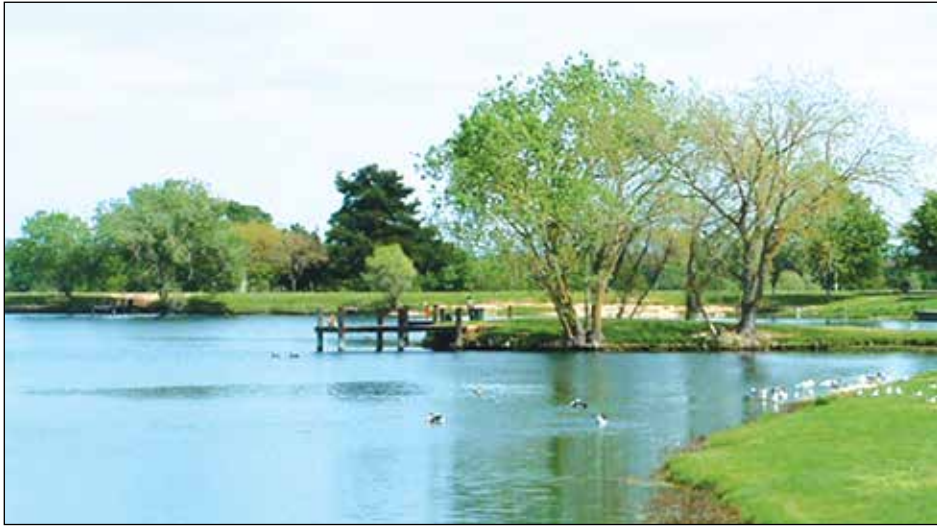
Image of Gibson Ranch Regional Park located at 8556 Gibson Ranch Park Rd, Elverta, CA.