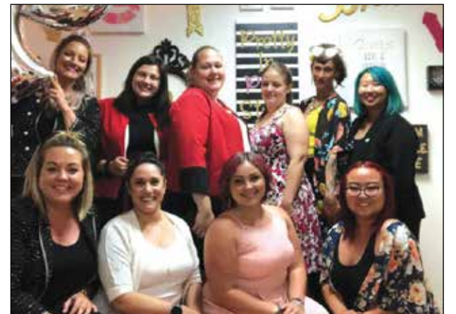
Ladies of the Shine Unit and Fire Unit gear up to bring holiday cheer to our local “grandparents.”

SACRAMENTO REGION, CA (MPG) - It’s time for our annual “Adopt a Grandparent” Fundraiser. Local Mary Kay Sales Directors and Beauty Consultants use their businesses as a way to give back to seniors with a program we started calling “Adopt a Grandparent”. It breaks my heart that each holiday season, many residents of long term care homes are “forgotten”. Nearly 3 million go without visits or gifts. This is where we come in! We put together small gifts to deliver to the residents of care centers that we have chosen to sponsor. Last year our unit sponsored residents at Park Place, Mission Carmichael Health Care Center, and Almond Avenue Residence Club. Such a small gesture can