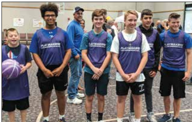
You get to have real fun, and it helps you learn to get through bullying and struggles through sports and recreation.