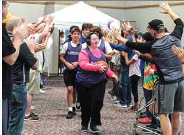
Participants were welcomed onto the court with cheers and high fives.