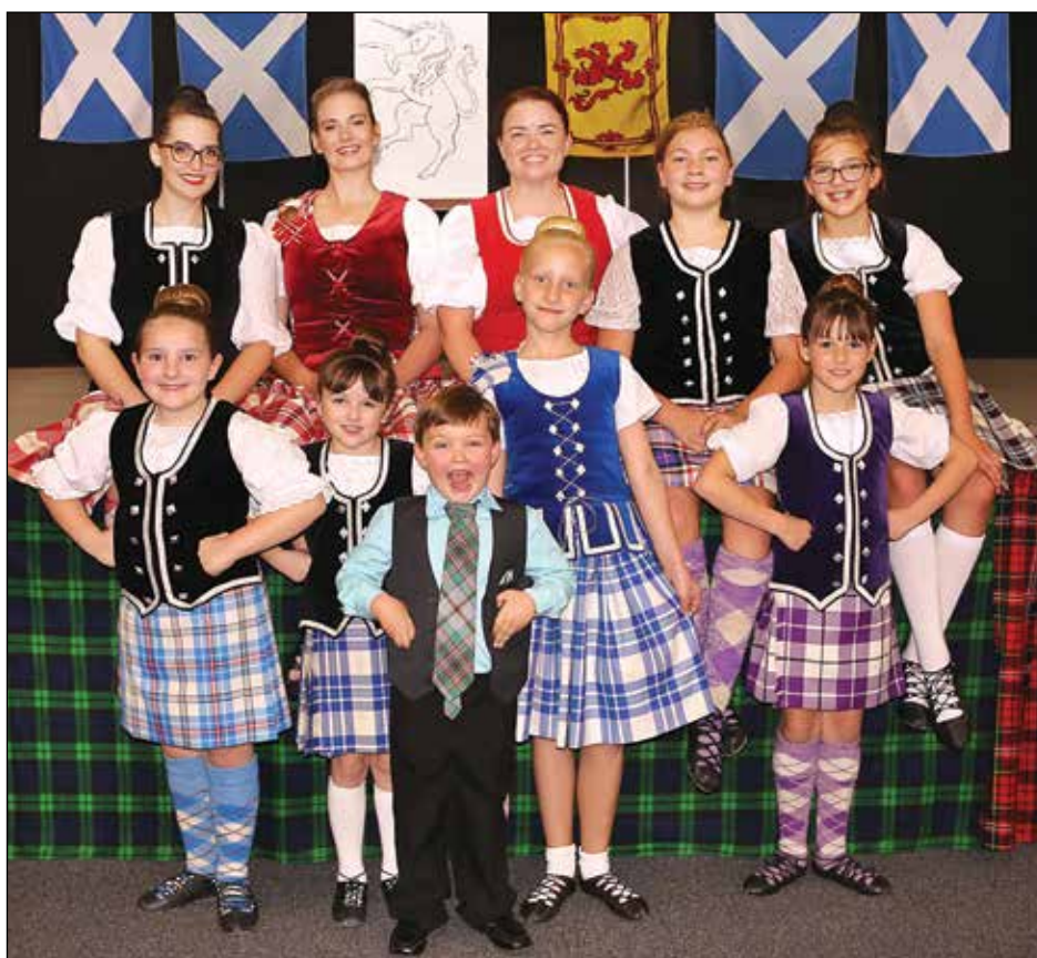
Highland dancers from the Kyla Groeschal Studio (Fair Oaks) entertained at after-service entertainments.

At the colorful 2019 service, 40 tartans - including those of the United States Army, Navy, Marine Corps and Coast