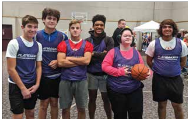
Playmakers events help kids develop confidence and learn leadership skills.

If you would like to learn more about The Playmakers Organization and their work to support at-risk and special needs kids, visit www.ThePlaymakers.org . ★