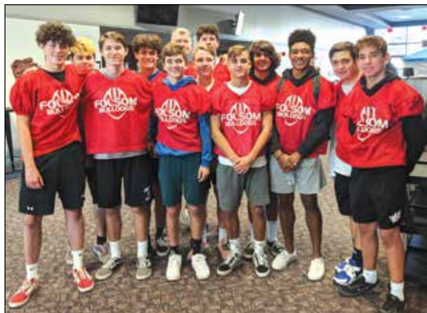
The Folsom High School freshman football team volunteered at the Playmakers event to assist and encourage the basketball game participants.