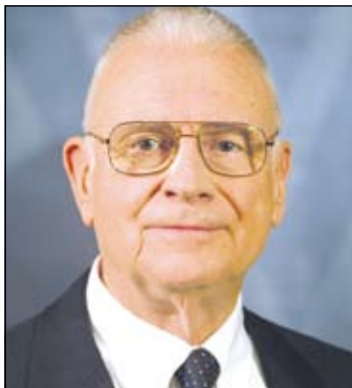
Commentary By Lee H. Hamilton

an expansion of government power without precedent in the modern era. Yet while some members of Congress were informed about it — and all had the opportunity to learn — none saw an urgent need for public discussion. This is astounding. It took the actions of a leaker to spur any real airing of the matter on Capitol Hill.