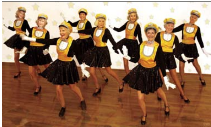
The Classy Tappers dance team are among 16 acts billed at a Mission Oaks Community Center revue on October 6.