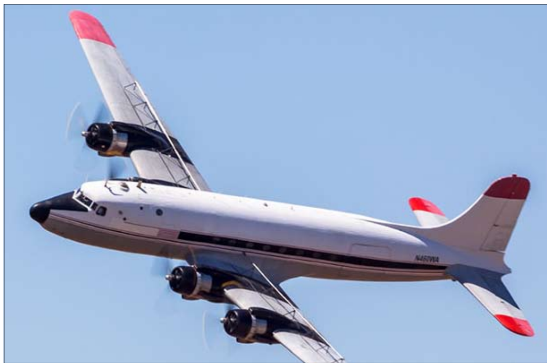
The Berlin Airlift Tribute will honor the greatest humanitarian aviation event in the history of the world.