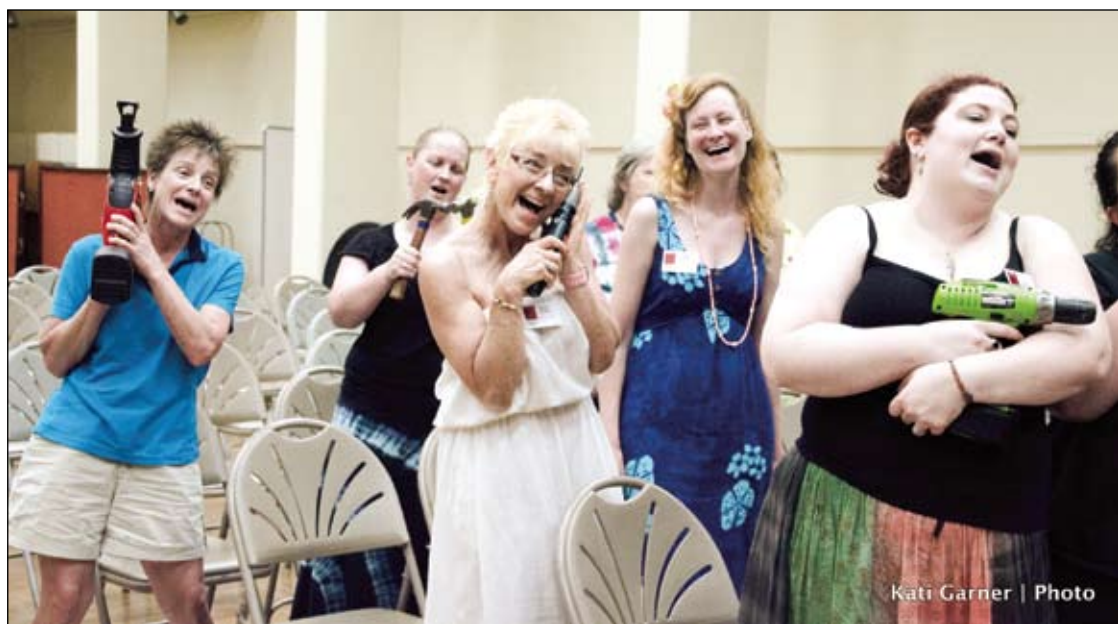
The Sacramento Women's Chorus rehearses "Power Tools Are A Girl's Best Friend" in preparation for their upcoming Oktoberfest Cabaret show.

CARMICHAEL, CA (MPG) - The Sacramento Women's Chorus is excited to present their first Oktoberfest musical variety show, "Willkommen! A Choral Cabaret", which will be held on Saturday, October 19th at the La Sierra Community Center, 5325 Engle Road in Carmichael. The chorus has been diligently practicing and preparing for this special event since moving their rehearsal site to the Arden-Arcade area in July.