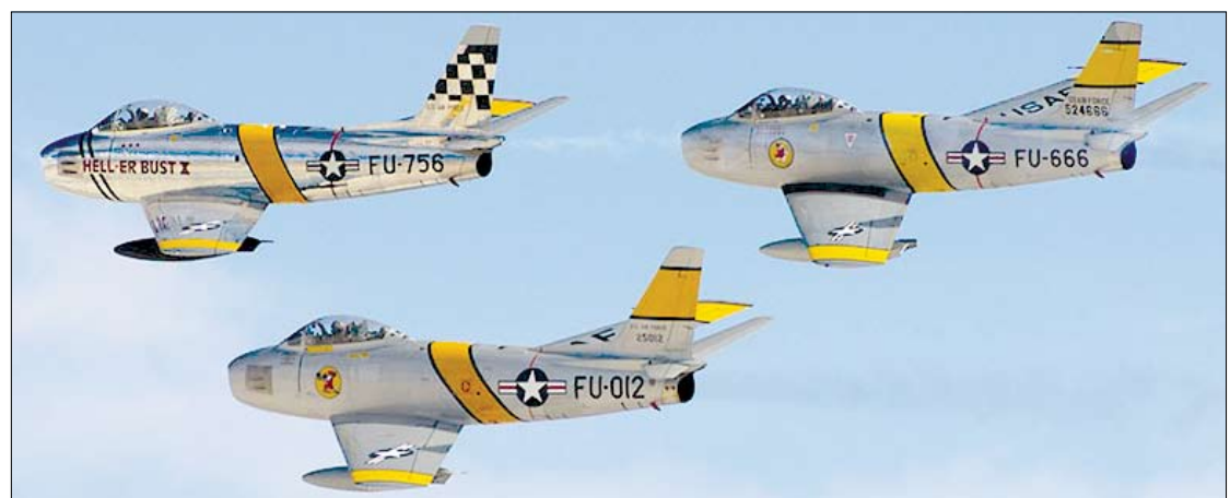
The Bremont Hosreman took off over a decade ago as the worlds only P-51 Mustang formation aerobatic team. They have flown a variety of platforms in formation, working tirelessly to escape gravity. Here they are seen flying the F-86 Sabre Jet.