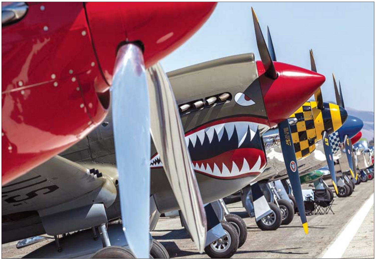
Warbirds Galore in the sky and on the ground The Airshow will be roaring across the skies of our region October 5-6, 2013! The event will offer spine-tingling performances including an international jet team, the Snowbirds, military demonstrations, world-class aerobatics, wingsuit flyers, barnstorming, wing walking, and endless entertainment and displays along the ramp.

the idea of dropping candy bars and chewing gum with handmade handkerchief parachutes while "wiggling" their wings, which alerted the children they were about to receive treats. When news reached the United States that pilots were dropping candy to the young people of Germany, children all over America sent in their own candy to help with the mission. Soon major manufacturers joined in, and by the end, over three tons of candy was dropped on Berlin