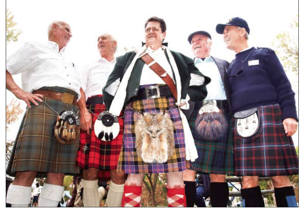
Celtic festival attendees sported sporrans and tartans in Carmichael Park.