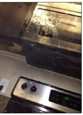
estimated to be less than $1000 and was isolated to the kitchen: stovetop, microwave, cabinets, and floor.

Cooking remains the number one cause of home fires, causing more injuries than any other type of fire. Knowing what to do can make all the difference. Never leave food cooking on the stove, unattended.