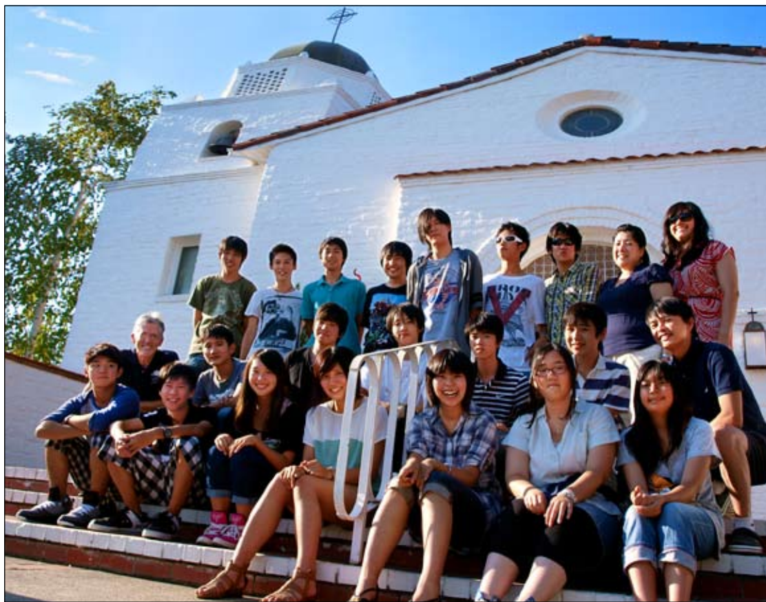
Students from Yokohama's Kanto Gakuin Mastsura School strike a souvenir pose. The teens recently completed a 20-day cultural exchange program based at Carmichael Presbyterian Church.

As with all tourists, American food was a great educator. "They