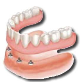
Combination Implants and Dentures

8329 Fair Oaks Blvd., Ste B • Carmichael, CA 95608 (916) 944-7700