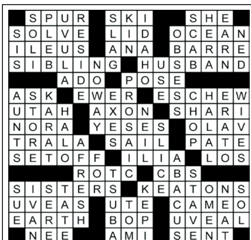
Crossword Puzzle on Page 9

of the California Probate Code. The time for filing claims will not expire before four months from the date of the hearing noticed above. YOU MAY EXAMINE the file kept by the court. If you are interested in the estate, you may request special notice of the filing of an inventory and appraisal of estate assets or of any petition or account as provided in Section 1250 of the California Probate Code.