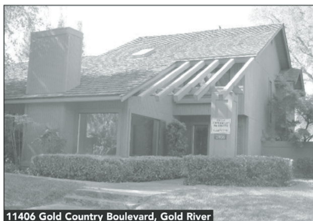
11406 Gold Country Boulevard, Gold River

Nominal Opening Bid: $50,000 GOLD RIVER, CA • 11406 Gold Country Boulevard 3BR 2.5BA 2,044+/- sf. Built in 1988. Approx .05ac lot. Open House: 1-4pm Sun Aug 15th, 22nd and 2 hours before sale.