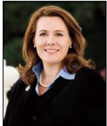
Assemblymember Alyson Huber

As far back as 1989, the Little Hoover Commission issued a report, entitled Boards and Commissions: California's Hidden Government, which found that, "California's multi-level, complex governmental structure today includes more than 400 boards, commissions, authorities, associations, councils and committees. These plural bodies operate to a large degree autonomously and outside of the normal checks and balances of representative government."