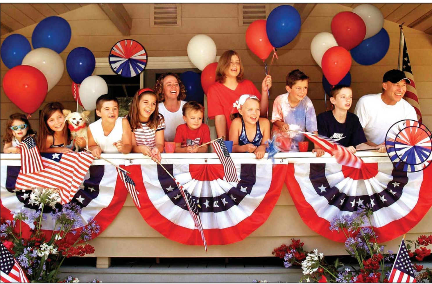
A family of patriots watched the 2009 Fourth of July parade.