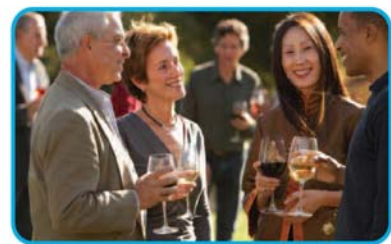
Makes conversations clearer and more enjoyable

You may not always need help hearing. For the times you do, trust Songbird.