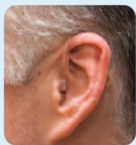
Product worn as shown—hides discreetly behind the ear

*Under typical use patterns, battery lasts for 400 hours of active use (when turned on). Make sure to turn the device off when not in use to maximize battery life. †Less shipping and handling. The Songbird flexfit™ disposable hearing aid is for mild to moderate hearing loss. Not intended for use by anyone under 18 years of age. Hearing loss can be a symptom of a medically treatable condition. Consult your doctor prior to using any hearing aid.