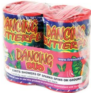
Dancing Butterfly Duo (Phantom)