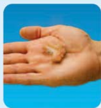
Compact design as shown in hand

Not available in stores Try It Now Risk-Free† Call 1-888-287-4963