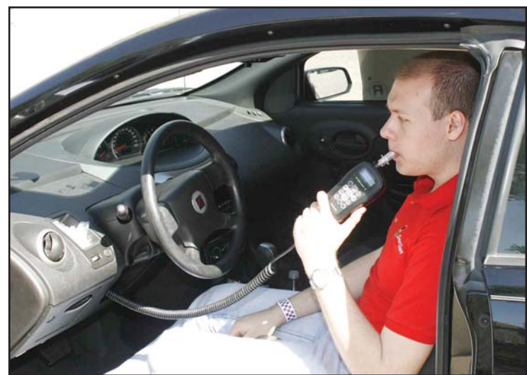
Some drives in California believe that this new law blows.

Five-year pilot program would study effectiveness in selected counties