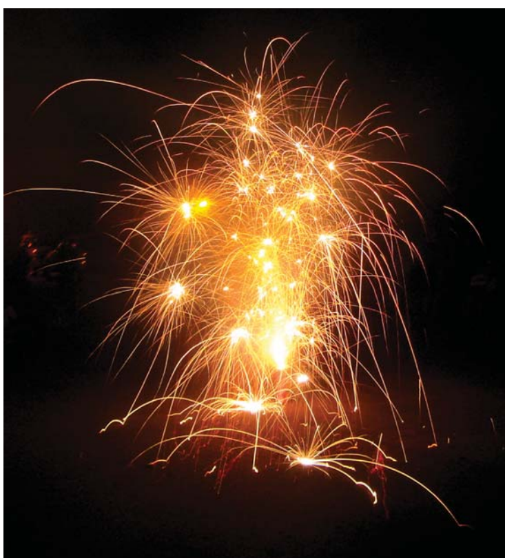
A safe and sane fountain lets the sparks fly.