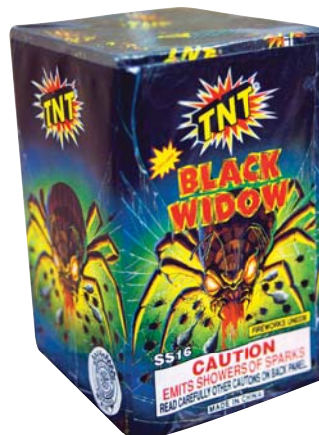
Black Widow (TNT)

Black Widow (TNT), $3 - Created as a quiet cousin to TNT's classic Crickets ($4.99). Just OK unless you like the small and silent type. Has the lowest cost-per-second of all the new fireworks. 42 seconds. 3 Stars