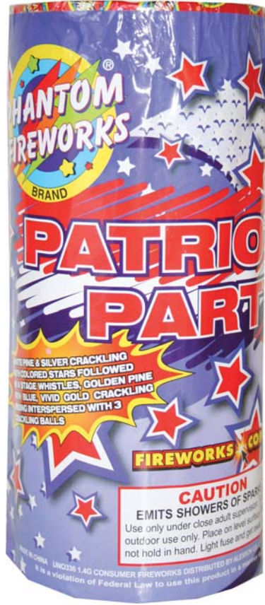
Always use state-approved "safe and sane" fireworks.