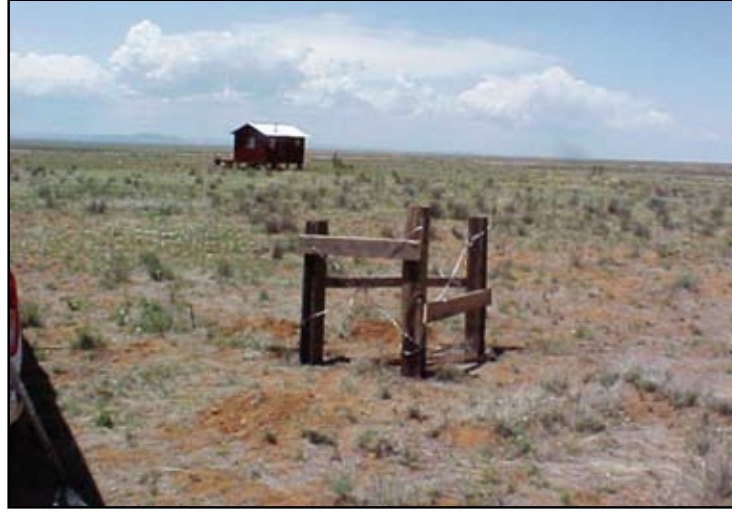
The Half-Red Cabin on South Navajo Loop

U.S. Census Bureau Capture Center Phoenix, AZ