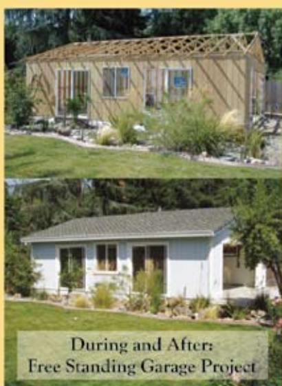
During and After: Free Standing Garage Project