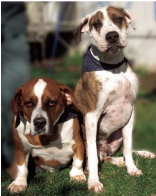
Boo's Pet ID#: A487758 Yoda's Pet ID#: A487757

Boo and Yoda's hard-luck story could have a happy ending if someone like you takes interest their lives today. These boys were brought into the shelter together shortly after their owner passed away. Boo, a 5-year-old Basset hound, and Yoda, a 5-year-old bit pull, have been together their whole lives, and the Sacramento County Animal Shelter is making an effort to keep it that way. Even though they are in a kennel together they are confused