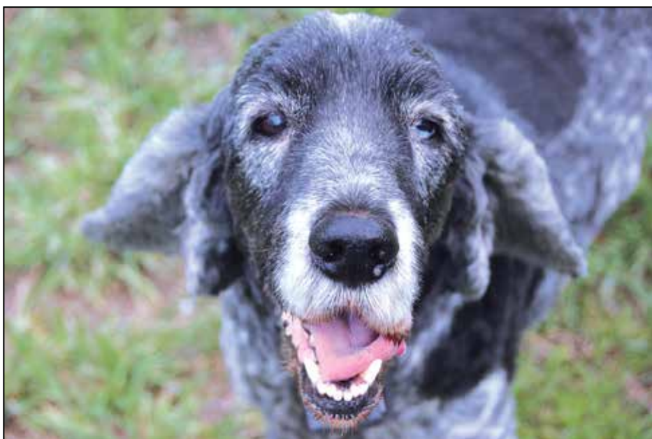
Over the past 15 years, the national nonprofit Grey Muzzle Organization has provided more than $4.6 million in grants to support its vision of "a world where no old dog dies alone and afraid."