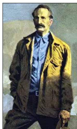
Gifford Pinchot, the founder and first chief of the USDA Forest Service. His 159th birthday is Aug. 11, 2023.

This seems unfair, of course, I mean Pinchot was, as far back as 1905, the founder and first chief of the Forest Service and an early pioneer of the wildland's conservation movement in America. But, as they say in entertainment, you never want to share a stage with a baby or a cute animal, or something to that effect. You get the picture. But even though Pinchot's legacy may not be known to many of us, it doesn't take away from the fact that all who have ever swam in, hiked in, camped in, or otherwise just had fun in a national forest or grasslands pays unwitting thanks and appreciation to Gifford Pinchot—so much