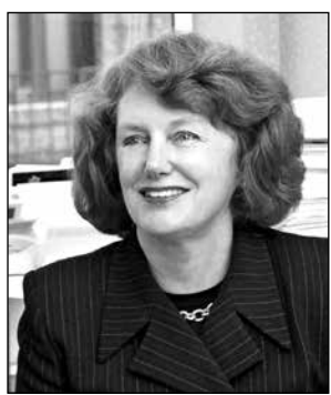
By Sally C. Pipes

even further. It would empower Medicare to set prices for 20 drugs in 2026, instead of the current ten under the IRA. In 2027 and every year after, that number would jump to 40, many more than the IRA stipulated. The House bill is even more radical, extending Medicare's price controls to the private insurance market.