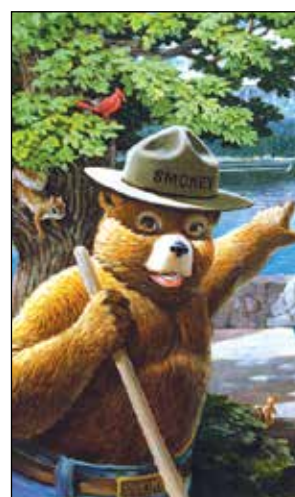
Smokey Bear celebrated his 79th birthday on Aug. 9, 2023.

so that the Forest Service has a national forest named in his honor.