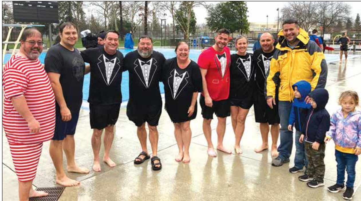
Cordova Recreation & Park District (CRPD) Board of Directors and staff take the plunge to raise funds for the Cordova Recreation & Parks Foundation.