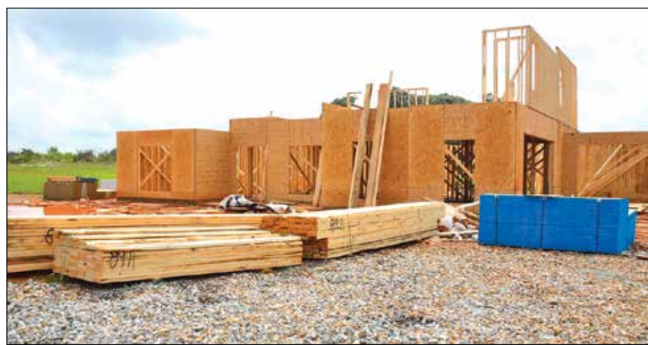
While we will see challenges in 2023, we believe the market will likely gradually improve as buyers continue to adjust to the new normal in mortgage rates.