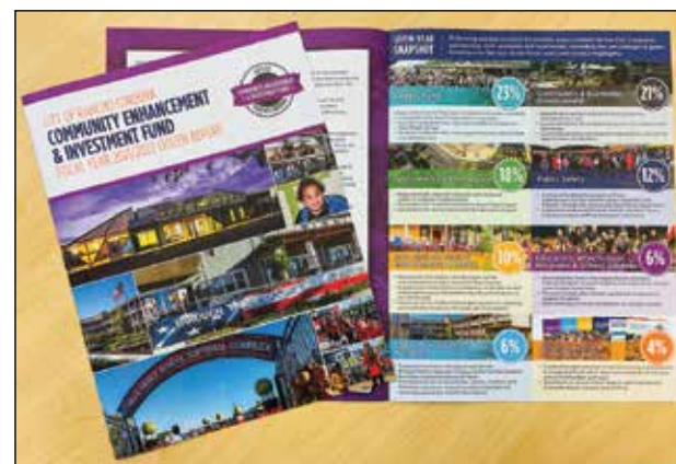
Thanks to Measures H and R, the CEIF is estimated to have generated approximately $23.6 million in sales tax revenue.

The Community Enhancement & Investment Fund is supported by both Measure H and R, which are half-cent, sales tax measures approved by voters in 2014 and 2020. During the fiscal year, the fund is estimated to have generated approximately $23.6 million in sales tax revenue. The city began receiving additional Measure R revenue