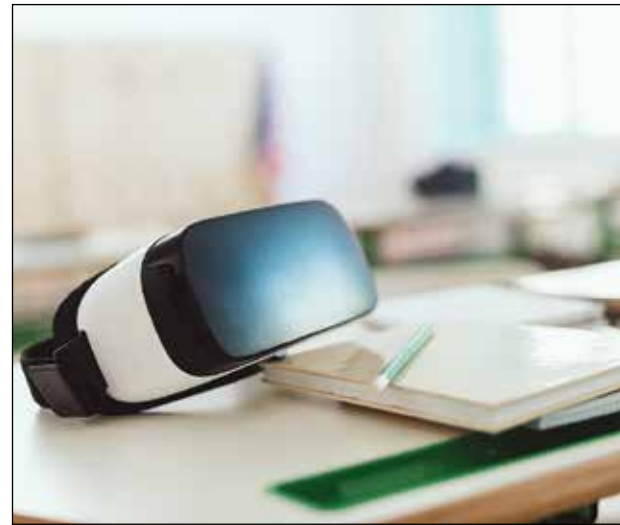
Firefighter training is unique and quite often comes with a calculated risk. VR technology can help reduce some of that risk during training by exposing the firefighter to the experience they will be dealing with firsthand in a completely virtual atmosphere, without the risk.

will help raise the bar in training, while also providing the added benefit of helping save lives and conserve valuable resources.