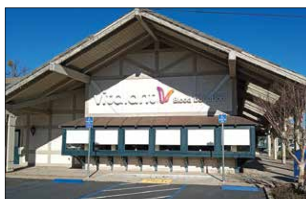
The Vitalant blood donation center at 11713 Fair Oaks Boulevard in Fair Oaks will be temporarily closed for at least eight weeks beginning February 14.

The Fair Oaks center has 15 donation stations, that on average, receive 600 whole blood donations per month. Each whole blood donation takes about 45