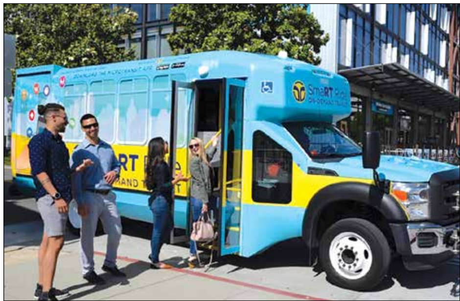
SacRT's mission to dramatically improve safety and security in every corner of its system has resulted in several other national award recognitions.

Continued from page 1 and security. I applaud SacRT for continually going above and beyond for our community."