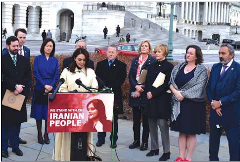
Ami Bera, M.D. (D-CA) and Kevin Kiley (R-CA) participated on January 27, 2023, in a bipartisan event at the U.S. Capitol in support of human rights protestors in Iran.