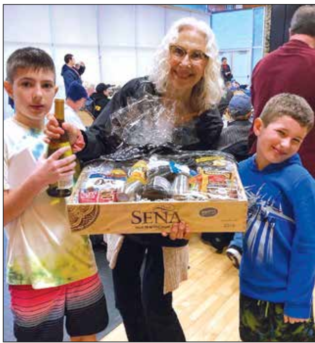
Cordova Recreation and Parks Foundation (CRPF) helped raise funds raffling gifts to support residents to participate in programs and activities they wouldn't be able to afford otherwise.