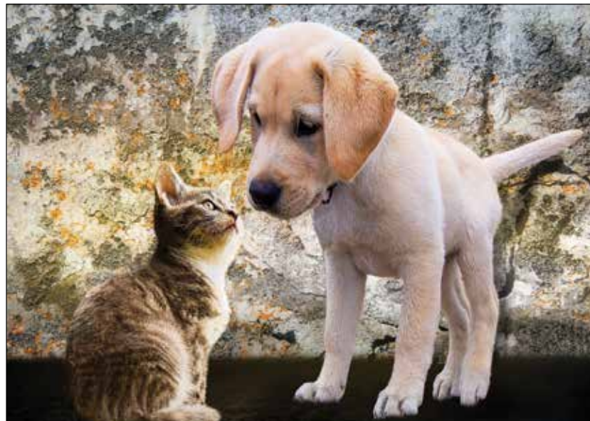
If you are interested in giving a shelter pet a second chance at a new life, the Bradshaw Animal Shelter has a wide variety of animals available to adopt today.

If you are interested in giving a shelter pet a second chance at a new life, the Bradshaw Animal Shelter has