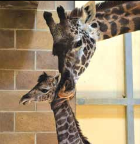
Get a Sneak Peak at Momma and Baby Giraffe.