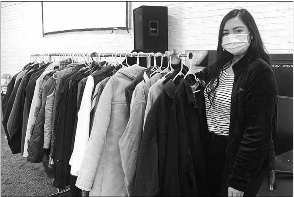
Local respite centers are now open and available to serve needy individuals and families.

By Traci Rockefeller Cusack, T-Rock Communications