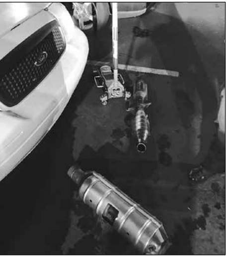
Stolen catalytic converters are a premium because they can’t be purchased used.

RanchoCordovaPD.com. If you see an item left behind at the scene of the theft, please leave it in place and call the non-emergency line at 916.362.5115 to request RCPD to respond.