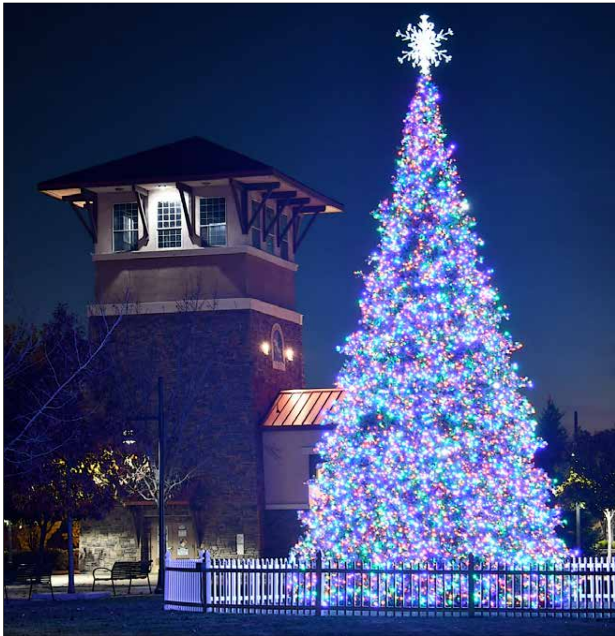
The Christmas tree at Village Green Park will be shining bright every night.

By Shelly Blanchard, Cordova Community Council