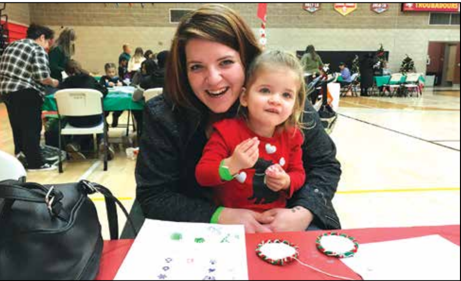
A Women’s Empowerment graduate and her daughter make gifts for loved ones at last year’s Holiday Craft Party. This year, the nonprofit that helps homeless women is seeking help to provide holiday gifts and a Craft Party in a Box for each family who has graduated from the program.