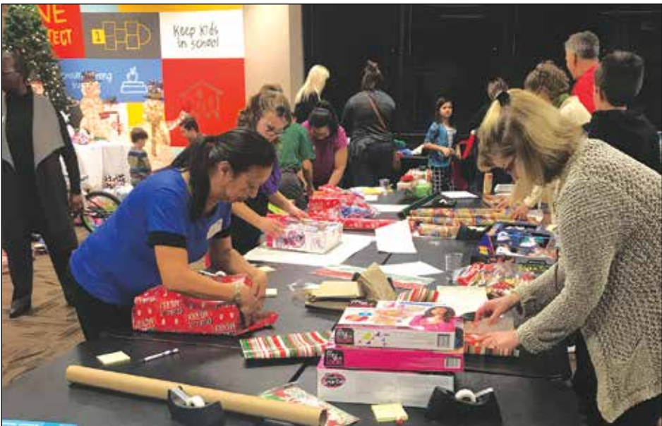
United Way Volunteers wrap holiday gifts for local foster youth as part of a past volunteer experience.