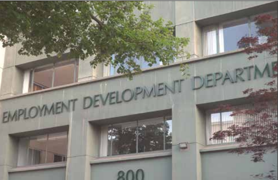
In a sharply worded letter, the district attorneys asked Gov. Gavin Newsom to get personally involved and immediately implement changes at the state unemployment department.