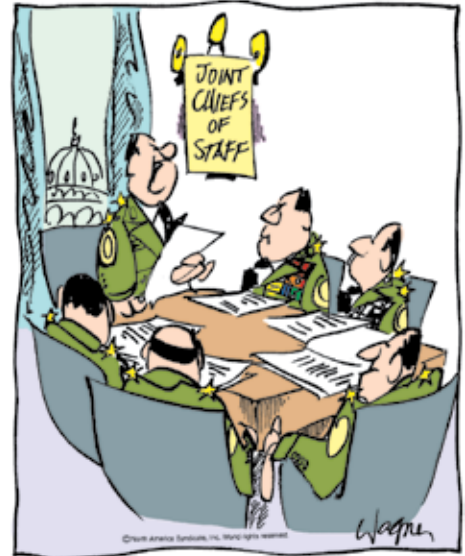
"We've lost three more generals to the TV networks.'