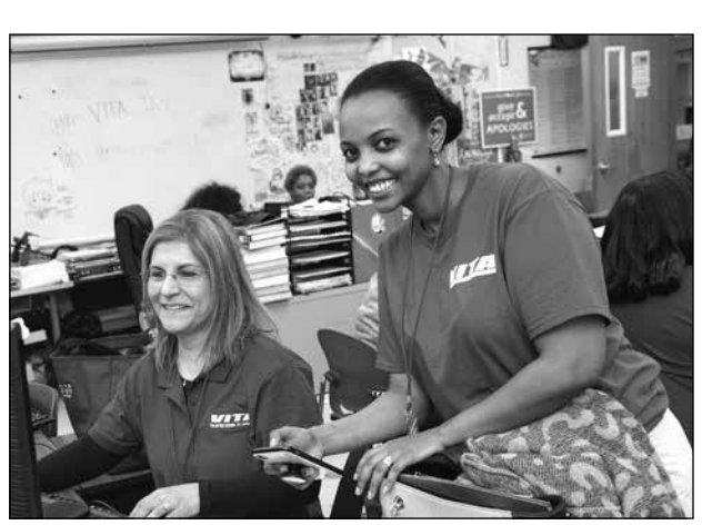
United Way's Free Tax Prep program volunteers prepare to assist a local family with filing their taxes for free last year.

For nearly 100 years, United Way California Capital Region has brought local people together to make community change happen. Today, the nonprofit is bringing people together across Amador, El Dorado, Sacramento, Placer and Yolo counties for its Square One Project, a 20-year promise to significantly increase the number of students in our region who graduate from high school ready for success in college and beyond. United Way believes ending poverty starts in school and is working to ensure kids meet important milestones and their families receive support and resources. To learn more and make a donation, visit