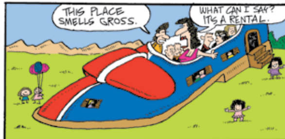
THE OLD WOMAN WHO LIVED IN A BOWLING SHOE KORRAS