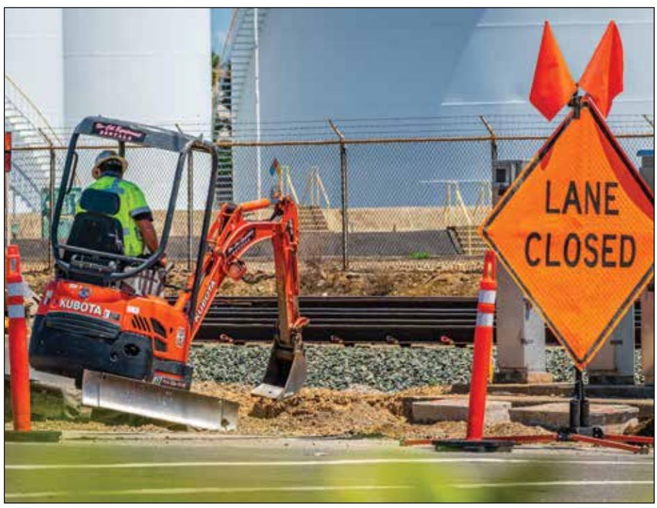
Projects like the Folsom Boulevard Beautification and Sunrise Boulevard Rehabilitation have made much headway in Rancho Cordova's infrastructure.