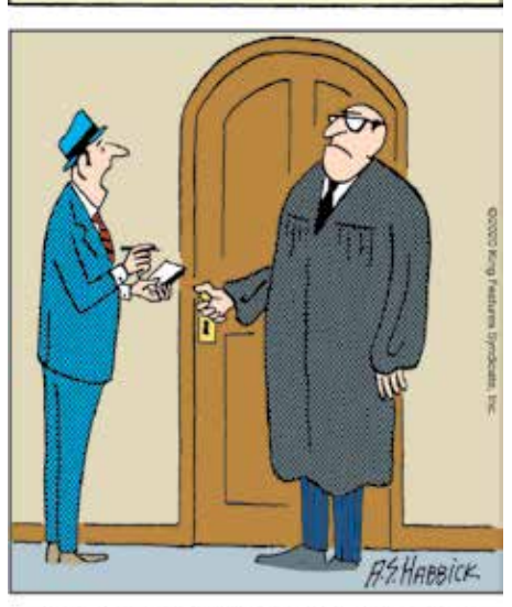
"Your Honor, do you think the jury will take your advice or just use common sense?"