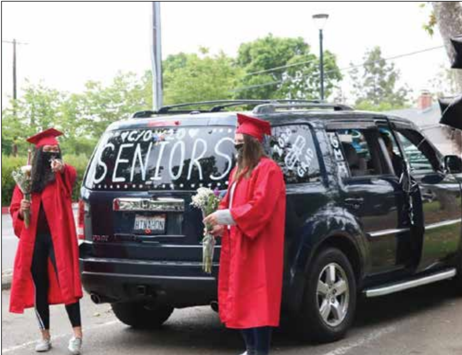
Cordova High students and parents got to enjoy the achievement of youth: Graduation 2020! Photo: FCUSD Cordova High celebrated in Cordova Lancer red! Photo: FCUSD