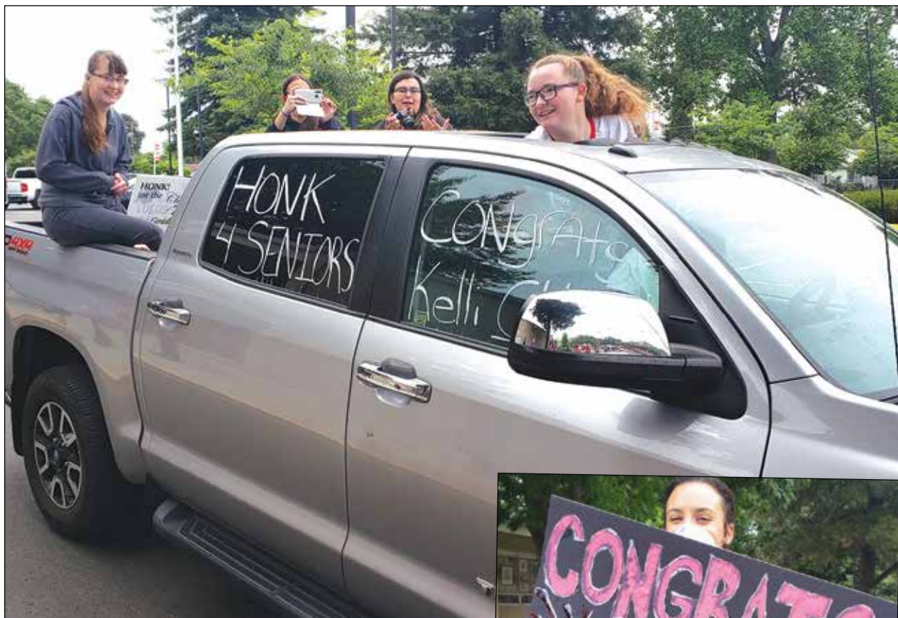
Above: Honking for Seniors, the Cordova High School car parade was a wild celebration for 2020 graduates. Right: Students who participated in various programs such as STEM and ETS were sent to their promising new fields.