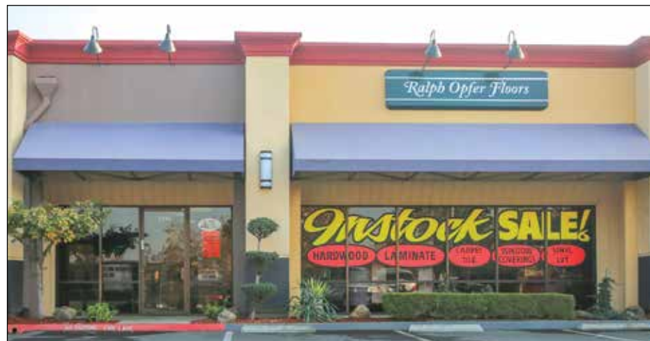
Ralph Opfer Floors, Inc. can be found at 3330 Mather Field Road.

to be back open, but I also think that people are going to be leery . . . They've made us all so scared that people don't want to come out of their houses, and they don't want anybody else to come in."