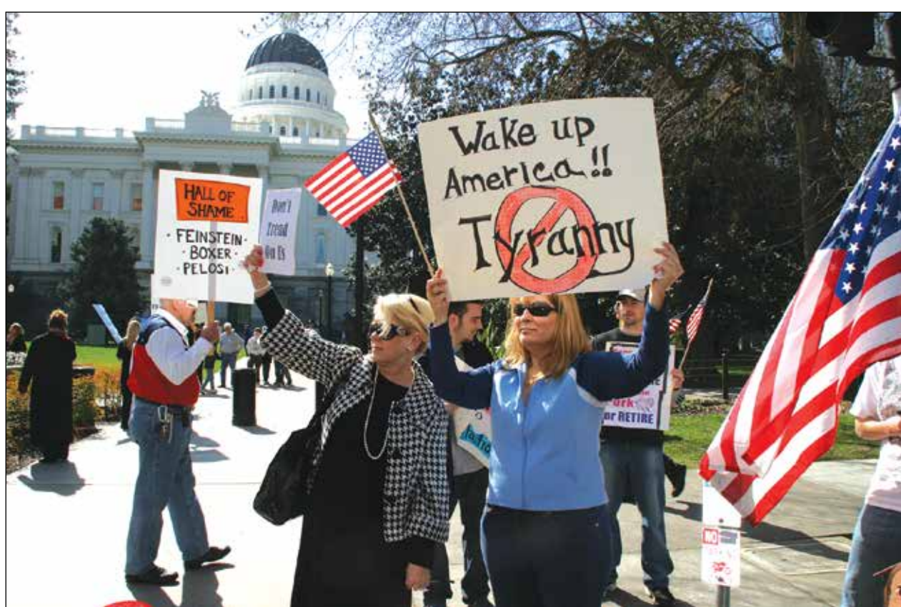
It has been ten years since this capitol rally photo, and the same tired politicians, Pelosi and Feinstein are still trying to control your lives.