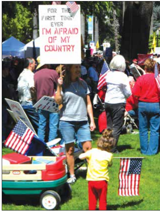
Watch out Governor, this little girl is almost old enough to vote now!

dialogue we should all hope to see. It isn't the good people of China responsible for this Wuhan virus. It should be stated from now forward that the Chinese Communist Party is to blame, not just "China." But governments that want control don't put a spotlight on governments that have control. Do you ever hear Leftists talk about the millions of slaves in China? But they do talk about reparations for people who were never slaves. The same people who were finally really benefitting from the great economy prior to the virus outbreak.