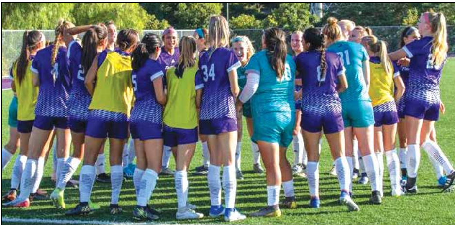
The Falcons looked ready to defend the home turf prior to Tuesday’s loss to CRC.