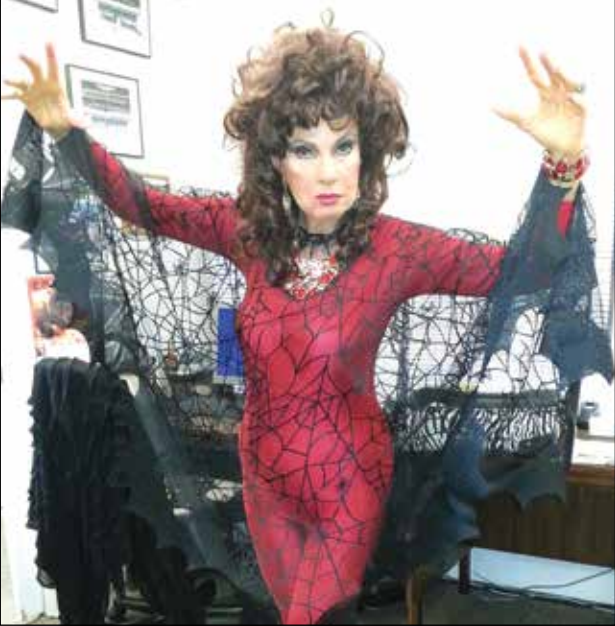
Spooky Me - Happy Halloween!

Young women believed that they could divine the name or appearance of their future husband by doing tricks with yarn, apple parings or mirrors. By the late 1800s, there was a move to mold Halloween into a holiday more about community and neighborly fun than about ghosts, pranks, and witchcraft. Today's Halloween traditions may even dates back to the early All Soul's Day