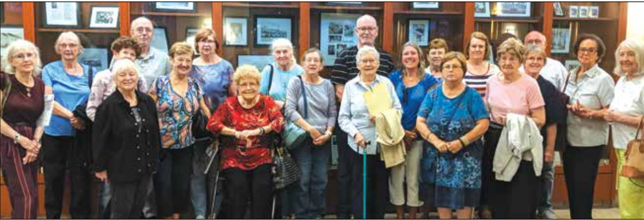
Residents of Rancho Cordova’s Mobil Country Club senior community addressed the City Council about the financial hardships they are facing due to ever-increasing rental costs.