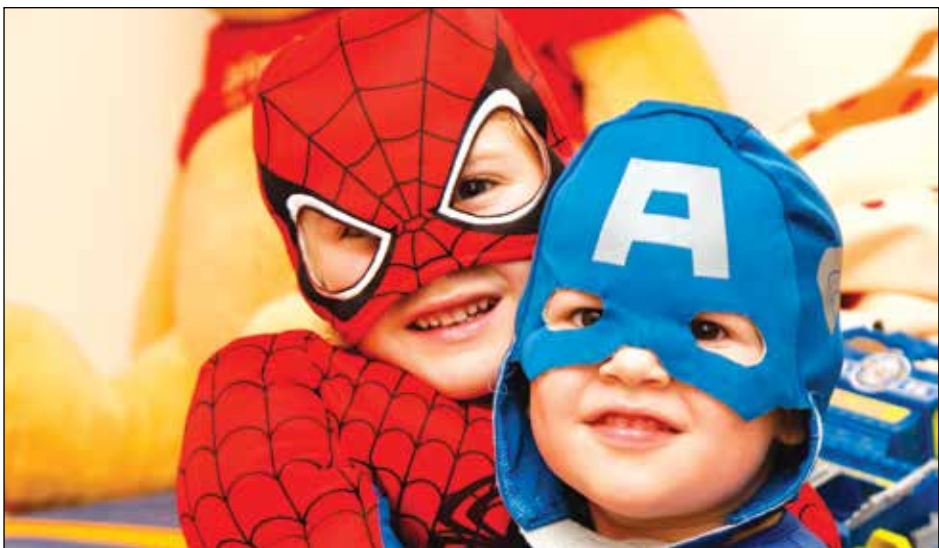
Without proper safety precautions, we run the risk of turning good times into the wrong kind of scary ones.

research, between 2012 and 2016, decorations were the item first ignited in an estimated average of 800 reported home structure fires per year, resulting in an average of two civilian deaths, 34 civilian injuries and $11 million in direct property damage. The decoration was too close to a heat source such as a candle or equipment in almost half of these fires. NFPA offers these tips to stay safe during the spooky season: Costumes: Avoid fabric that billows or trails behind you, as these can easily ignite. If you are making your own costume, avoid loosely woven fabrics like linen and cotton, which can be very flammable. Decorations: Many common decorations like cornstalks, crepe paper, and dried flowers are very