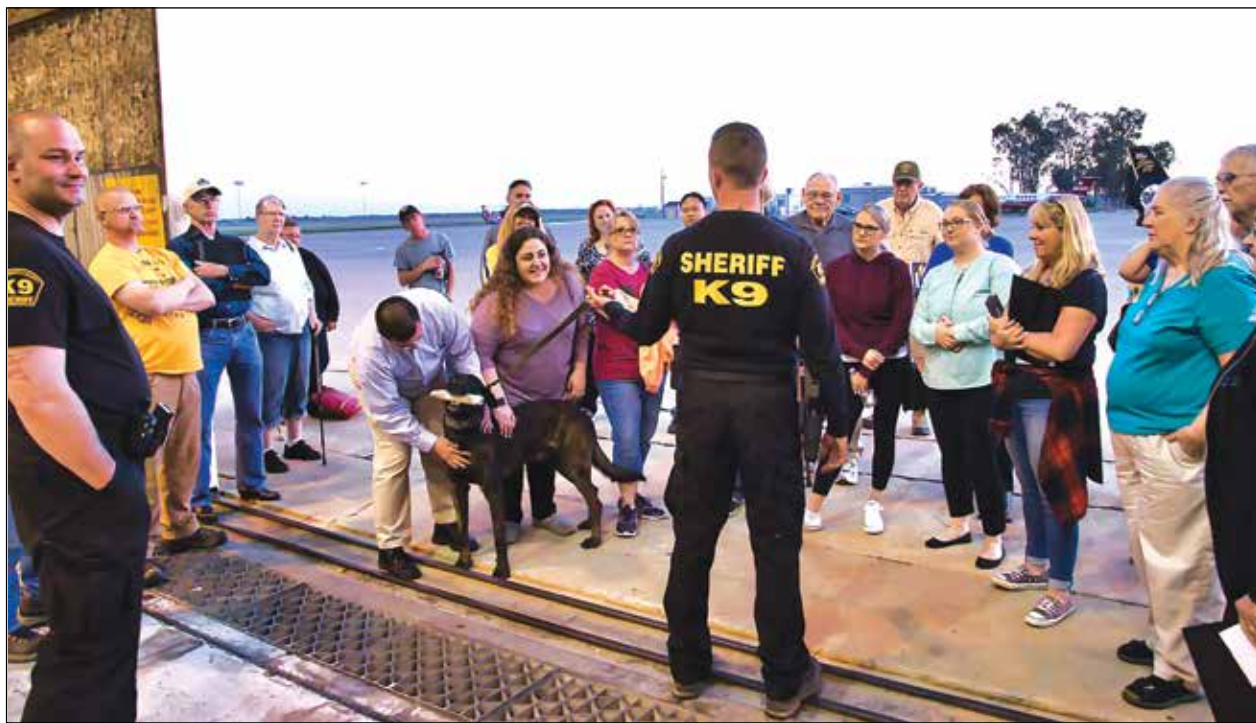
K9 presentations are a popular demonstration at the Citizen's Academy.

By Ashley Downton, City of Rancho Cordova