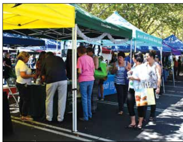
Everything from financial investment to sports clubs attracted interested attendees casually walking in the shade.

The Rancho Cordova Chamber of Commerce extends its gratitude to its Main Sponsor : KP International Market; Presenting Sponsors : Chick-fil-A, Elliott Homes,