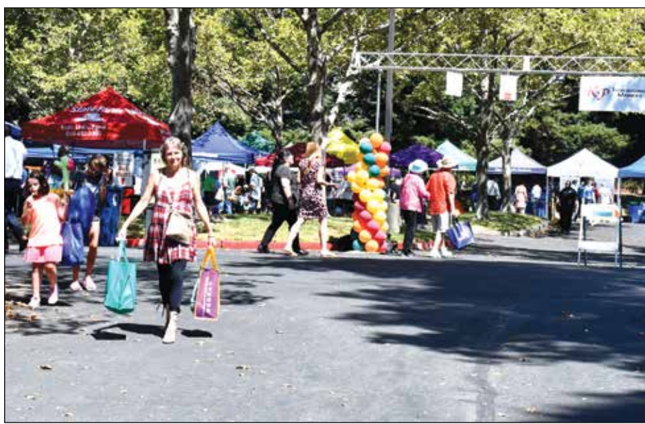
Attendees came out ahead with bags full of gifts, promotionals, food and business connections at the Business to Community Expo.