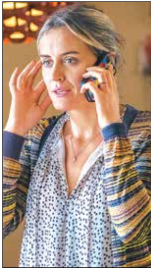
Taylor Schilling (pictured) locked it down in a series finale full of endings happy, heartbreaking and even hopeful.

Cheers to Shark Week for taking a fun-size bite out of the summer schedule. From the goofy Shark Trip: Eat. Prey. Chum. with Joel McHale and Rob Riggle to the gut-twisting shipwreck tale of Capsized: Blood in the Water , starring