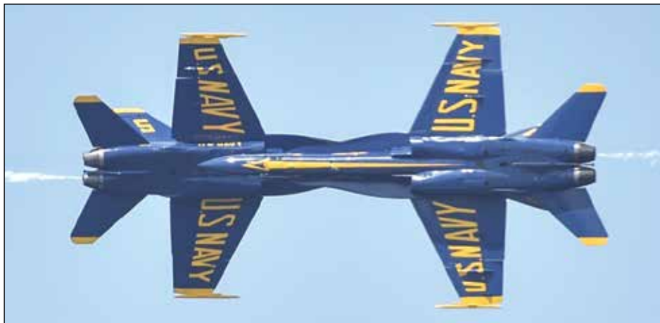
U.S. Navy Blue Angels to Headline the October Show.

Continued from page 1 Fox Johnson at Liz@californiacapitalairshow.com or 540-632-1696 Established in 2004, the California Capital Airshow 501(c)3 plans and operates the exciting, family-friendly annual