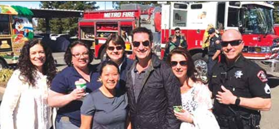
LRC enters it fourteenth year and boasts more than 250 alumni – many currently serving in community leadership roles throughout the city and region.