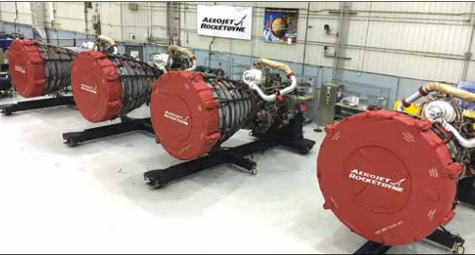
Aerojet Rocketdyne delivered four RS-25 engines for integration with NASA's Space Launch System core stage from its facility at NASA's Stennis Space Center to NASA's Michoud Assembly Facility.