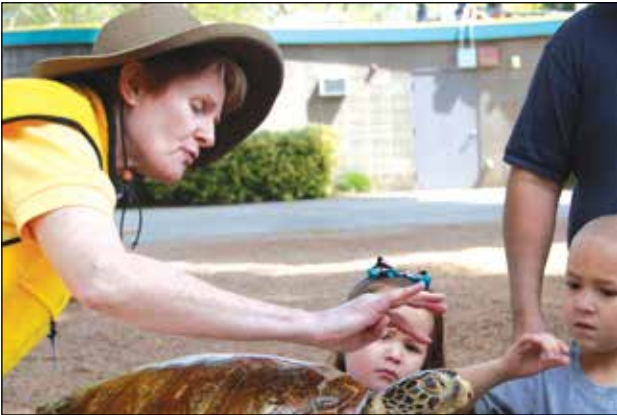
Counselors reach kids and inspire them to care about wildlife, wild spaces and learn how to help protect them.