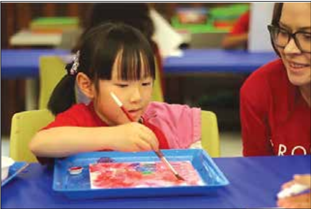
Full-day art camps are designed to support campers as they explore, imagine, experiment and create.