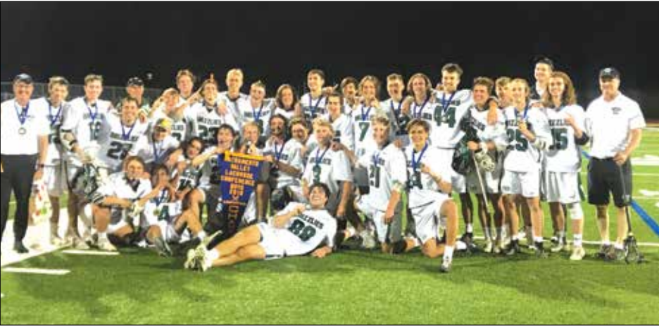
Congratulations GBHS Varsity Boys' SVLC Champions 2019! Back to Back!

Cordova will take part in their final meet of the season this Saturday, June 1, at the Golden West Invitational at Oak Ridge High School in El Dorado Hills, CA. ★