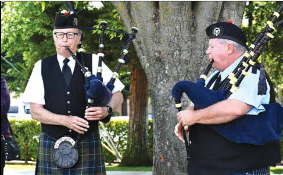
The bagpipers added reverence and grace to the ceremony.