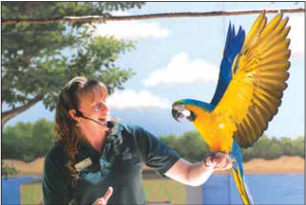
Camps take place in an exciting atmosphere that allow camp counselors a unique opportunity to reach kids and inspire them.