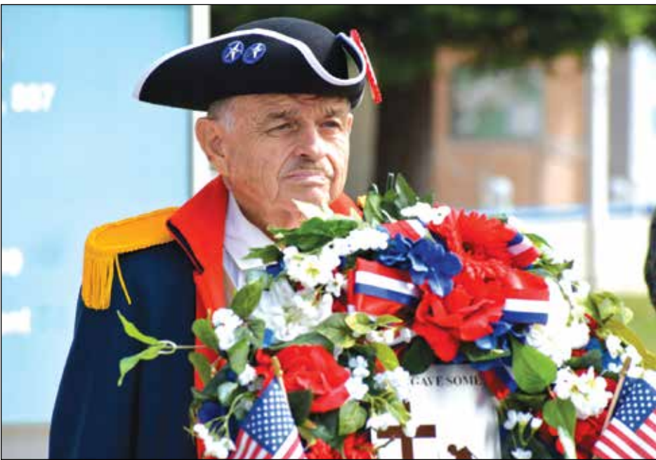
Remembering all those who came before us in conflicts and wars past.