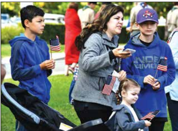
Young families learned more about what it takes to be a free nation.