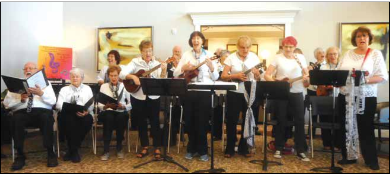
Singing for Fun’s ukulele ensemble: the Uk-u-Ladies.

The singers performed such tunes as “When You’re Smiling”, “It’s a Wonderful World”, “Up a Lazy River”, “Jeepers Creepers”, and “We’ll Meet Again”. The Uk-u-Ladies, the group’s ukulele ensemble, provided toe tapping beats to tunes like “Ain’t She Sweet” and “Yes, Sir, That’s My Baby”. There were train whistles for “Chattanooga Choo Choo,” rhythmic