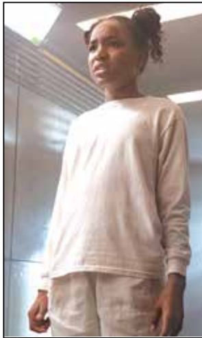
The vampire thriller's season finale boldly previewed a distant future where Virals ruled the food chain.

for barely planting the seeds of its TV future. At the tech giant's unveiling of their new streaming service, we heard a lot about their stars (Oprah! Aniston! Momoa!) but saw