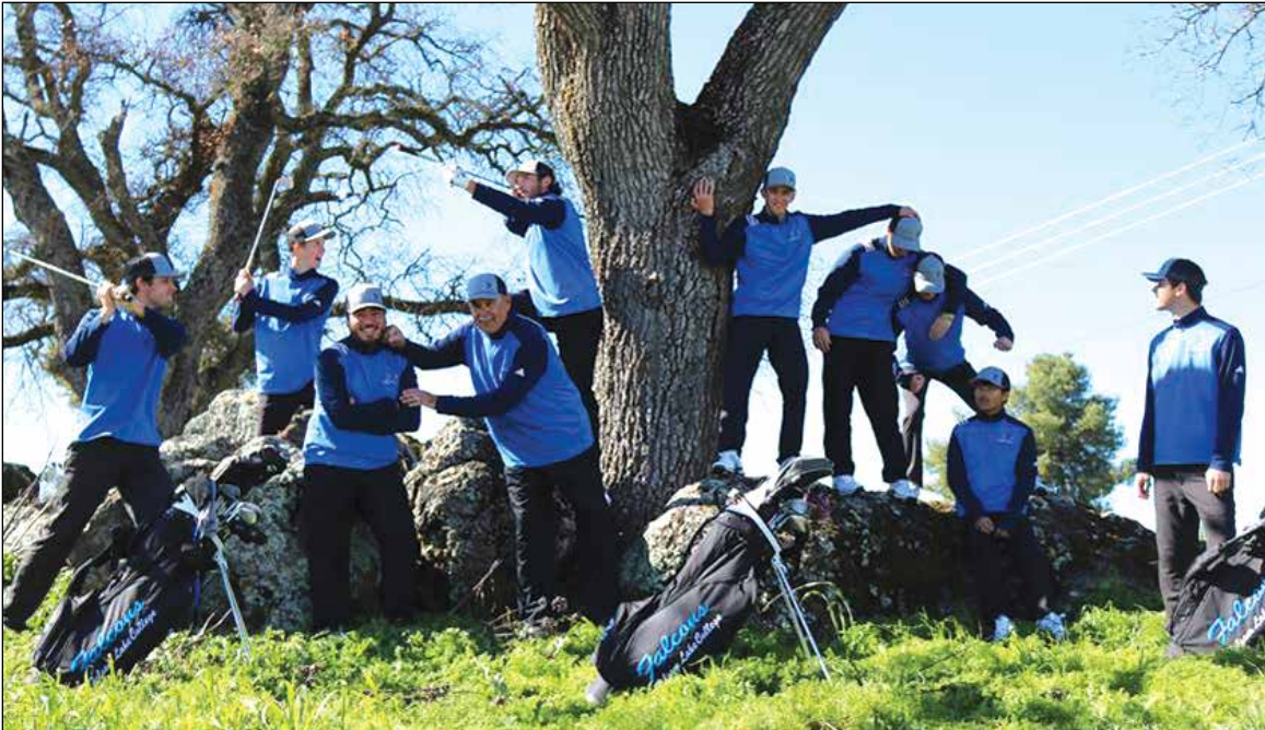
The FLC men's golf team is a loose bunch after winning 7 of their last 8 tournaments.