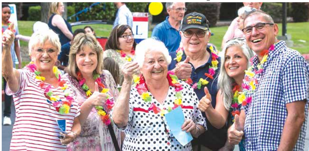
This year's focus was "Creating Healthy Communities through Civic Engagement."