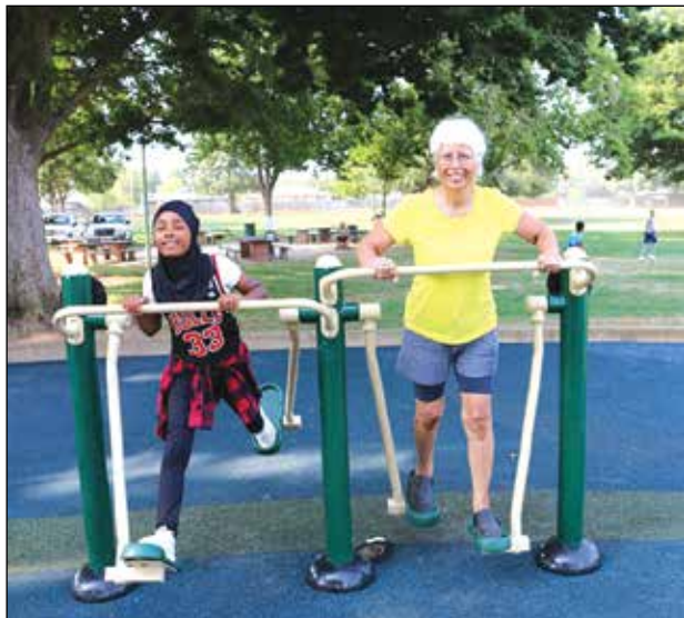
Beyond the health benefits, the District felt that outdoor fitness courses also provide a welcoming social environment.

Beyond the course, CRPD's new Walk with Ease (WWE) program, developed by the Arthritis Foundation, will contribute