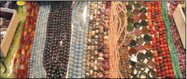
Beautiful, polished stones have been strung by hand in a variety of colors and sizes to create one of a kind necklaces for sale during the Gem Show (above).

The Walk with Ease program will be offered three times per week for six weeks by certified and trained instructors. The classes are ideally suited for seniors 50+ who are interested in a low-impact exercise program in their local community, especially those looking to manage a chronic condition. The program is scheduled to begin Monday, April 1 at 10:30 a.m. For more information, visit crpd.com/programs/active-senior .