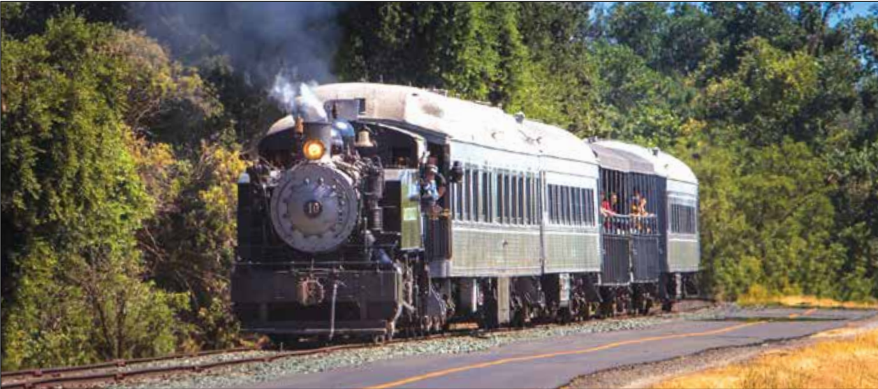
Diesel or steam, excursion train ride guests delight in the sights, smells and sounds of an authentic, historic locomotive as it rolls along the levees of the Sacramento River.

Excursion Train Rides Resume on April 6 & 7