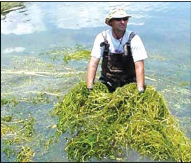
Aquatic invasive plants have no known natural controls in the Delta and negatively affect the ecosystem by displacing native plants.

An extensive water quality-monitoring program is carried out by DBW to ensure compliance with all water quality standards,