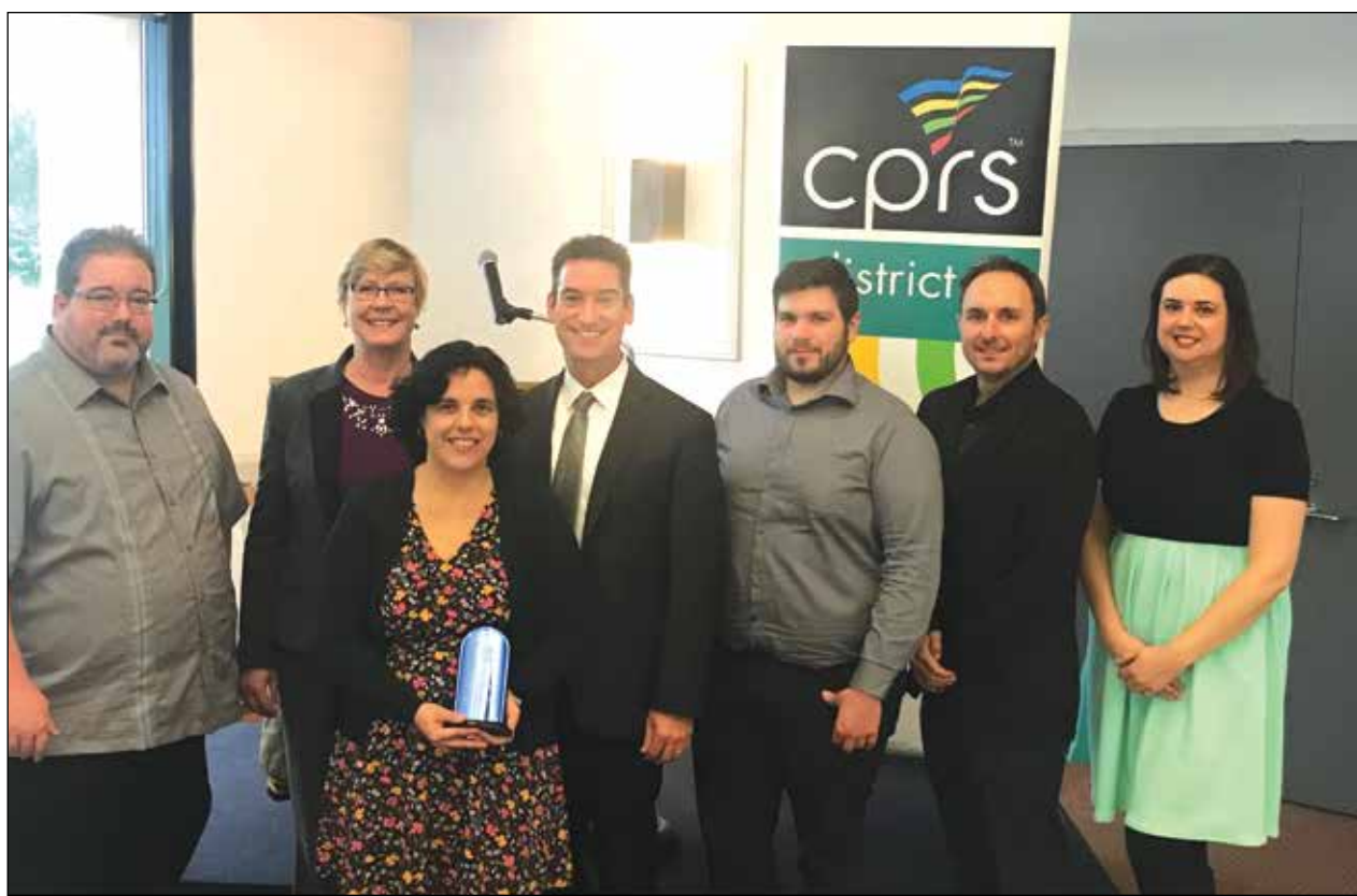
CRPD wins 'Excellence in Design' Award for fitness course and launches new program at Lincoln Village Community Park.

CRPD Receives Recognition for Dedication to Community Health