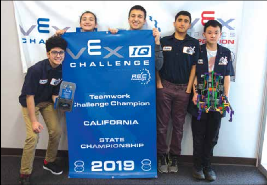
The school's Riverview Rockets robotics team competed in three robotics tournaments.