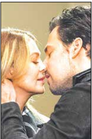
Ellen Pompeo, pictured, with Giacomo Gianniotti scrubbed in to her internship, and we are still picking, choosing and loving her.

Cheers to John Mulaney for bringing NBC's Saturday Night Live back to life. After months of uneven hosts, the stand-up comic's second stint