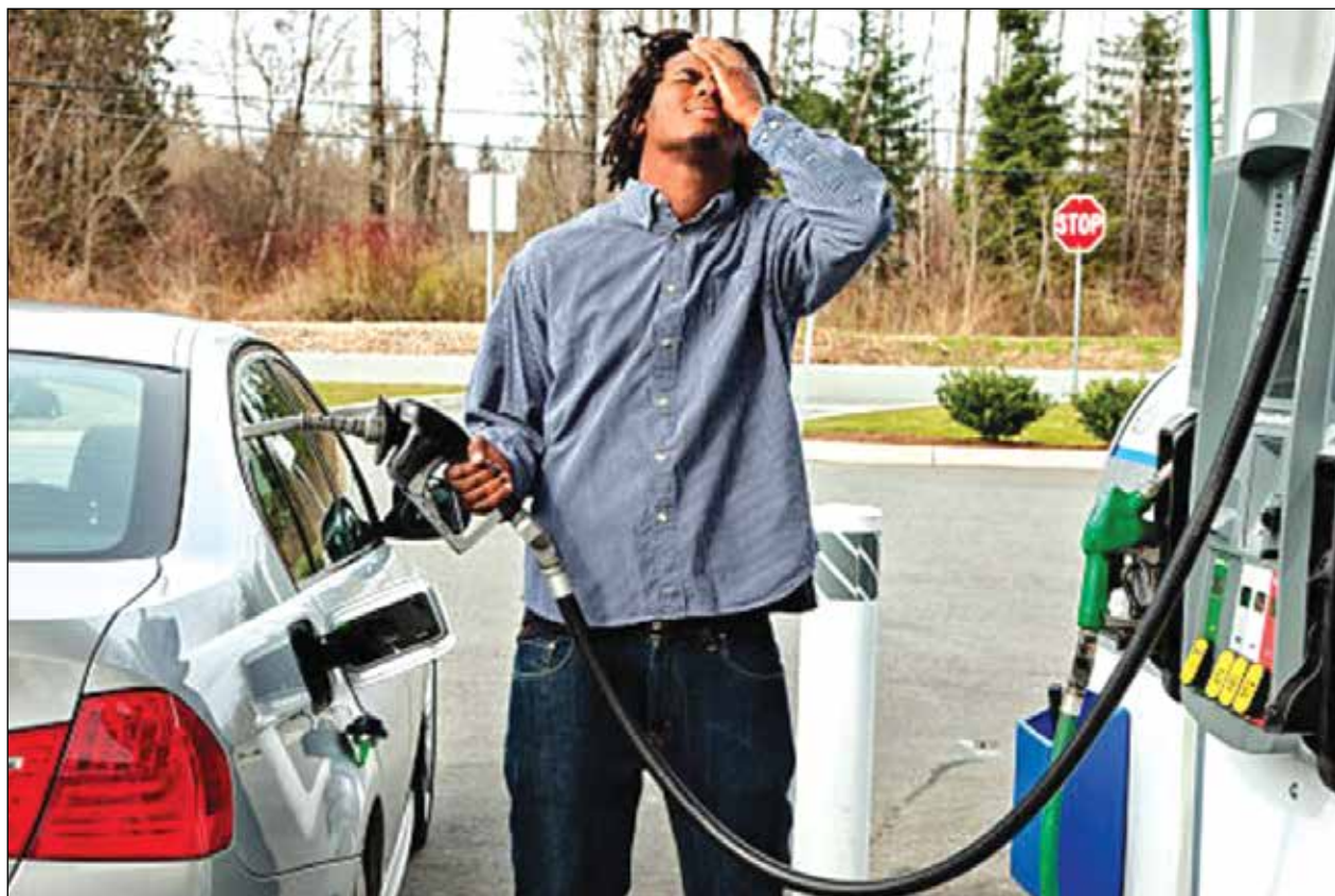
Will Californians ever strike a blow for lower taxes and gasoline prices? MPG stock photo