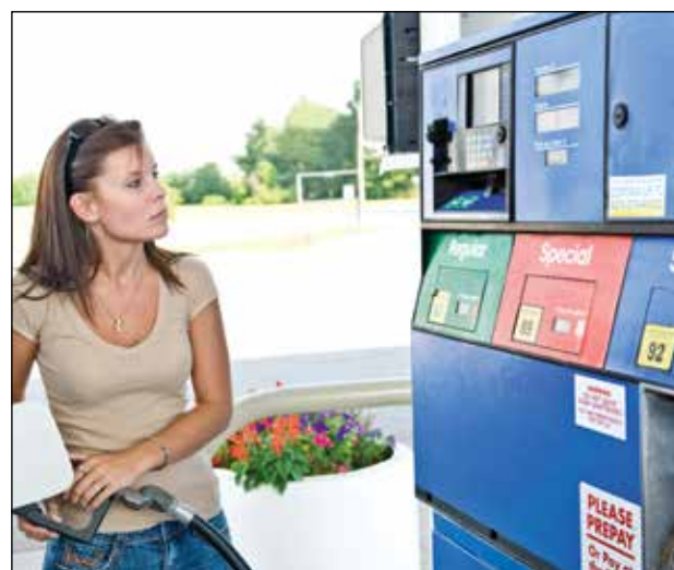
Last year's 12-cent-per-gallon gasoline tax increase pushed the state's gas tax to 55.22 cents per gallon, the second highest in the nation.