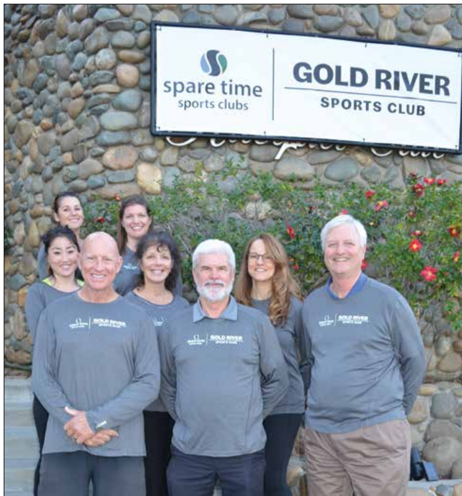
The staff at Gold River Sports Club welcome the change.