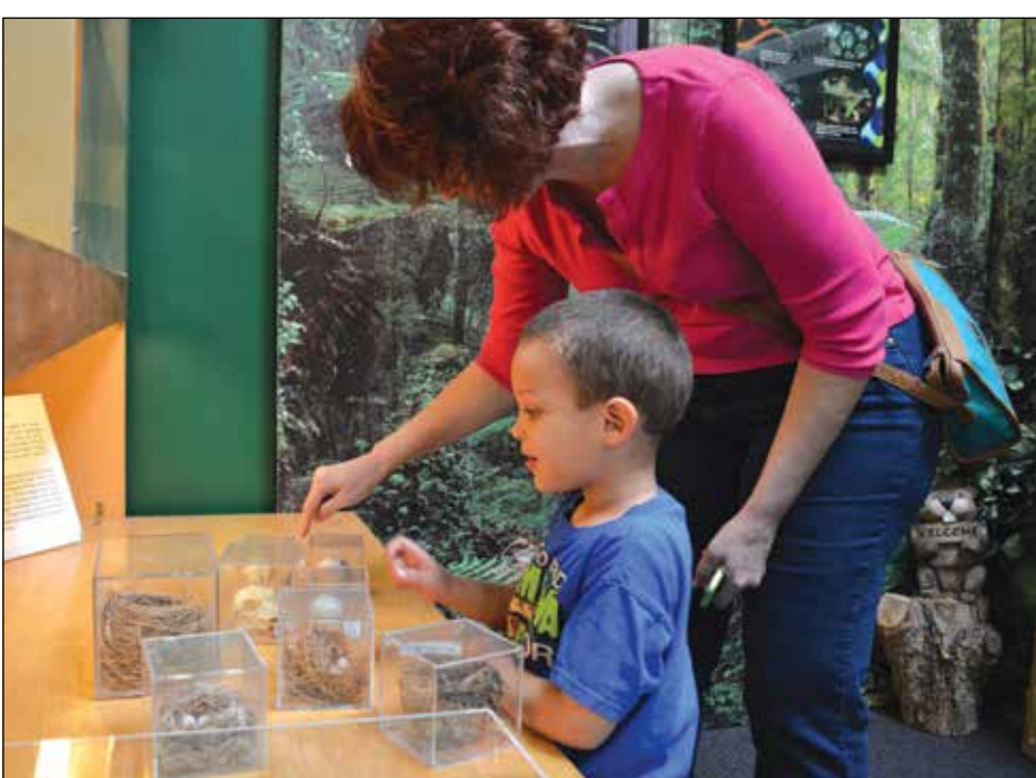
New This Year, Free Museum Day is Kick-Off to a Week Filled with Special Events, Activities & Activations Happening at Various Local Museums.

Museum Day is the kick-off to a week filled with special activities presented by various museums and popular destinations. While a comprehensive listing will be available on the website ( www.SacMuseums.org ), a sampling of the special activities follows: