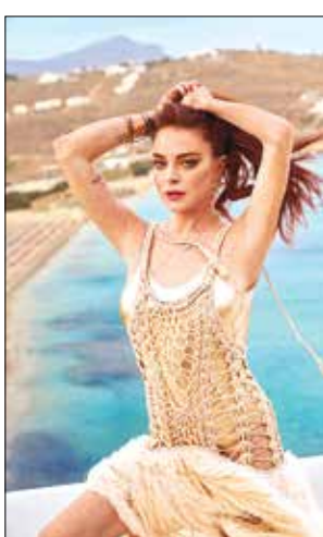
The ex-starlet seems intent on talking about herself and exploiting her dewy staff instead of running the Mykonos hot spot.

Jeers to Bandersnatch Trolls for choosing the wrong path. Slammed with piles of hate from anonymous dregs online, Will Poulter, who stars as the balcony-jumping programmer