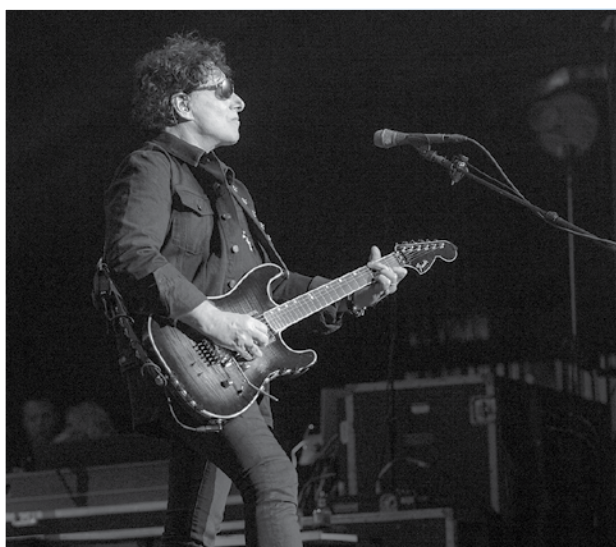
"Faithfully" returning to their roots, the band will showcase songs from the very beginning and pay tribute to your favorite classic hits.