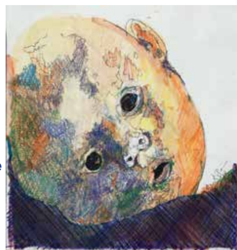
2018 Best of Show: "Bechola" by Michal Garcia

An art exhibit open to new artists of all ages who have never shown in a juried exhibition. Sponsored by Northern California Artists, Inc.