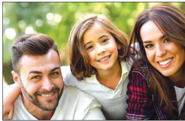
Counties throughout California are working to recruit loving families to care for foster children.

On December 11, the Sacramento County Board of Supervisors approved a nearly $500,000 increase of the Bridge Program contract funding to expand child care support services. The $1.3 million budget for Fiscal Year 2018-19 will be used to contract with Child Action, Inc., the local child care