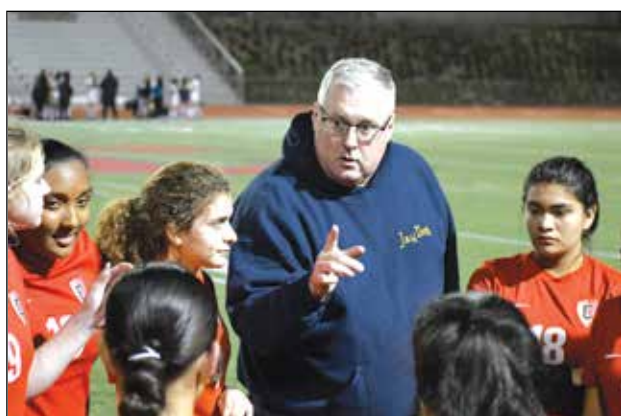
A gentle giant when he stands next to the girls on the soccer field.