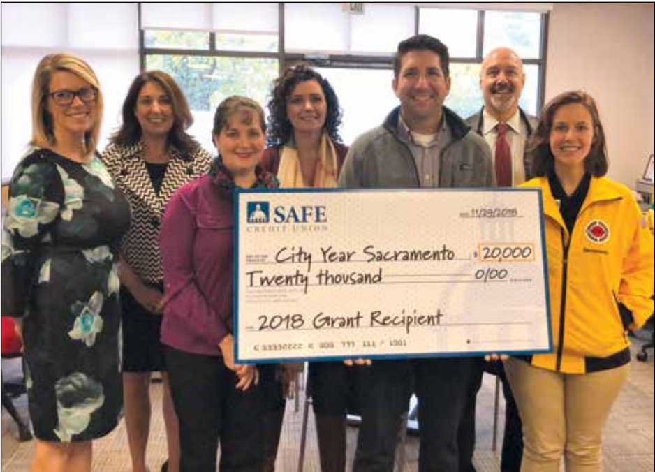
SAFE Credit Union employees making the donation to City Year.

City Year sends near-peer mentors to under-served schools in Sacramento to help students succeed. City Year representatives cheer students as they arrive to school each day to honor them for their hard work and to pump them up for the day. During class time, AmeriCorps members use positive coaching to help