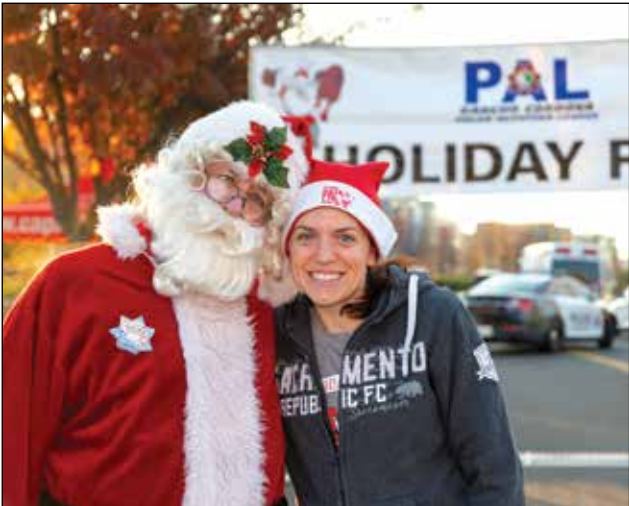
Over three hundred people braved the morning chill to lace up their running shoes, put on their Santa hats, and join in the 5th annual Rancho Cordova Police Activities League (PAL) Holiday Run.

Holiday Run Supports Rancho Cordova Youth