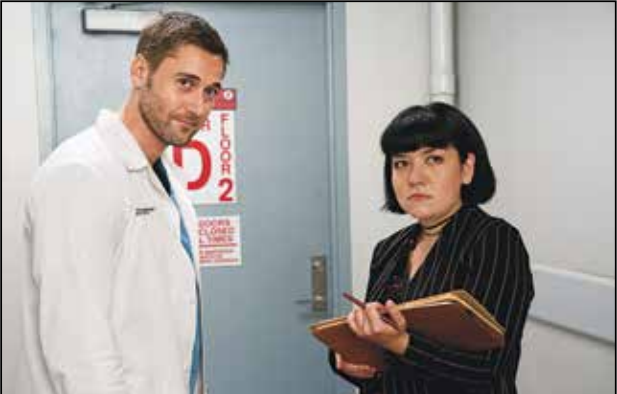
NBS's medical hit, New Amsterdam stars Ryan Eggold (left).

for bringing She-Ra back and making her better than ever in She-Ra and the Princesses of Power . In this update of the '80s icon, He-Man's twin sister is a smart, sassy and relevant warrior whose greatest strength now seems to be