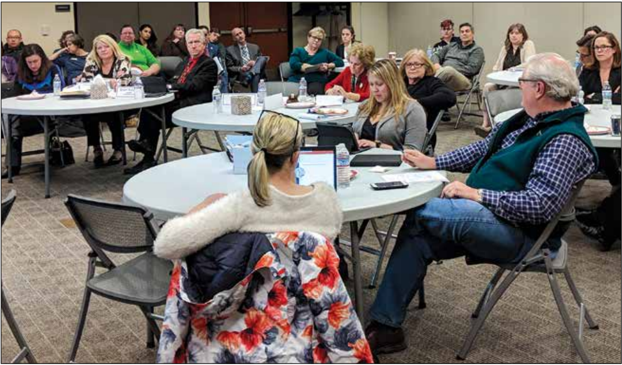
Local residents and members of the Rancho Cordova City Council discuss the potential Civic Center project and identify the uses most important to the community.

The Main Street concept would bookend the Civic Center with a theater on one end and a large multi-purpose gym on the other.