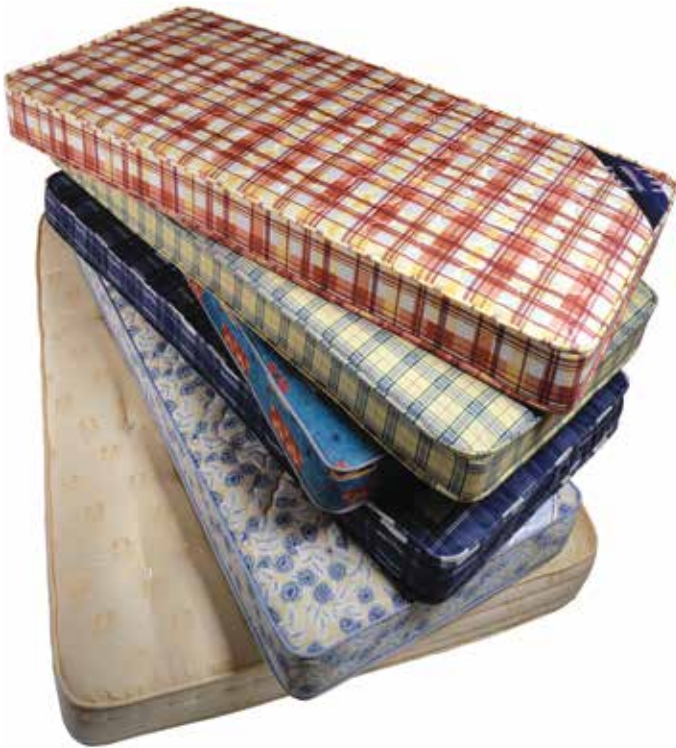
More than 80 percent of mattresses can be recycled and turned into new consumer and industrial products. For example, old mattress foam is recycled into carpet padding, mattress springs are sold as scrap steel, which is melted to make building materials and other steel products, and wood from box springs is chipped and used as landscape mulch.

"The MRC Program is one of the most effective Product Stewardship Programs Butte County is associated with," said Steve Rodowick, recycling coordinator with Butte County. "This program