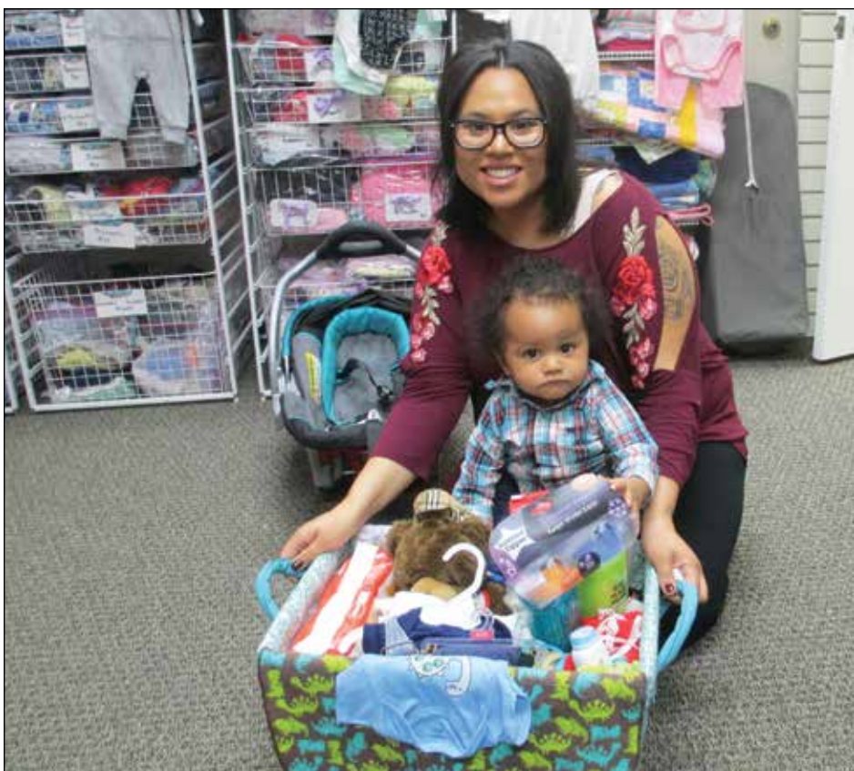
A Sacramento Life Center patient receives a baby basket in January. The center is running its annual Baby Basket Drive through December.