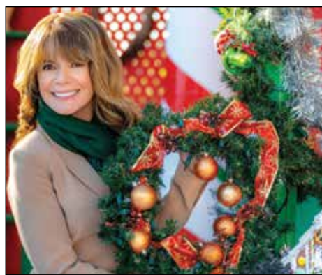
It's not that we don't love the sleigh full of seasonal flicks from the Hallmark Channel, Lifetime, Freeform and Netflix. It's just that there are so many now.

for losing its way. With the exit of Andrew Lincoln, AMC's once-killer zombie drama no longer has Rick Grimes's central drive to salvage humanity at the heart of the horror, leaving fans with too many