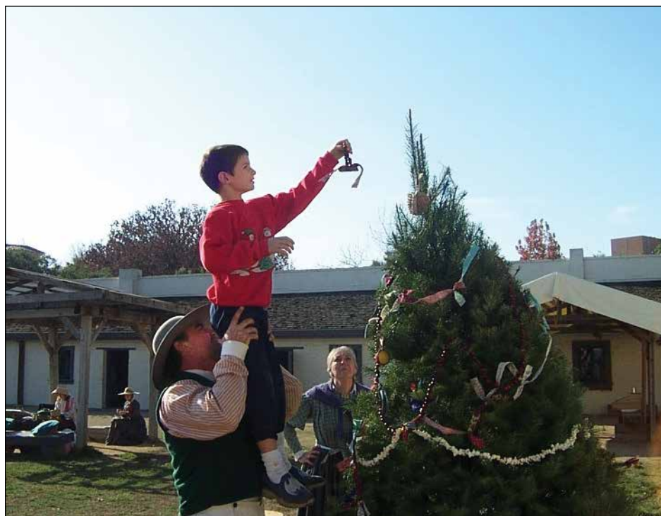
Hands on History: A Simple Emigrant Christmas" event at Sutter's Fort is scheduled for December 8.

SACRAMENTO, CA (MPG) - California State Parks, Sutter's Fort State Historic Park (SHP) and Friends of Sutter's Fort are proud to present an interactive, fun and festive "Hands on History: A Simple Emigrant Christmas" event on Saturday, December 8, 2018, from 10 a.m. to 5 p.m.