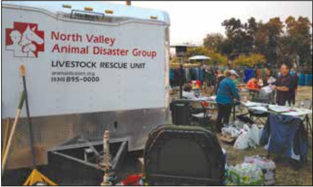
The NVADG crew at command central pictured working with Camp Fire survivors on the intake of their displaced and wounded animals.

Although there is no way to forecast how many more animals will arrive,