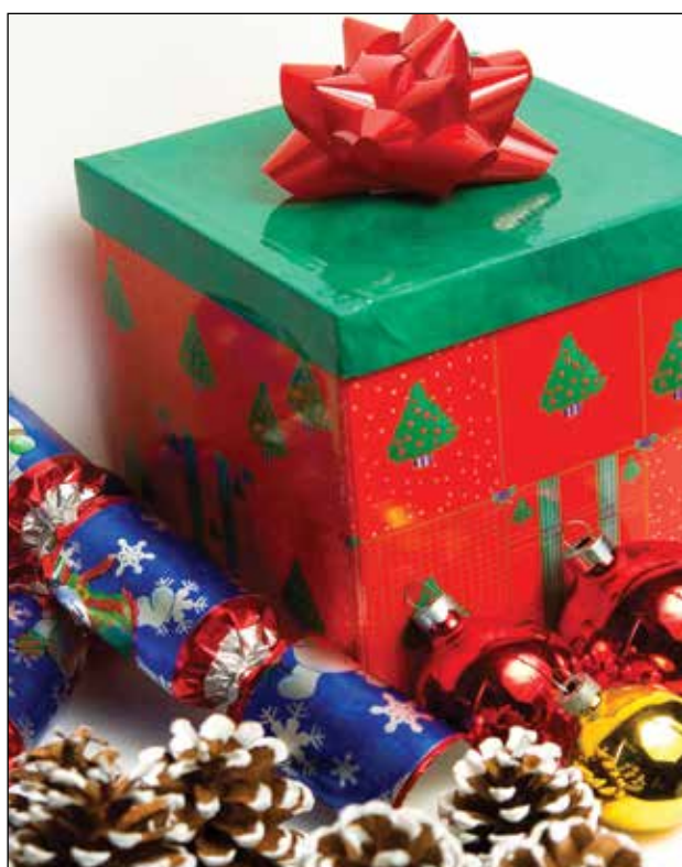
Local community partners and individuals from local businesses, County staff, government agencies, religious organizations, service groups, professional groups and families participate in this annual holiday gift-giving drive.

Consider participating in the Gifts From the Heart