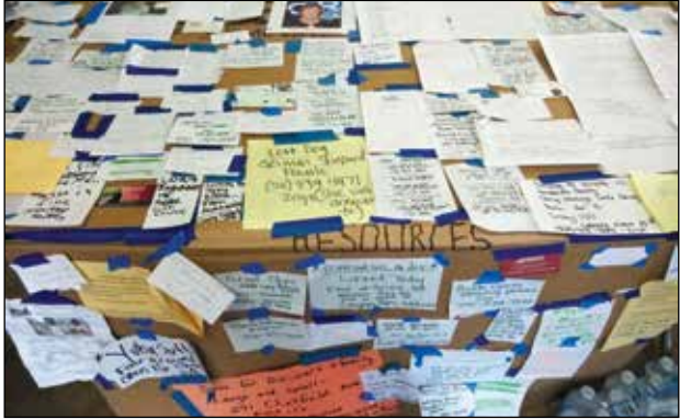
People used this resources desk to communicate what or who they had lost and were looking for, and any help they could offer to those in need.

the NVADG crew expects many more and will not turn away any animals in need of shelter and medical treatment. Volunteers and donations are welcome in the continued effort to help the wounded, weary, and strained animals from the Camp Fire and their equally exhausted owners. ★