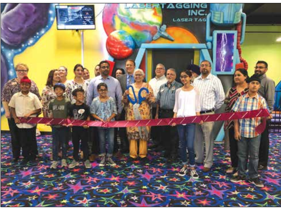
Friends, family and member of the Rancho Cordova Chamber of Commerce celebrate the recent opening.