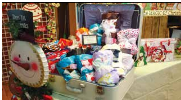
The fourth annual Holiday Craft Boutique will be held at Rancho Cordova City Hall 2729 Prospect Park Drive Thursday, November 15th.

Admission is FREE. For $5.00, receive a raffle ticket, a glass of wine, and a small plate of hors-d'oeuvres.