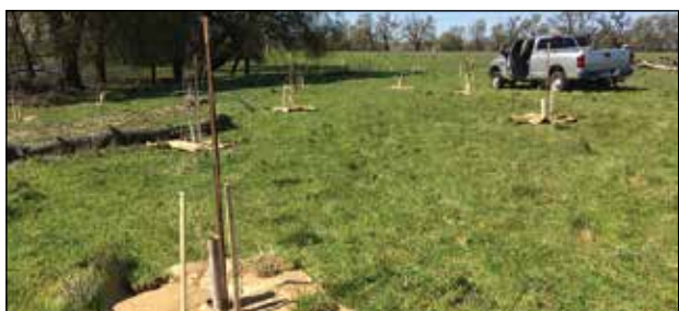
Construction on the Horseshoe Lake Enhancement Project project ended on Oct. 29 and seeding is underway.

SACRAMENTO COUNTY, CA (MPG) - Sacramento County Regional Parks is nearing completion on a restoration and enhancement project located at the Horseshoe Lake parcel at the Cosumnes River Preserve. This project was funded by two grants totaling more than $1,000,000.