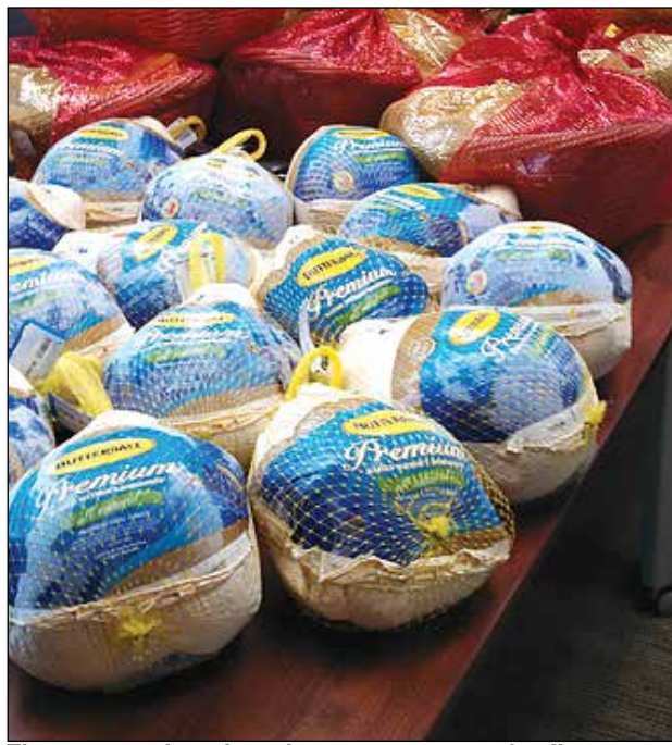
The person who raises the most money and collects most turkeys WINS!

The WINNER will be the KING or QUEEN TURKEY in the 2019 Rancho Cordova 4th of July Parade (banner and all), Signage at the Rancho Cordova Community Golf Classic, and Dinner for Two at Il Forno Classico! Of course, you will also