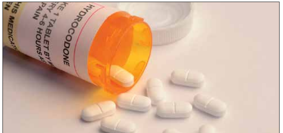
The Sacramento County Opioid Coalition website provides additional information including a list of current stakeholders, upcoming events and a calendar of the group's progress.

Continued from page 1 Opioid Coalition, we're bringing together local organizations and citizens committed to saving lives through collaboration and action. We're engaging the medical community, providing law enforcement with life-saving tools, promoting safe medication disposal, and working to raise awareness about opioids in our community."