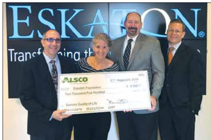
Eskaton management receives the donation from Alisco executives.