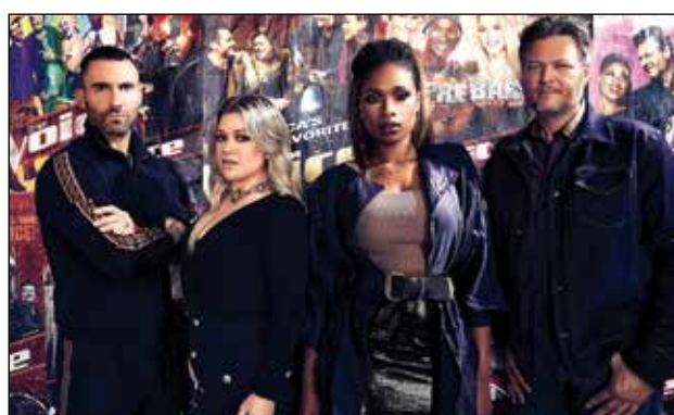
Adam Levine, Kelly Clarkson, Jennifer Hudson and Blake Shelton of The Voice .