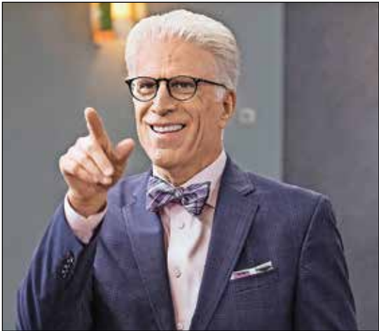
Ted Danson in The Good Place .

for sticking it to viewers who cut out early. If you changed the channel at the end of the harrowing limited-series finale, there's a good chance you too missed the surprise mid-credits scene that revealed who helped Amma (Eliza Scanlen, pictured) kill those Wind Gap girls. Not cool, HBO.