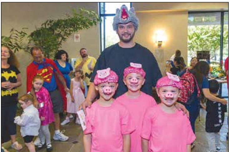
The third annual Leo's Amazing Race takes off on Sunday, September 30 at 2 p.m.