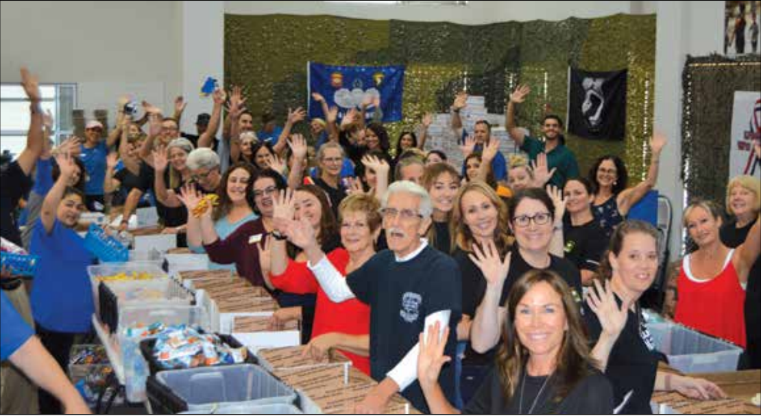
Volunteers assemble care packages for troops stationed overseas. Care packages distributed by Move America Forward include an assortment of food items such as coffee, jerky, granola bars, and a variety of candy and snacks.

Move America Forward Hosts Packathon to Assemble Care Packages