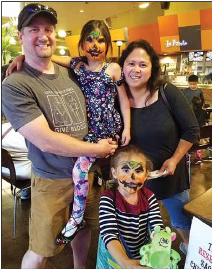
Since its debut in 2015 when heavy rain kept many people from participating, the race has grown and growth is expected to continue.