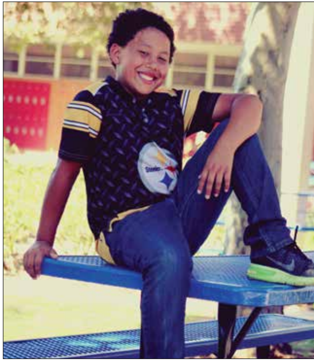
There are benefits of this program and there are drawbacks.