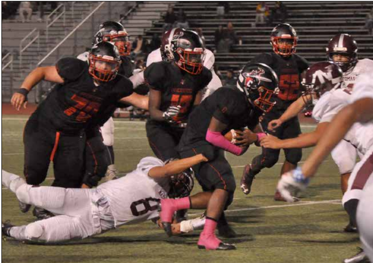
The team's longest drive, 93 yards in total, ran 15 offensive plays with Sanders to dominate the clock 41-20 lopsided win.