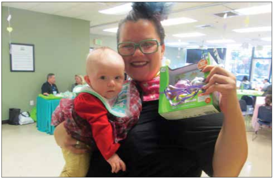
Workshops on parenting and special sessions for dads are also available.