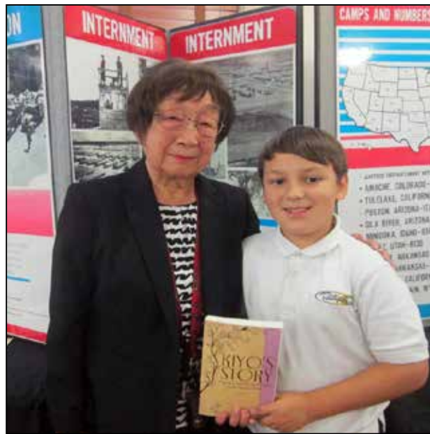
"We need to teach children to respect each other".

Sato's family was taken to Poston, Arizona where that bucket came in handy when the many sandstorms hit and to obtain potable water. Seeds were planted and somehow grew in temperatures that often topped 120 degrees. Poston was one of only ten