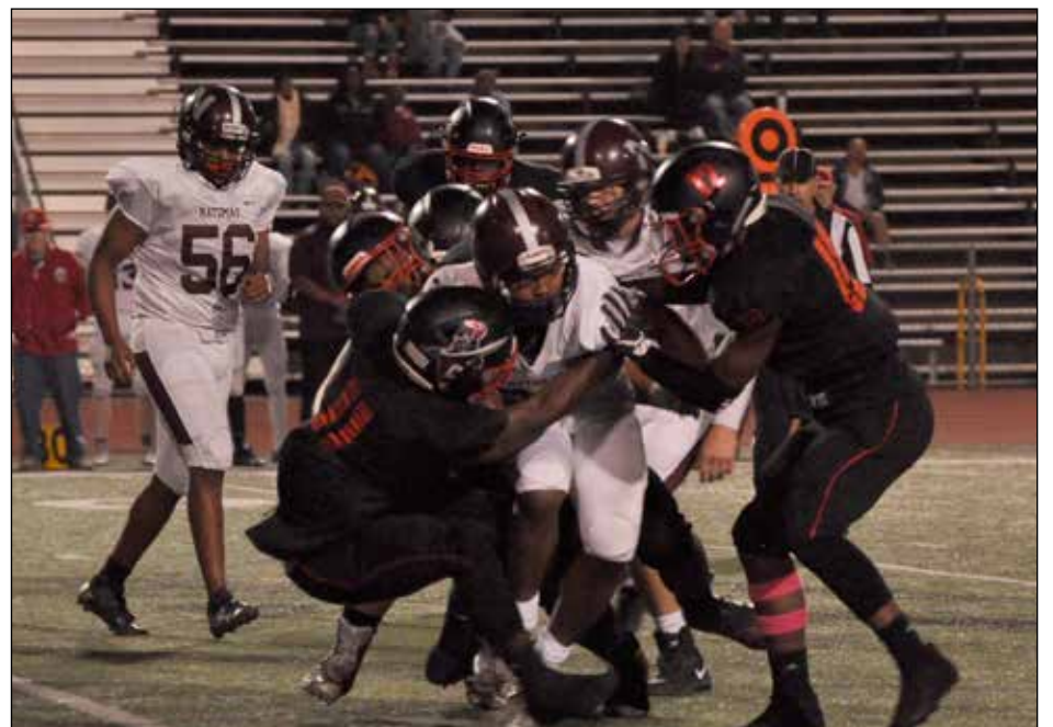
The defense comes up with another monster stop.