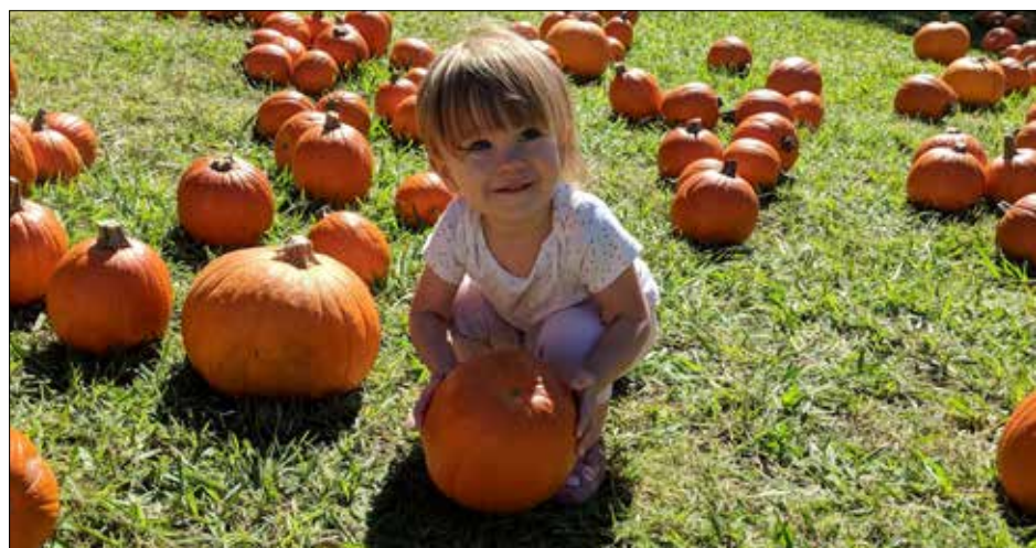
The Pumpkin Patch Express drops riders off at a pumpkin patch where they can choose their own pumpkin.