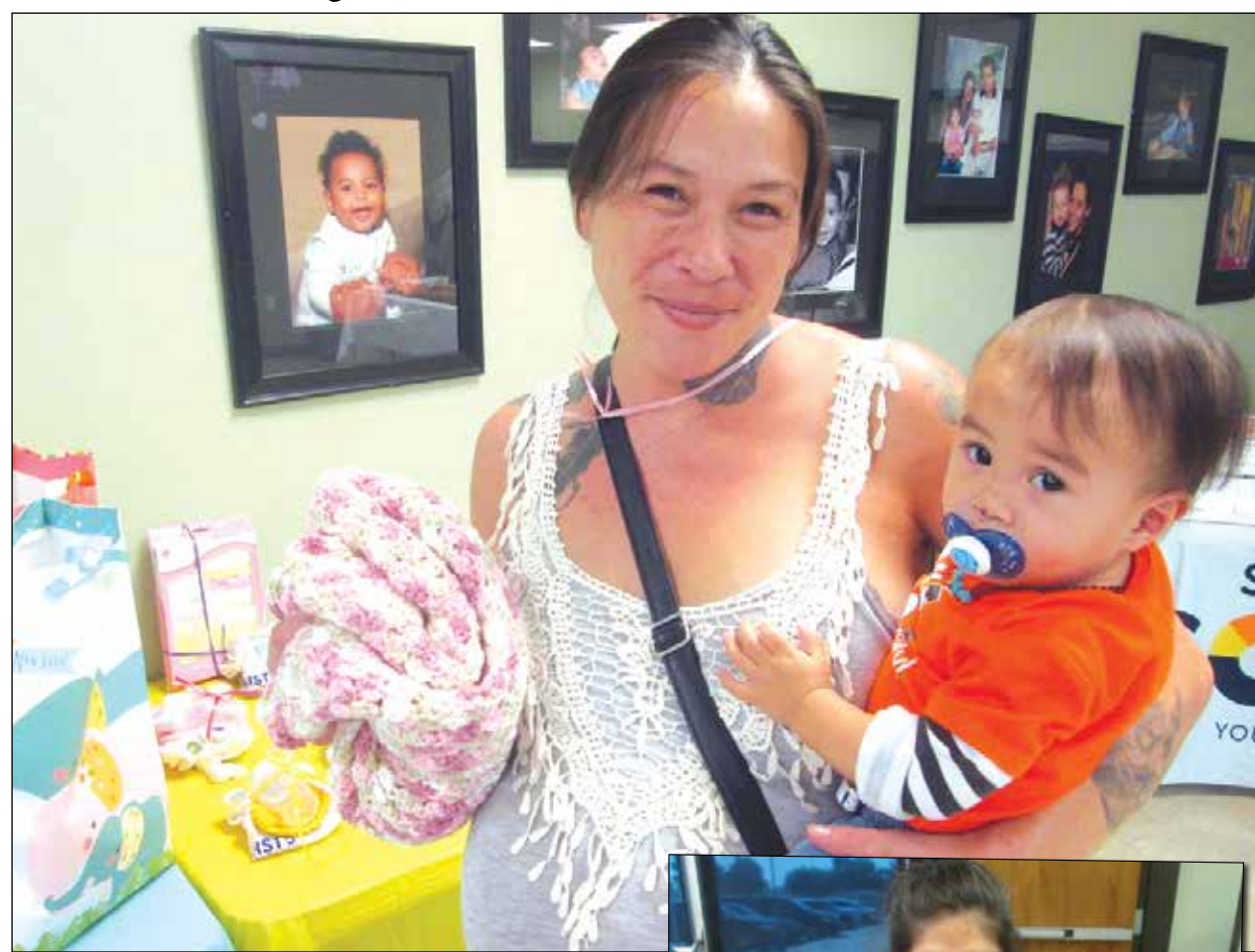
The shower also served to aid in creating a network between the moms and FCCP and visiting organizations