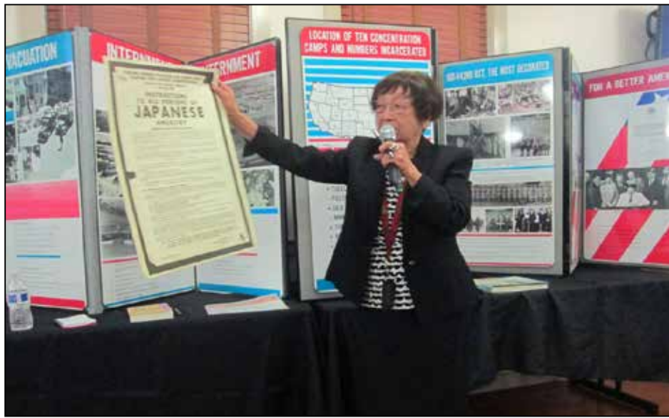
Her talk addressed the 4th Amendment when she recalled the day she came home from school to find three FBI agents in the house.