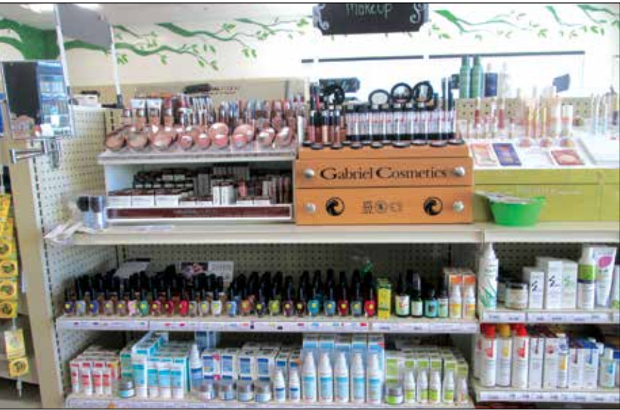
Sunshine Natural Foods has been in business since 1983.

For more information: visit www.evergreenfub.com or call 916-500-3334. If you go: EverGreen Fine Nutrition and Beauty, 4044 Sunrise Blvd., Suite 160, Rancho Cordova or Sunshine Natural Foods, 8121 Madison Avenue, Suite F2, Fair Oaks. ★