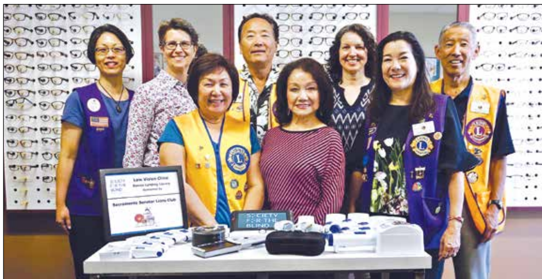
Society for the Blind staff members show Sacramento Senator Lions Club representatives the device lending library that the club helped to fund with a recent grant.

Sacramento Senator Lions Club Gifts $10,000