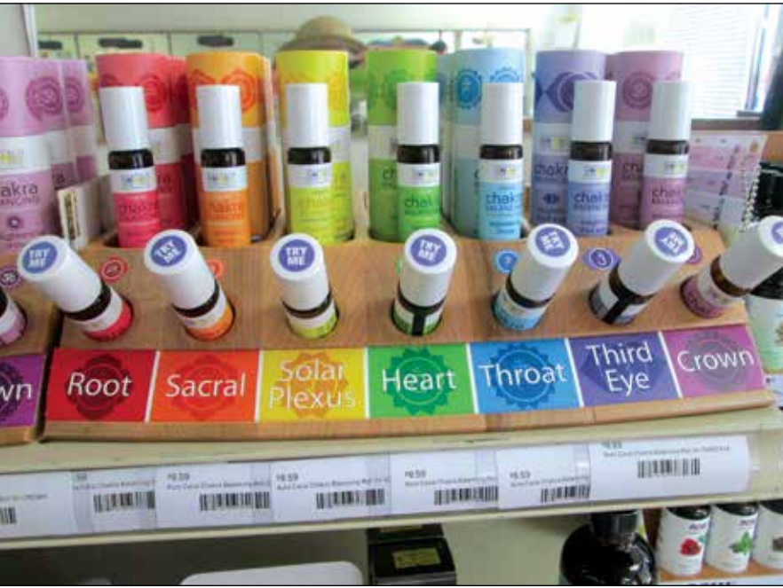
Sunshine comes with a solid customer base, some who have been shopping there for 15 years or more.