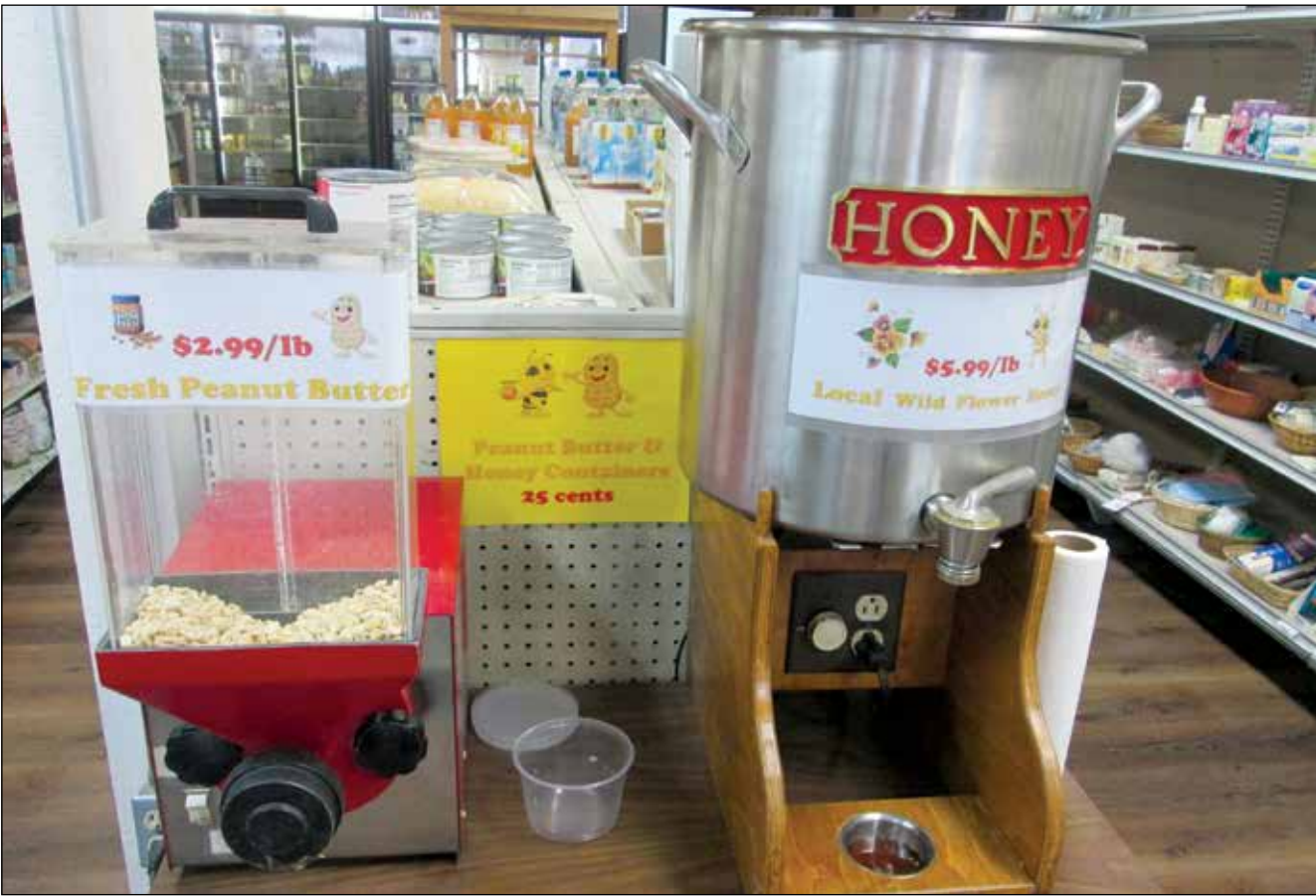
Sunshine’s customers can dispense their own local wildflower honey.

Badal explained that stock is “based on customer demand,” meaning that the