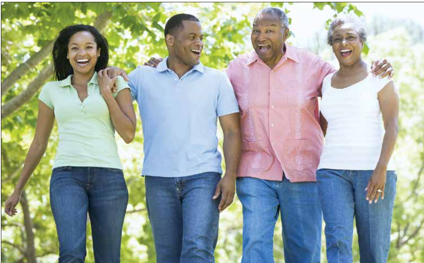
The American Heart Association asks Sacramento to Take a Walk. Get out and spend some quality time with your friends.

RANCHO CORDOVA, CA (MPG) - Wednesday, April 1st is National Walking Day and the American Heart Association is encouraging Americans and Sacramento residents to lace up for their heart and get moving.