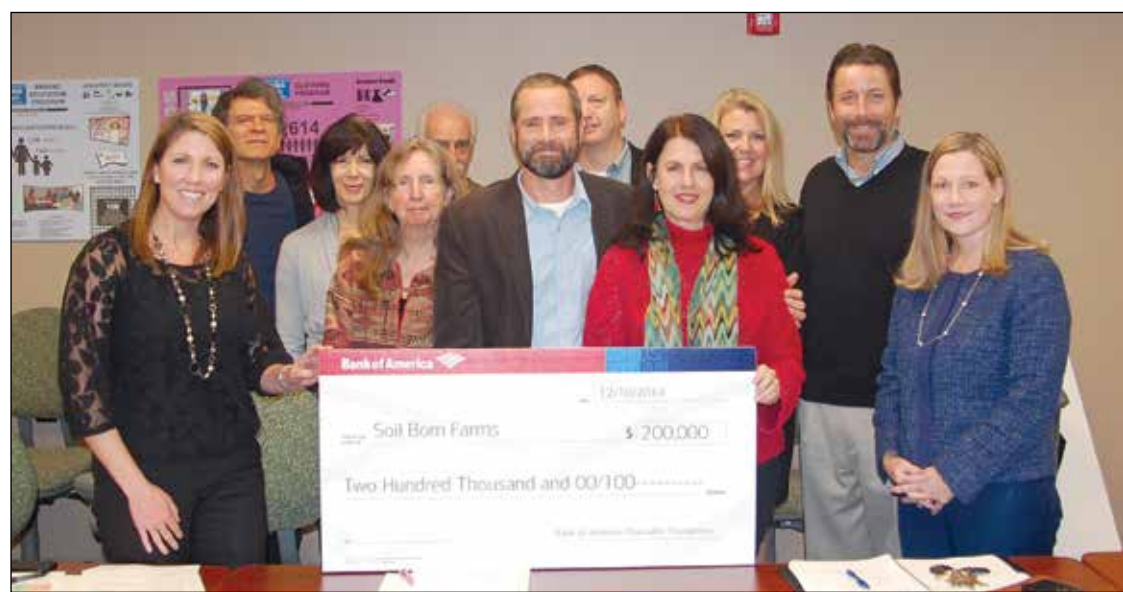
Bank of America announces Soil Born Farms as Sacramento's Neighborhood Builder Award recipient. Soil Born Farms is a nonprofit being recognized for its work in addressing hunger, healthy living, and sustainability in the Sacramento community through urban farming.

Recognized for Addressing Hunger and Sustainability Through Urban Farming