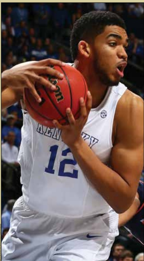
KARL-ANTHONY TOWNS, KENTUCKY