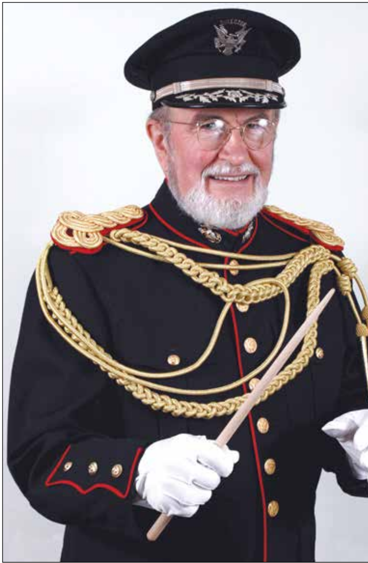
"Oh Mr. Sousa!" is a delightful musical biography and exhilarating, toe-tapping, bring-you-to-your-feet performance about the life, times, and music of John Philip Sousa, "The March King."