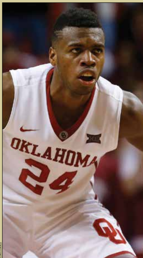
BUDDY HIELD, OKLAHOMA