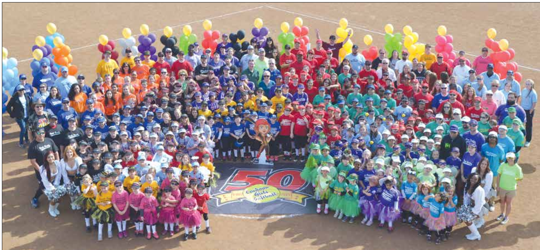
Cordova Girls Fastpitch Softball was founded in 1965 as the first girls sport league in Rancho Cordova. Hundreds of girls and their parents celebrated the 50th anniversary on Saturday, March 21st. Each year, as many as 300 girls in Rancho Cordova pick up a bat and a glove and take the opportunity to grow into self-confident women. In the last 50 years, approximately 10,000 families have shared the experience.