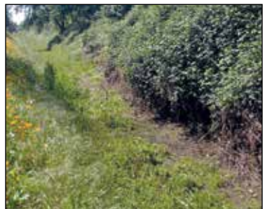
The after photo from the creek near Horn Road in Rancho Cordova during the 2014 Creek Week Clean-Up.

Rancho Cordova's clean-up event is part of Creek Week, an annual event that is organized by the Sacramento Area Creeks Council. The clean-up on April 18th will be followed by a free lunch, entertainment, and fun activities from noon to 2 p.m. at Carmichael Park, 5750 Grant Avenue.