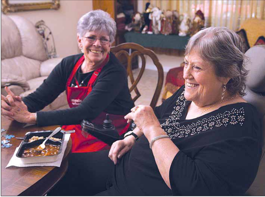
Along with each meal, volunteers provide a special touch of friendship and a daily safety check enabling seniors to be independent in their own homes.