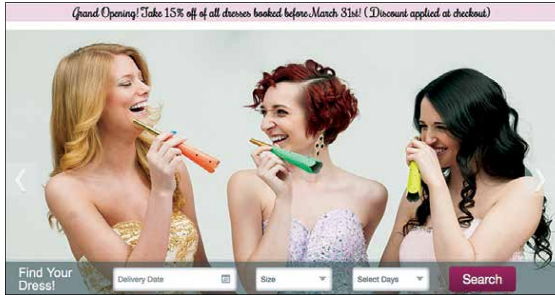
To see the available dresses or to learn more about Princess Prom Rentals, please visit www.princesspromrentals.com or www.facebook.com/princesspromrentals .