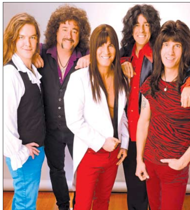
Whether it's classic Fourth of July marches or the unforgettable hits of Journey (Journey Unauthorized shown above), there's something for everyone at the Rancho Cordova Fourth of July Celebration.