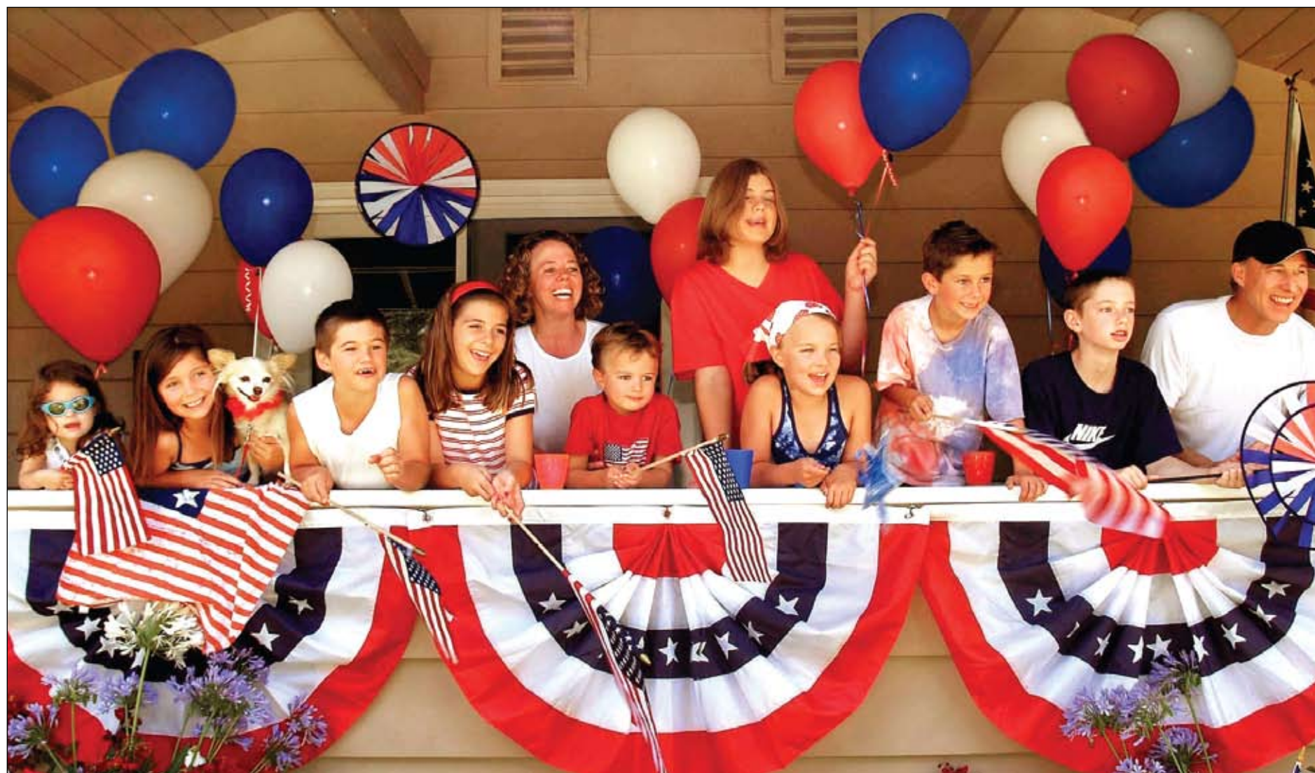
A family of patriots watches a Fourth of July parade.

With that, there was a lull in the conversation that left everyone uneasy. Some took advantage of the awkward interval to check their emails on their iPhones or make small talk. And as the talk died down, the grandfather unexpectedly spoke up.