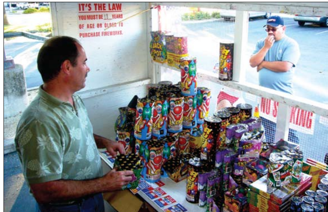
Firework stands run by non-profit groups will be open for business starting June 28 throughout Sacramento County and much of Placer County.

For stand locations and additional product information, visit the retailers' websites: TNT, www.tntfireworks.com ; and Phantom, www.fireworks.com .