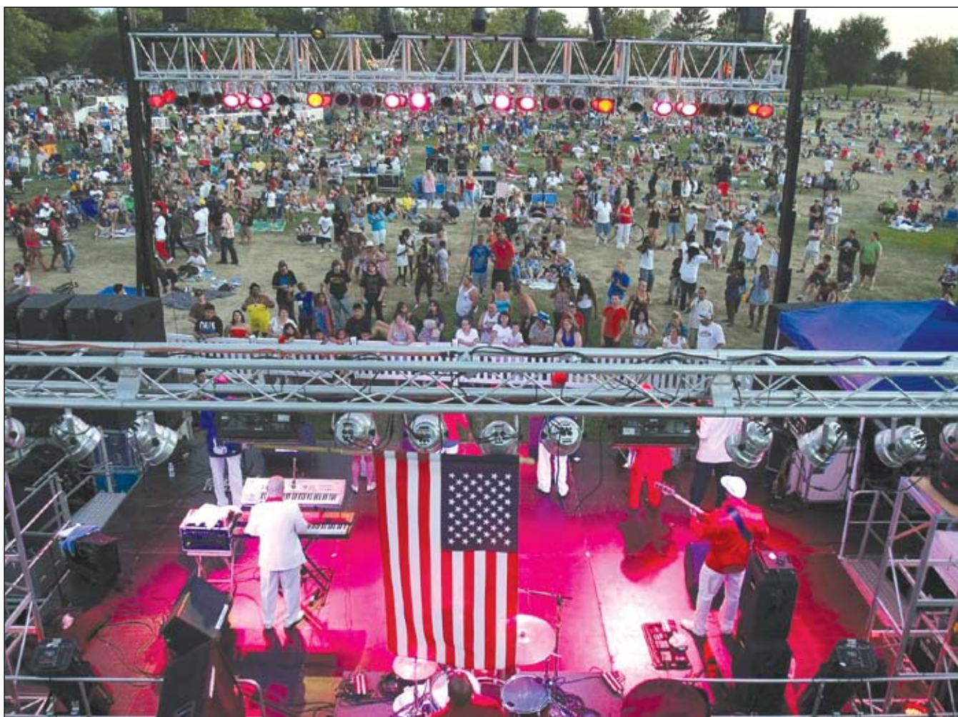
At 8:15 p.m. everybody heads into the outdoor Main Stage concert venue for music under the stars from Journey Unauthorized, a tribute band that is the next best thing to the real thing! Be sure to bring a blanket or lawn chairs and be ready when the band rolls the crowd into the concert-ending fireworks mini show—an eye-popping treat for the senses to get you warmed up for the Fourth of July.

Next, cool off from the parade at nearby Hagan Park where the festival goes into overdrive following the parade. It's a remarkable day of carnival rides, concerts, beer gardens,