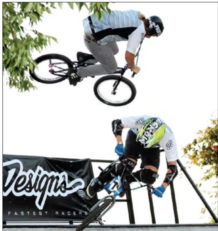
The BMX Freestyle shows are sponsored by California American Water, Rancho Cordova Elks Lodge, with bike helmets from the Sierra Sacramento Valley Medical Society Alliance.

RANCHO CORDOVA, CA (MPG) - It's a non-stop thrill when the BMX Freestyle Team steer their bikes up, up and away on the quarter pipe during a stunning performance that will leave you scratching your head and asking ... "How do they do that?"