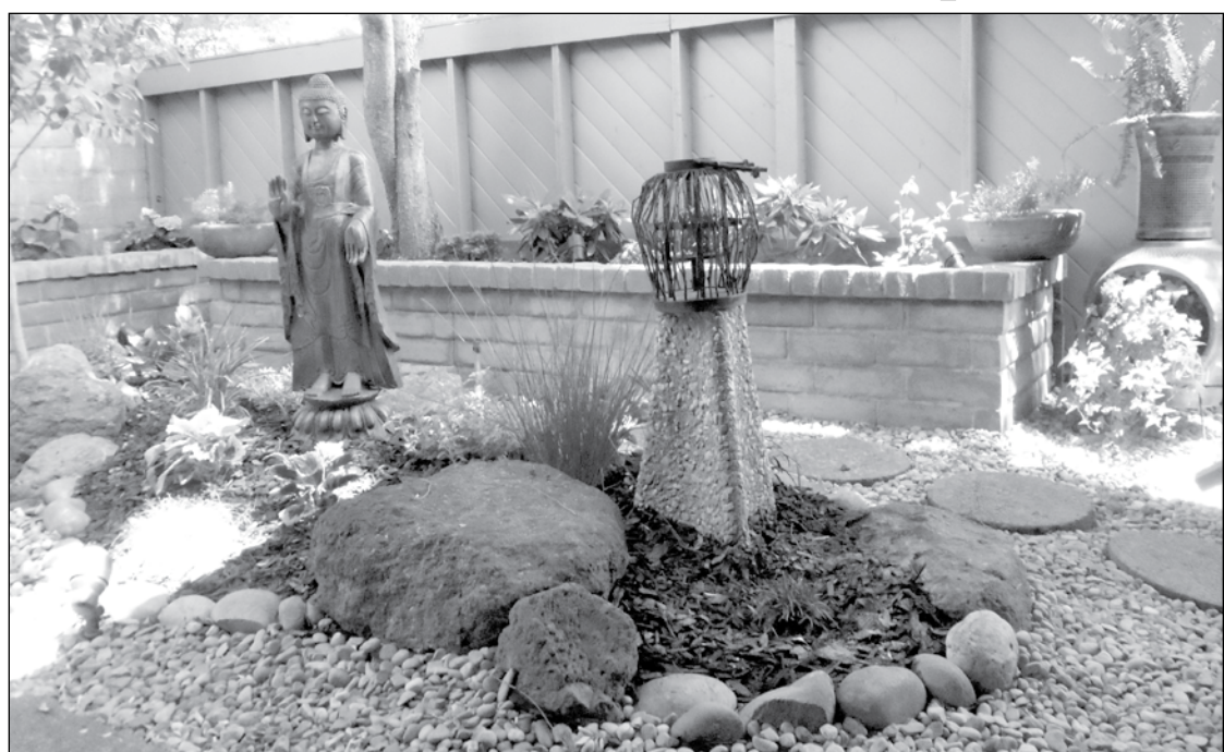
Living in a patio home in a Gold River Village is convenient and practical in many ways; however, creating a lovely themed garden in such a small area is a challenge.