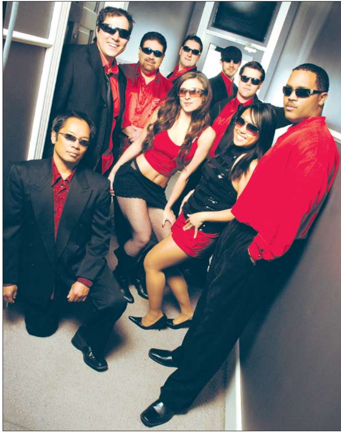
Watch the fireworks light up the sky and Night Fever (shown above) sends the 30th Annual Rancho Cordova Fourth of July into the record books.