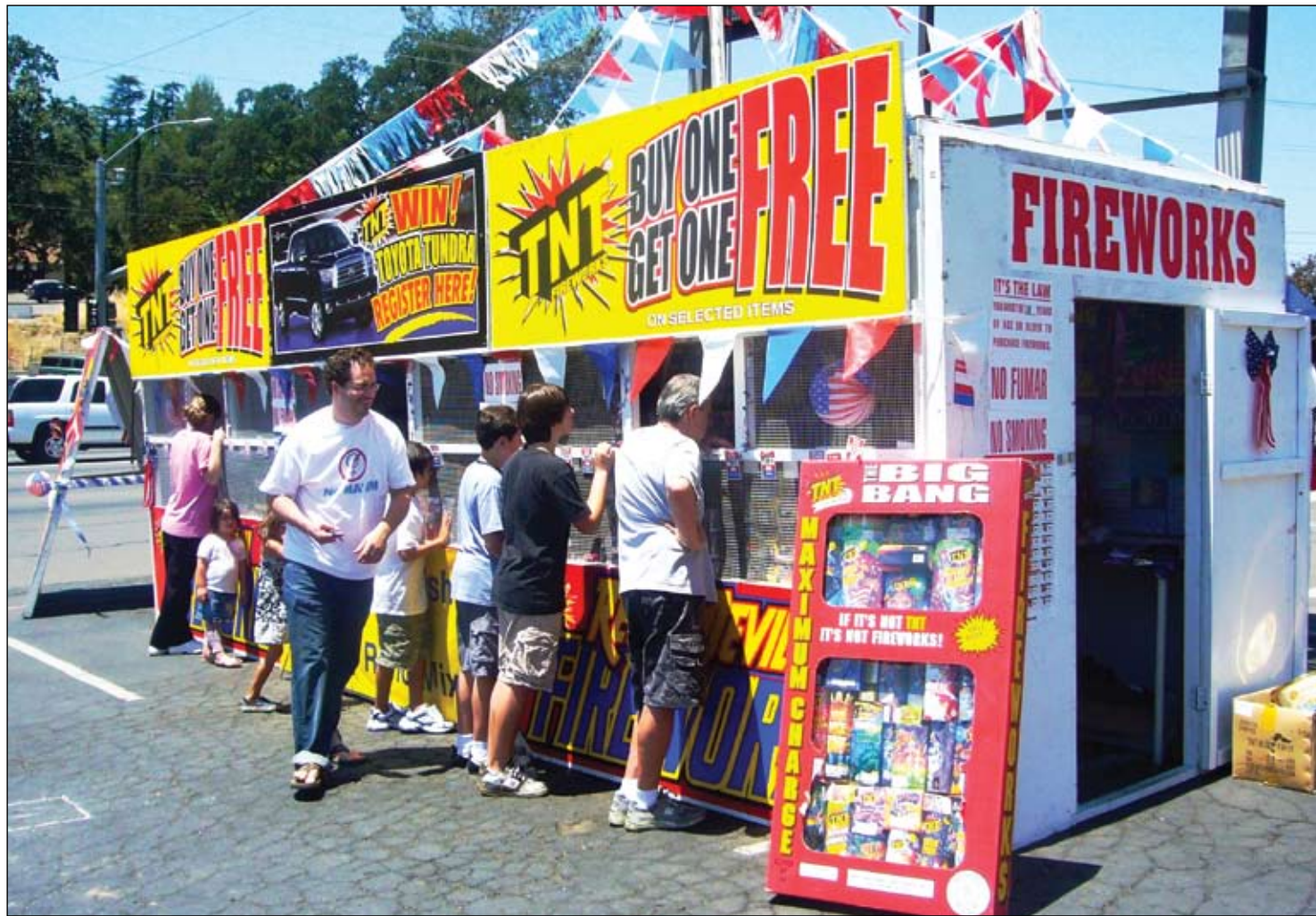
State-approved fireworks in all shapes, sizes and price points are a big fund-raiser for area non-profits from June 28 through the Fourth of July.

Don't be a Statistic this Fourth of July! Here are some safety tips: • Observe local laws. • Always store fireworks in a cool, dry place. • Always read and follow directions on each firework. • Use only state-approved "safe and sane" fireworks. • Only use fireworks outdoors, away from homes, dry grass or trees. • Have a responsible adult present. • Have a hose ready. • Light at a safe distance. • Never attempt to re-light or fix a "dud." • Never carry fireworks in your pocket. • Never point or throw fireworks at another person. • Soak used fireworks overnight before disposing.