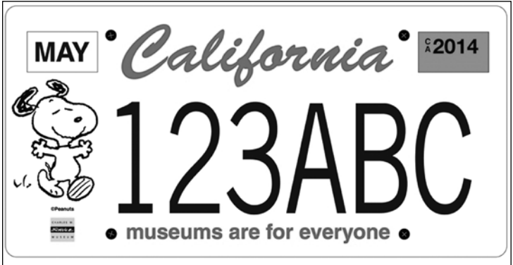
Many California museums got creative with their social media posts, snapping photographs of the Snoopy license plate with artifacts from their collection, in exhibitions, or proudly held by museum fans or volunteers.

The Department of Motor Vehicles (DMV) will begin issuing the Snoopy license plates upon receipt of 7,500 paid applications. Sequential plates are