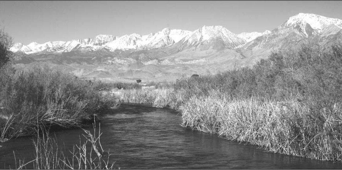
Journeying south through the majestic mountain vistas along Highway 395, you also escape the boring flat landscapes and awful traffic of other freeway routes. And there are few places in America that can compare to the clear starry night skies of the Eastern Sierra.