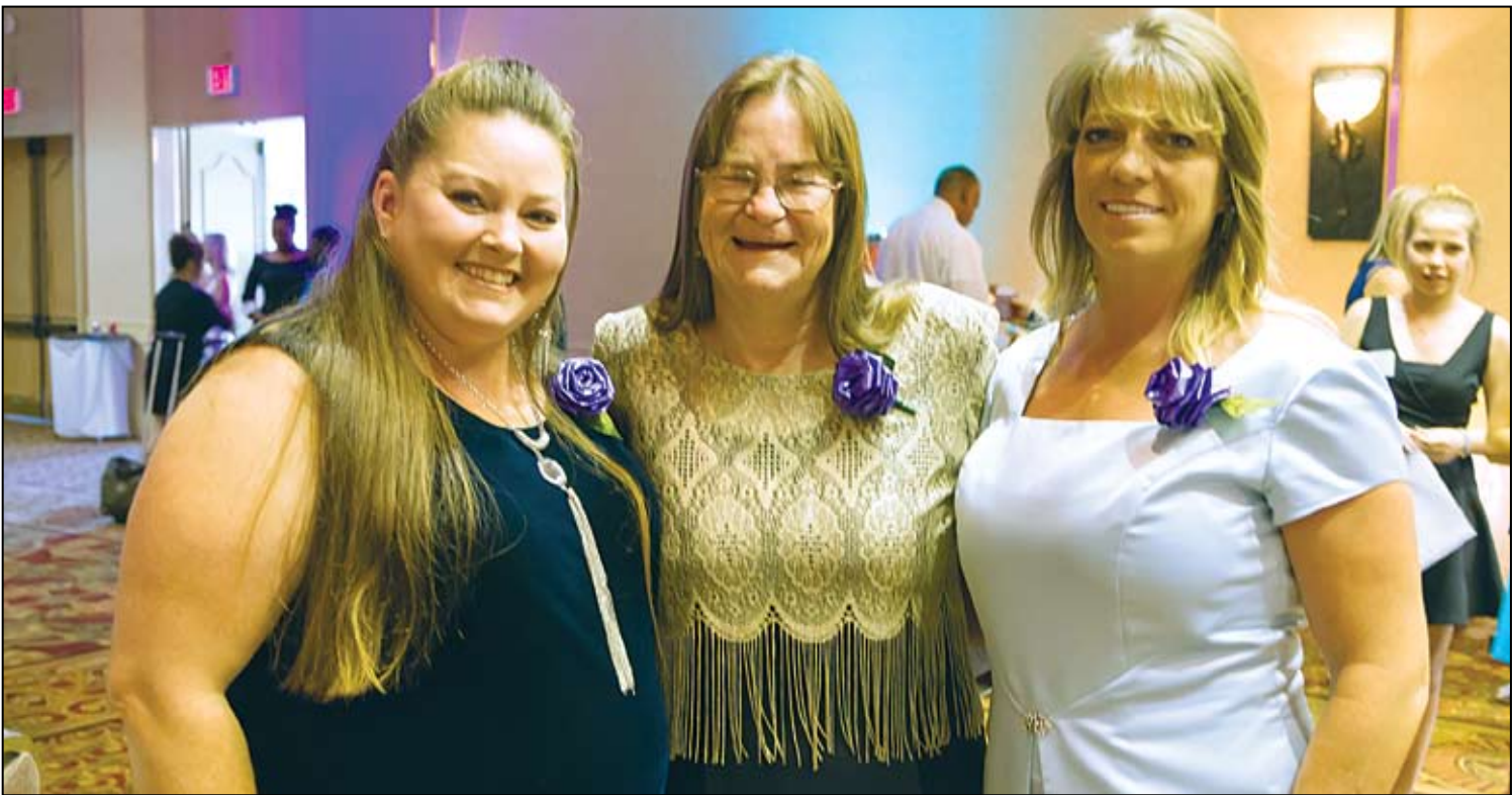
Graduates of Women’s Empowerment’s job-readiness program for homeless women celebrate at the organization’s annual Celebration of Independence Gala.