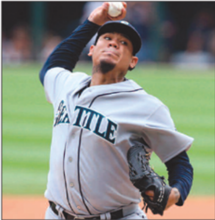
Seattle's Felix Hernandez (left) and Andrew McCutchen of the Pirates were first-half award winners and likely will be holding the hardware in November as well.