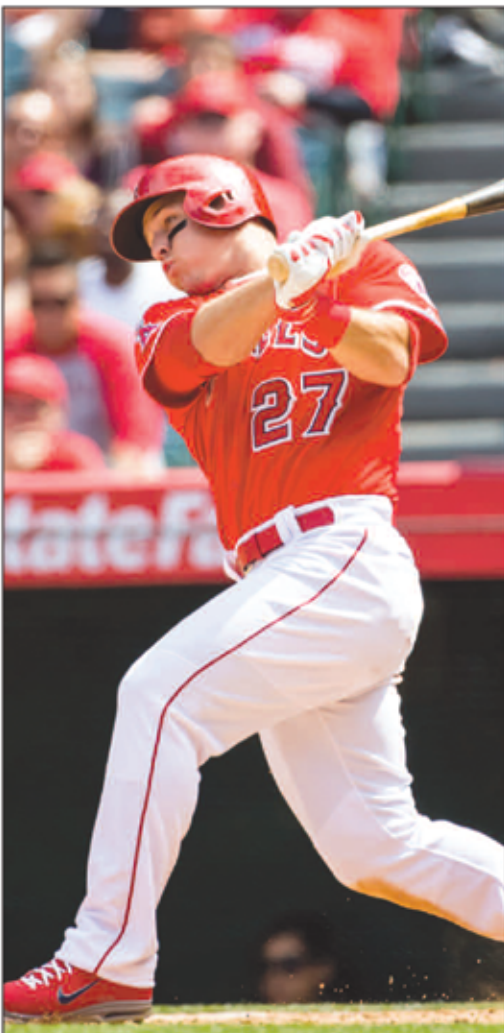
Mike Trout

July 23, 1974 Steve Garvey of the Los Angeles Dodgers, whose name is not listed on the All-Star ballot, is voted a starter for the National League in the All-Star Game by write-in votes. With two hits in four at-bats, Garvey earns the game's MVP honor in the NL's 7-2 win at Three Rivers Stadium in Pittsburgh. July 16, 2006 Chipper Jones of the Atlanta Braves takes Jake Peavy of the Padres deep in the fourth inning at San Diego. The hit ties a 79-year-old record held by Paul Waner for 14 consecutive games with an extra-base hit. Jones bats .544 with a 1.088 Slugging percentage during the streak that includes eight doubles, a triple and seven home runs.