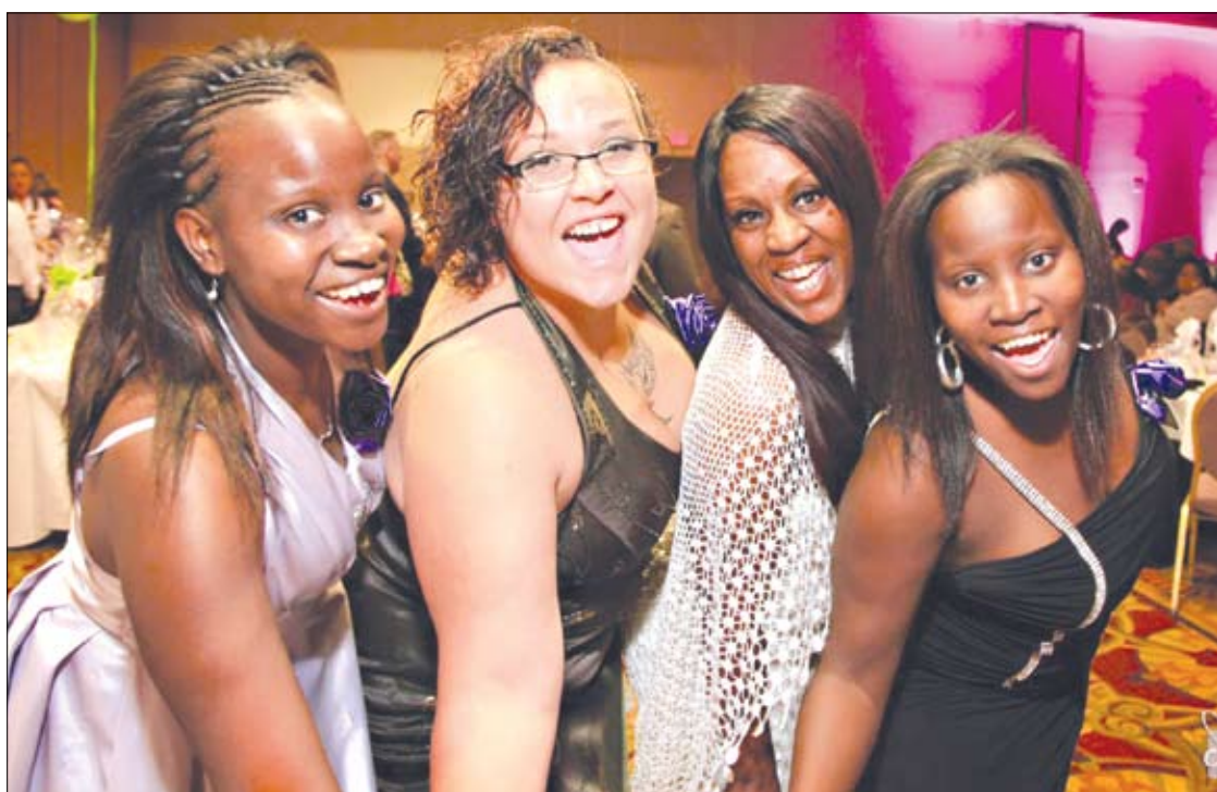
The program combines self-esteem courses, job training, health classes and support services to help homeless women across diverse ages, races and cultures.

SACRAMENTO, CA (MPG) - Community members are invited to the 13th Annual Celebration of Independence Gala that benefits Women's Empowerment, a local nonprofit helping women who are homeless find homes and jobs so they can support their families. Residents also can sponsor a graduate of the program to attend the event.