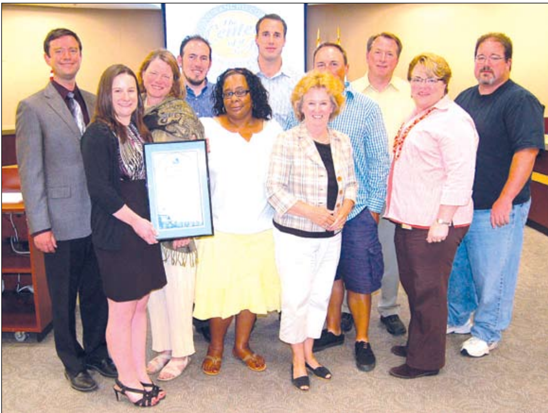
The program combines self-esteem courses, job training, health classes and support services to help homeless women across diverse ages, races and cultures.