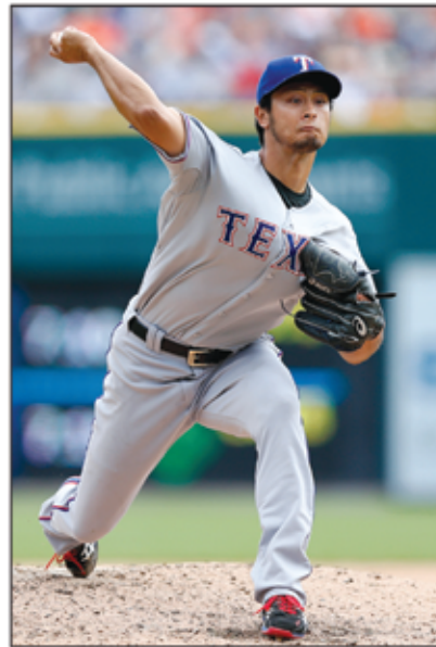
Yu Darvish (left), ace of the Texas Rangers, and Manny Machado, a rising star for the Baltimore Orioles, are destined to be American League All-Stars in 2017, and perhaps beyond.

Baltimore fans can't wait to see him in the rotation full-time.