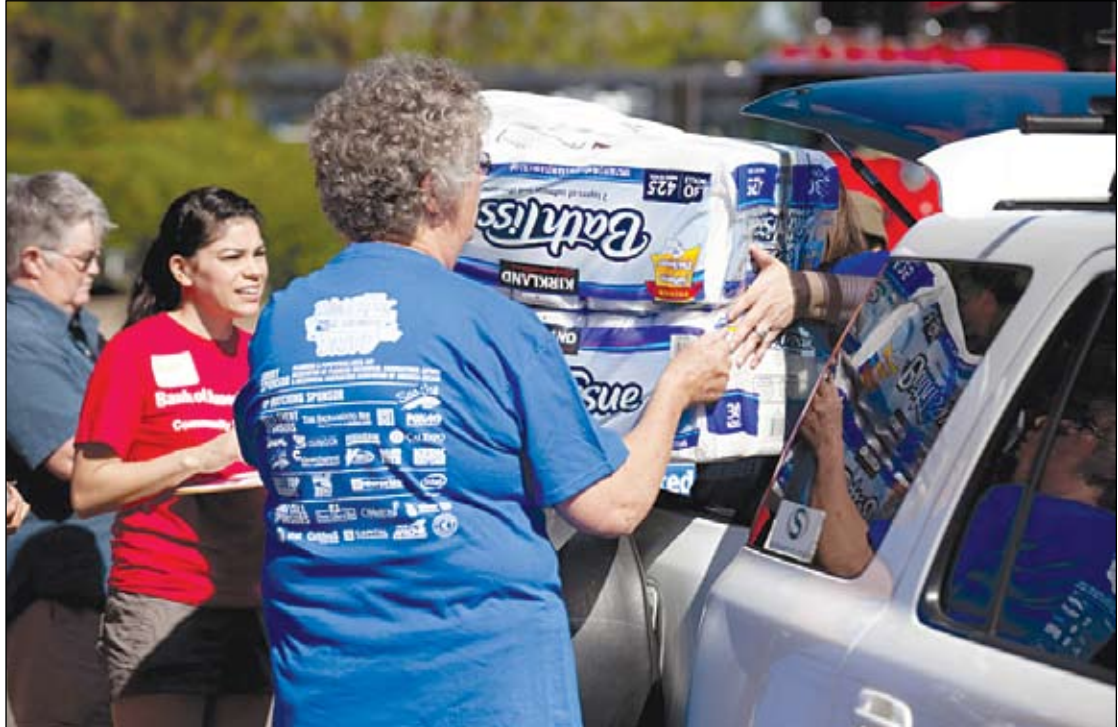
The Toilet paper drive will take place 7 a.m.-7 p.m. on June 12th at the Cal Expo main entrance, 1600 Exposition Boulevard in Sacramento. Residents also can donate toilet paper online at www.yourlocalunitedway.org/tp-drive .

challenging each other and creating contests. Employees are already getting excited and bringing in toilet paper. Each year, Bank of America also has provided 15 volunteers and will do so again this year. Volunteers spread the word throughout the office, load toilet paper into vehicles and deliver it to Cal Expo, and lend support the day of the drive out at Cal Expo. United Way's Toilet Paper Drive will take place 7 a.m.-7 p.m. on June 12 at the Cal Expo main entrance, 1600 Exposition Boulevard in Sacramento. Residents also can purchase toilet paper online through Sac-Val Janitorial Supply at www.yourlocalunitedway.org/tp-drive , which will be donated to the drive. For updates, visit facebook.com/uwccr or follow @unitedwayccr Continued on Page 12