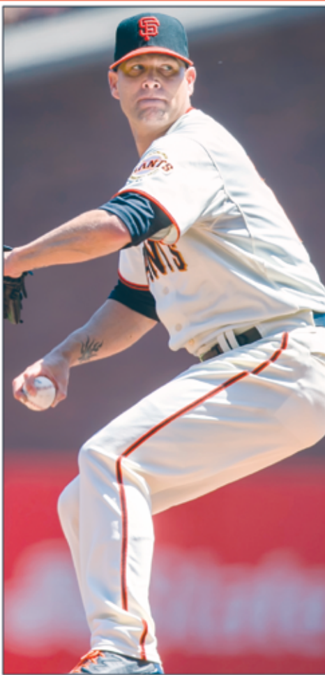
Tim Hudson

With the recent trade of catcher Nick Hundley, the Padres may already be looking to the future with this elite defensive backstop.