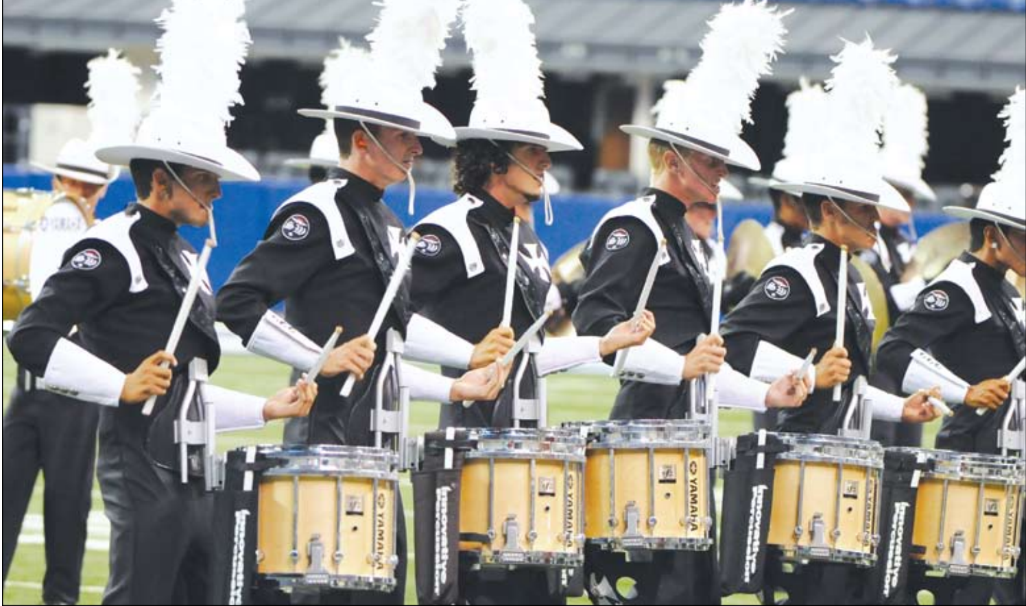
This event, the longest running of its kind in the Western United States, is a visual extravaganza of sight and sound. It's often described as "marching bands on steroids."

SACRAMENTO REGION, CA (MPG) - On June 22, 2014, at 6:00 p.m., Drum and Bugle Corps from around the country will gather at Hughes Stadium (at Sacramento City College) to compete in the 35th Annual Moonlight Classic, presented by Sponsors of Musical Enrichment (S.O.M.E.). The audience is expected to number in the thousands. For the uninitiated, this event, the longest running of its kind in the Western United States, is a visual extravaganza of sight and sound. It's often described as "marching