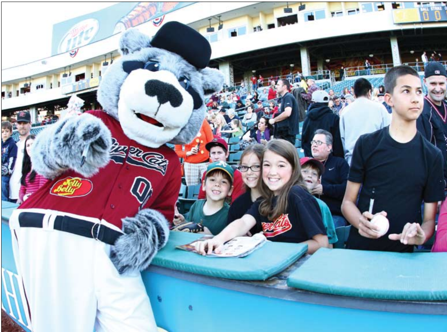
As part of the Oakland Athletics farm system, the River Cats will continue to develop "home grown" talent that contributes to future success at the big league level. Last season, a total of 26 River Cats were called up by the A's to contribute at the Major League level. Many of these players had a significant role in the Athletics winning the 2013 American League West Division title.

SACRAMENTO REGION, CA (MPG) - It's time to catch the feeling! The 2014 baseball season is underway and your home grown Sacramento River Cats are primed to make a run at their 12th division championship in