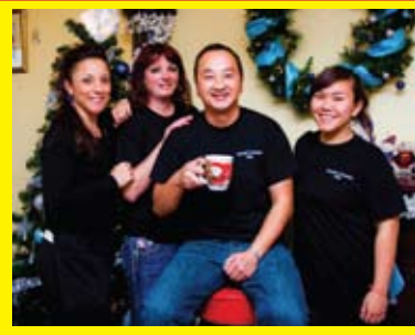
Sunrise 2 Sunset Staff

Beer and Wine Available Open Daily 7:00 am to 8:00 pm Free Wi-Fi Banquet Facilities Available Call for Reservations