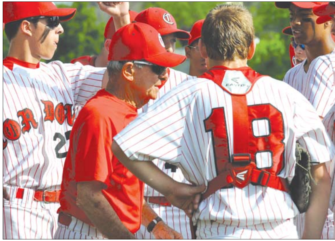
the Lancers will take a break from league play to host their annual Cordova Easter Tournament that starts Monday. Cordova will play two games on the first day; against Golden Sierra at noon and Redwood Christian of San Lorenzo at 3:30 p.m.

Then on Tuesday, Cordova will play Mesa Verde at 3:30 p.m. The tournament will conclude Wednesday.