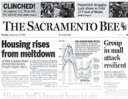
History buff's bequest boon to city

The Sacramento Bee provides regional and national news on Sunday