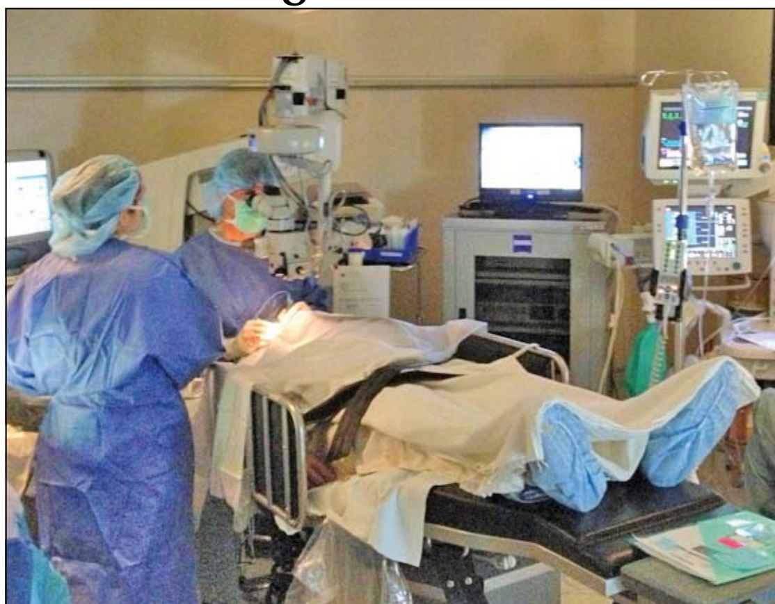
A Kaiser Permanente ophthalmologist performs cataract surgery during Mission Cataract 2013 on a patient who regained her eyesight following the operation.

SACRAMENTO, CA (MPG) - Kaiser Permanente physicians and staff in Sacramento will offer screenings for area residents who may be eligible for free cataract surgeries that will be performed this spring.