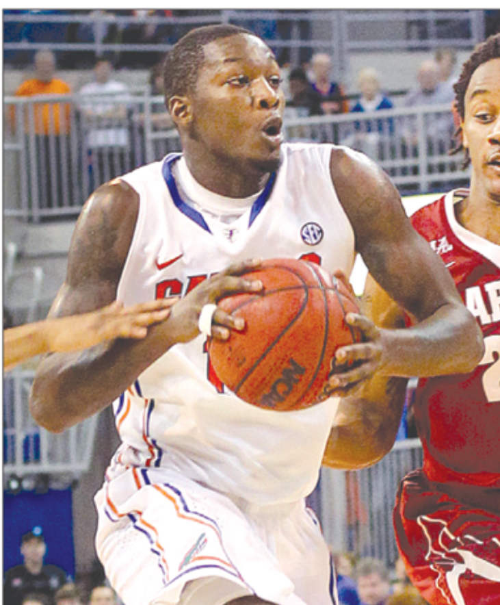
Florida forward Dorian Finney-Smith, who began his career at Virginia Tech, could play a key role for Florida in the NCAA Tournament.

Light: Billy Donovan is my choice. He has done a tremendous job with a team that isn't loaded with