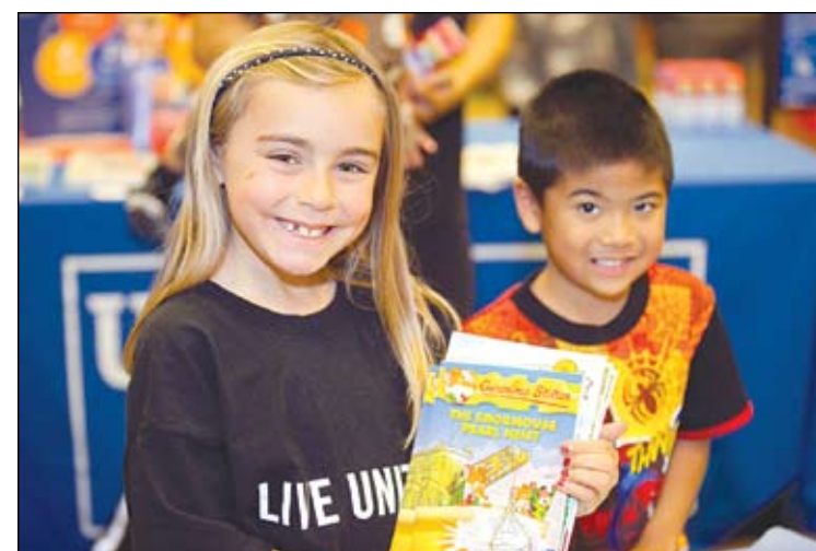
Drive to kick off at Fairytale Town as part of Dr. Seuss' Birthday Celebration.