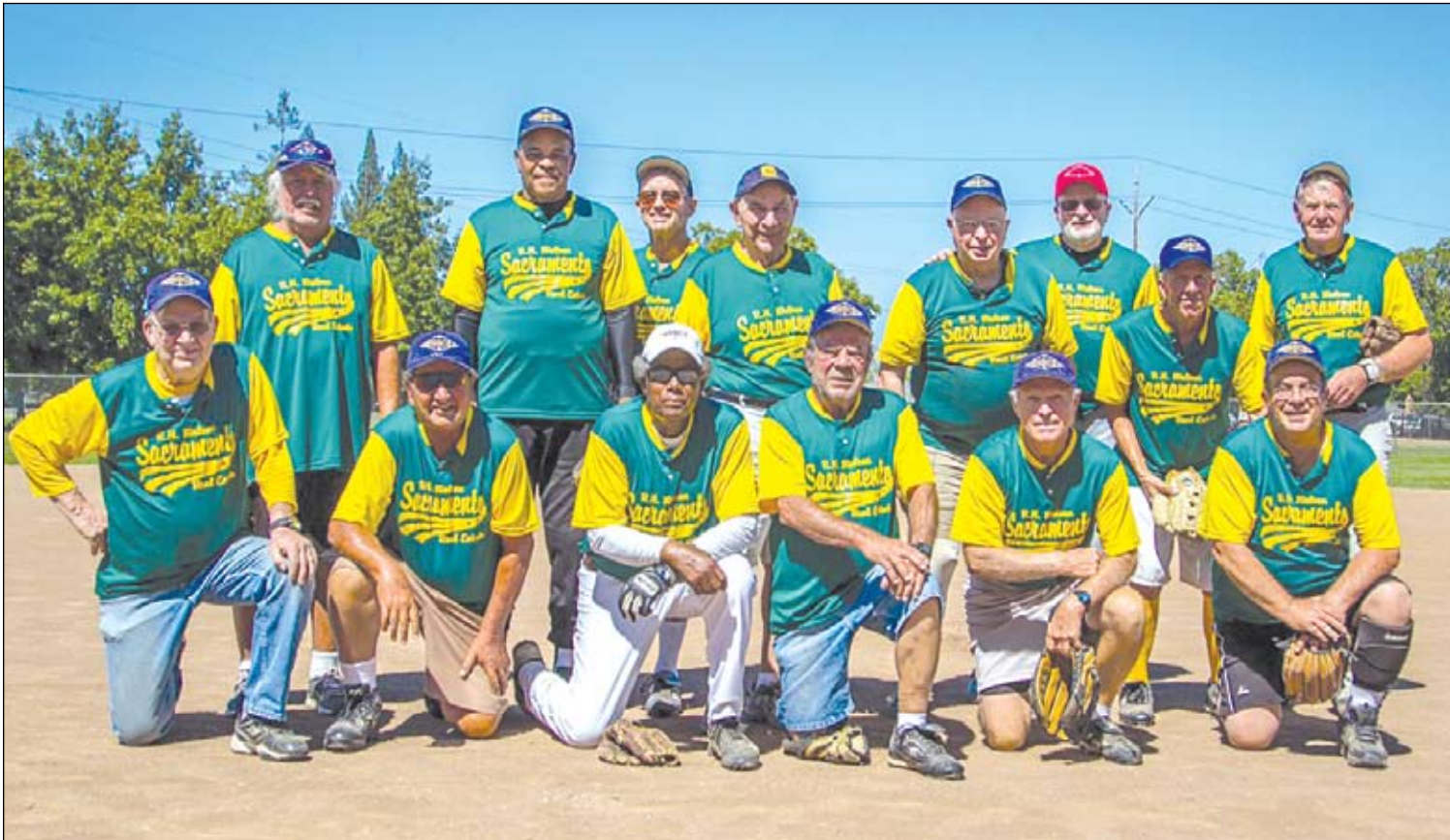
Sacramento has a long history of being a strong baseball town. Baseball has always been very popular in Sacramento schools and with the Sacramento Solons. The Sacramento Solons were a minor league baseball team based in Sacramento, California. They played in the Pacific Coast League during several periods (1903, 1905, 1909–1914, 1918–1960, 1974–1976). The current Sacramento River Cats began play in West Sacramento in 2000.

This large region is the Senior Softball Capital of the World! It started with the introduction of baseball in New York in 1847. Baseball had several creators, but it was Alexander Cartwright