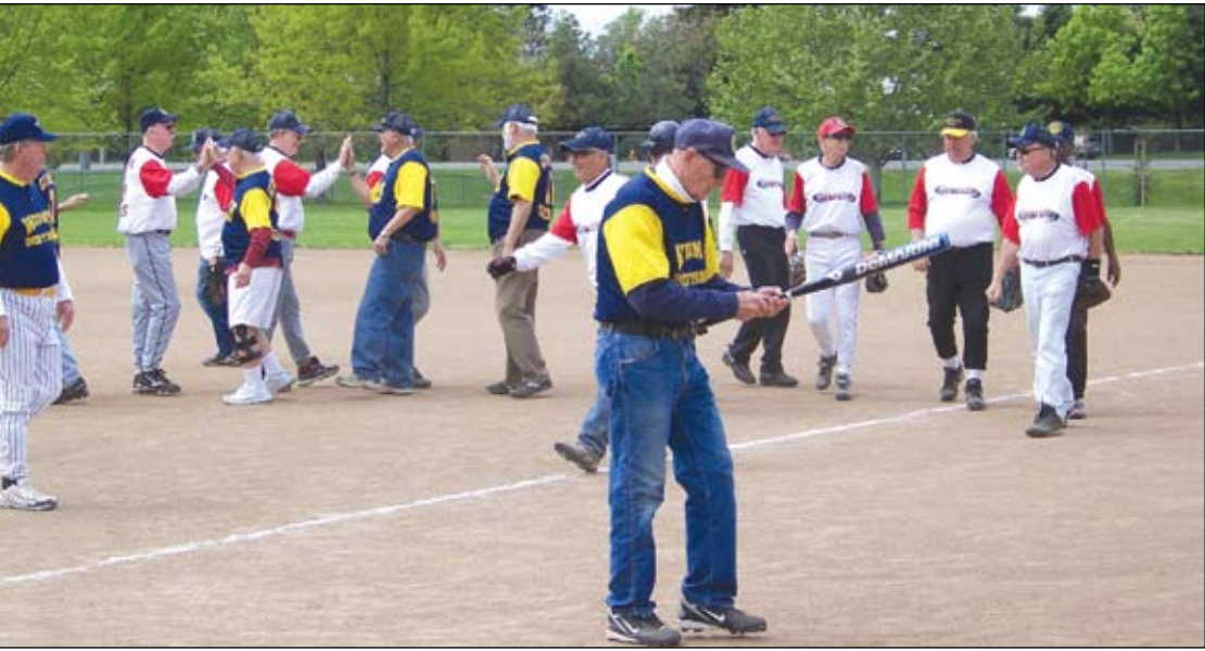
As baseball players age, their game evolves into fast pitch softball, then co-ed slow pitch softball, and finally senior slow pitch softball.