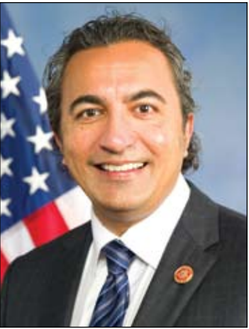
Congressman Ami Bera

“Today’s (December 10th) hearing was a necessary discussion about the nuclear deal between Iran and the U.S. The agreement is an important step towards the widely-shared, international goal of preventing Iran from developing or acquiring