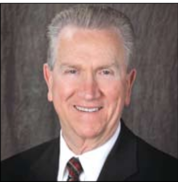
By Bob McGarvey

Looking back at some of the pictures of the signs and billboards that lined Folsom Blvd 10 years ago can make you appreciate the changes that have been made. There are still some signs around of course, but they are not the huge billboards that sometimes seemed to take up half the sky. The signs there today show information about the businesses, but they do not stay on one board until the paper starts fading away and begins to peel off the board on its own. On Highway 50 the electric billboards that are showing up use a softer light, and the information is there for 6 to 8 seconds then it disappears and goes to the next message. That kind of billboard makes it easier for small businesses to afford sending out their messages too. In addition, those electric boards will also help provide