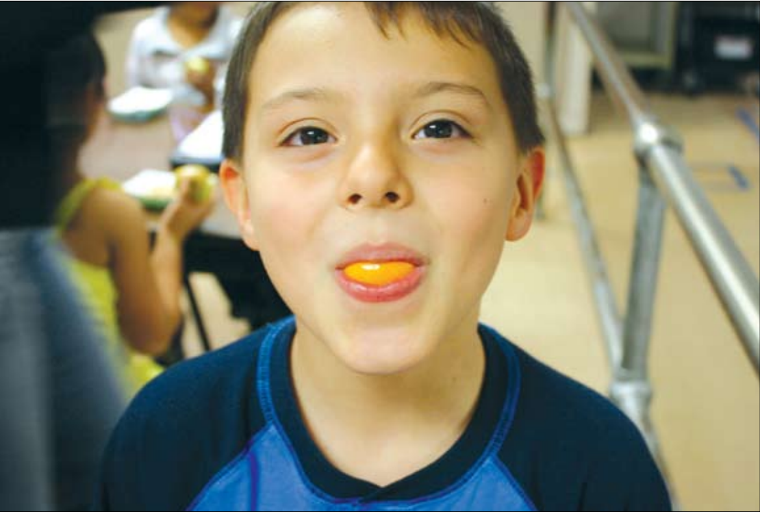
California Food Literacy Center was established in July 2011 to educate and inspire low-income children to eat healthy food. Students learn fruit and vegetable appreciation, how to read nutrition labels, basic cooking skills and environmental impacts of their food choices.

Local nonprofit hopes to raise 3,375 pieces of produce