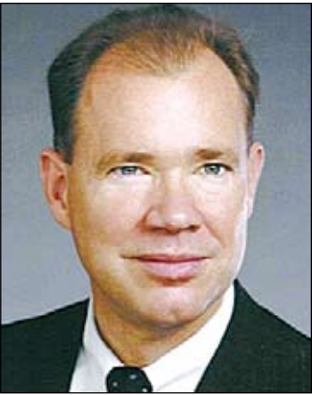
Commentary By Jon Coupal

Pop quiz. Which of the following statements is true? A. California High speed rail (HSR) will allow riders to travel between Los Angeles and San Francisco in about two and a half hours for $50. B. The total cost of HSR will be about $40 billion. C. About half the cost of HSR will be picked up by the private sector and the federal government. D. If you like your plan you can keep it. If you answered none of the above, you are correct and probably good at spotting misinformation put out by the political class to manipulate public opinion. The first 3 statements come from arguments by those who supported Proposition 1A, or, as it was called, the Safe, Reliable High-Speed Passenger Train Bond Act for the 21st Century, which appeared on the ballot in 2008. Using rosy estimates of short travel times at low cost, along with several million dollars provided by labor unions to get the message out, promoters of Proposition 1A convinced voters to approve a $10 billion bond.