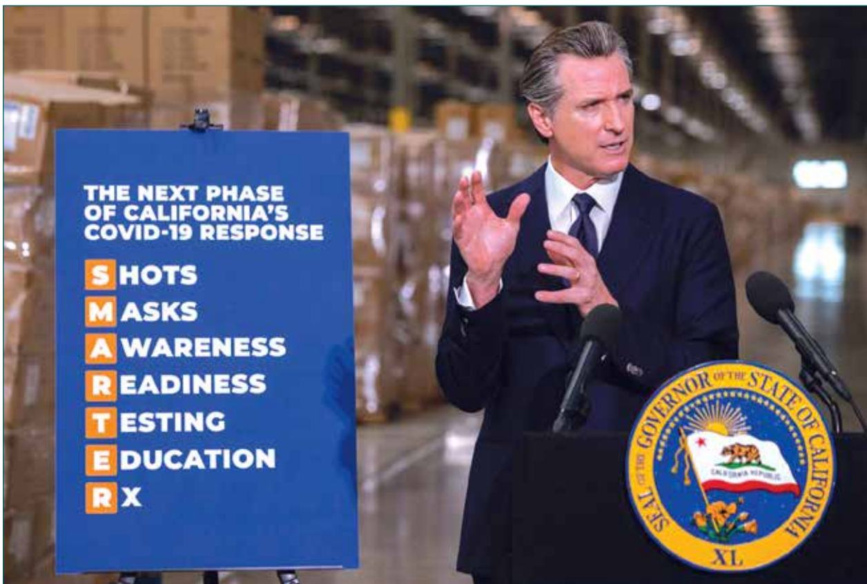
Gov. Gavin Newsom discusses the next phase of the state's COVID-19 response at a press conference in Fontana on Feb. 17, 2022. The press conference took place in one of many warehouses where PPE supplies are stored.

California is still in a State of Emergency?