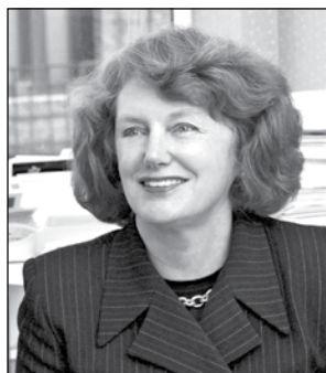
Commentary by Sally C. Pipes

Imagine a visit to the local farmer's market. When you're about to pay the farmer for some fruit, a man in a suit and sunglasses interrupts the exchange and offers to negotiate a discount with the farmer.