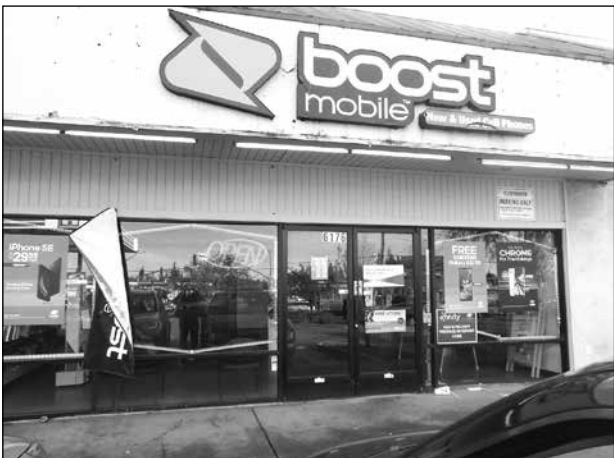
Boost Mobile - 6176 Auburn Blvd. closes.

Boost Mobile offers its customers a no annual wireless service contract. Service plans typically include pre-paid unlimited