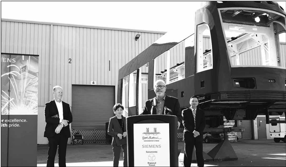
Siemens Mobility built SacRT's original light rail fleet, which started operating in revenue service in 1987.

The law provides more than $10 billion in transit funding for California, assisting SacRT with its Light Rail Modernization Project, including the purchase of low-floor light rail vehicles, which are being manufactured by Siemens Mobility's Rolling Stock