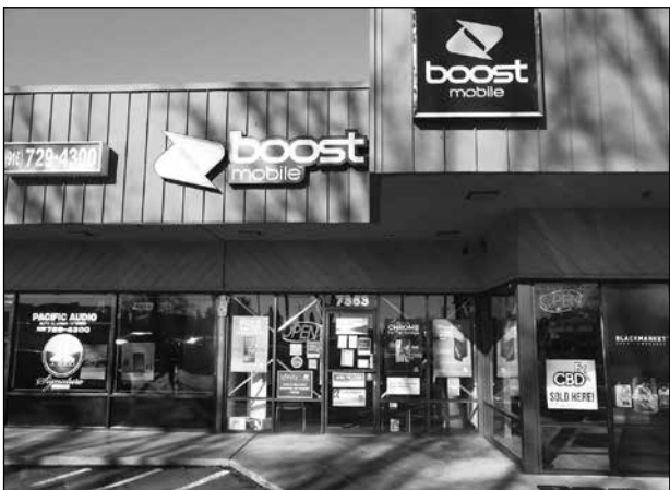
Boost Mobile - 7363 Greenback Lane closes as well.

talk and text, and phones from top brands at affordable prices. Customers who need to reload funds on their account can still do so at participating 7-11, Walgreens and CVS stores. Some Boost Mobile phones are also available for retail purchase at Walmart.