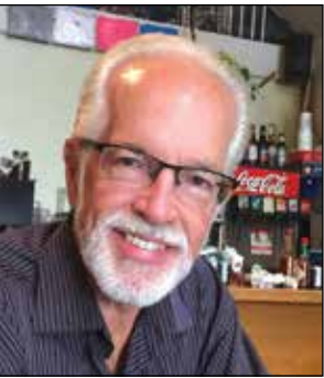
Commentary by Bruce Lee

Socialism, socialism ... what an alluring temptress. Following the 1991 collapse of the Soviet Union and China’s move towards a free-market economy (reestablishing the Shanghai Stock Exchange in 1990), I hoped socialism found its rightful place in the dung heaps of history, unfortunately its temptations persist. The seeds of socialism in federal (and California) policies as the Green New Deal, show how alluring the concept remains. Promising prosperity, security, and equality with other people’s money, it has only delivered tyranny and poverty around the world. Examine Venezuela’s economic collapse of the last decade. Again, socialism proved a Ponzi scheme; it sounds amazing only to collapse under the weight of centralized control and denial of basic human nature. A simple, 2009 illustration helps us understand: A hypothetical economics professor, who had never failed a single student in her career, supposedly failed an entire class. This class insisted that socialism worked - that no one would be poor nor be rich, a great social equalizer. The professor said, “OK, we’ll run an experiment to test this plan.” Everyone’s grade will be based on the