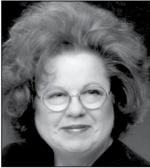
By Marlys Johnsen Norris, Christian Author

align with other recent statewide plans - including the Climate Action Plan for Transportation Infrastructure, California Transportation Plan 2050, California Freight Mobility Plan 2020 and the 2018 California State Rail Plan - to form a comprehensive strategy for a safe, equitable, sustainable, accessible and resilient transportation system. Caltrans will implement the 2021 ITSP to guide investments and prioritize interregional projects while coordinating with local agency partners and public stakeholders. The adopted 2021 ITSP, along with responses to public comments on the draft plan released in August, can be found at the Caltrans ITSP home page. ★