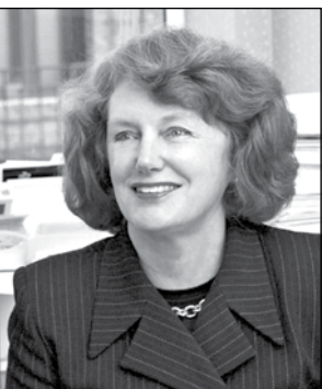
Commentary by Sally C. Pipes

“Everyday low prices” are coming to health care. Walmart recently launched its own analog insulin, a synthetic form of the hormone that’s genetically modified to be released rapidly or slowly, depending on a person’s needs. It will be manufactured by pharmaceutical giant Novo Nordisk – but cost 75% less than brand-name analog insulin. The deal stands out as proof that markets can deliver outcomes that work for producers and consumers alike – if we let them. Generally speaking, the “market” for medicines is dysfunctional. It bears little resemblance to the markets for groceries or electronics, where consumers can compare prices and product reviews, shop around for the best deal, and purchase what they want. Instead, patients typically pay for prescription drugs through their insurance plans. They may be