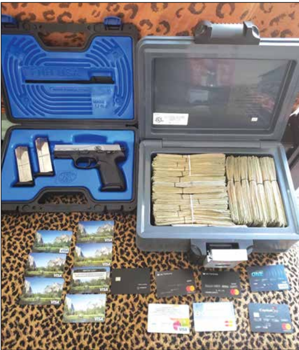
Image of illegal weapons, cash, and credit cards.