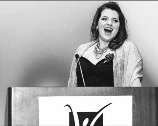
A Women’s Empowerment graduate speaks about her experience with homelessness at the nonprofit’s annual gala. Women’s Empowerment will hold its 20th anniversary gala on Sept. 30.