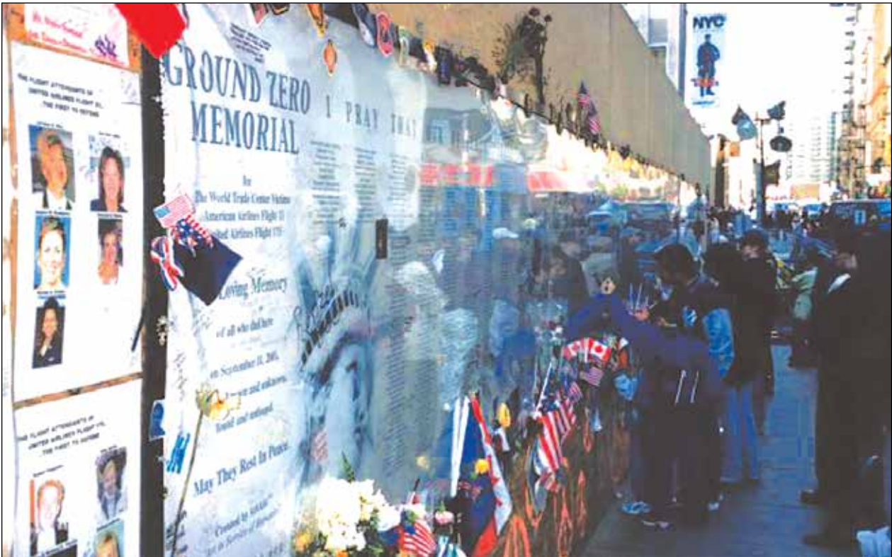
One of the many memorial walls surrounding the Ground Zero site.

I had previously lived in Manhattan. After returning to California, I traveled to New York City often to teach classes at The Learning Exchange and spiritual training centers as a part of my ministry. I also met with many clients as a spiritual life coach each visit. Through these visits I became friends with so many great people who lived in The City. I stayed at their homes, got to know their families, learned about their lives, loves, and fears. Many of them worked in the immediate area of the Twin Towers.