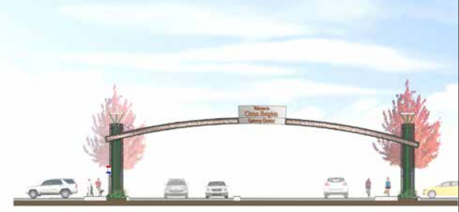
Auburn Gateway Option-2.