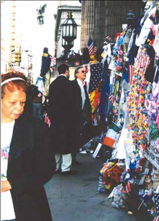
Visitors reading through the memorials and “missing” posters.

On this remembrance weekend 20 years later, take a few moments in silence to share the grief and the weight of the losses experienced by so many on September 11, 2001. If only with that simple action, love will prevail. ★