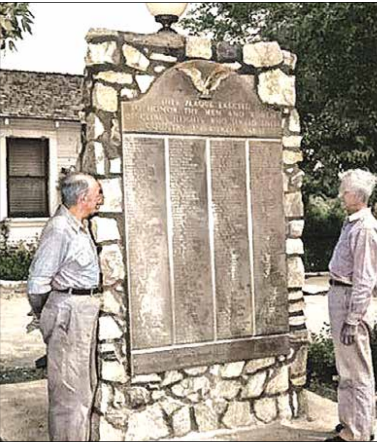
The historic 73-year-old bronze plaque erected circa 1948 commemorating the service of 272 Citrus Heights men and women in uniform during World War II.