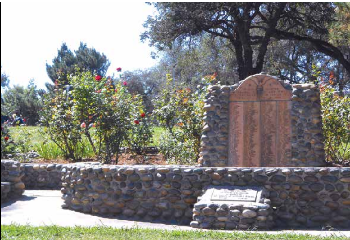
The restored World War II Memorial commemorating the service of 272 Citrus Heights men and women in uniform.