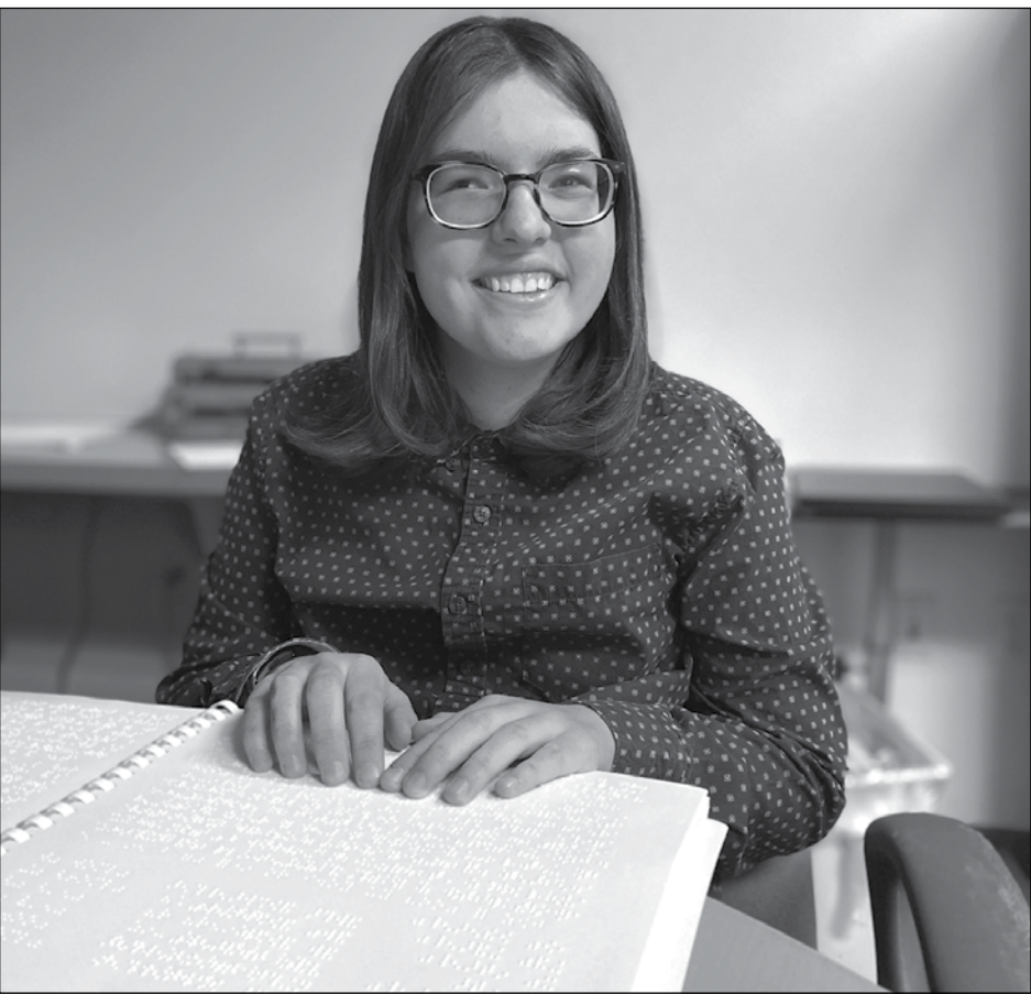
A student learns Braille at Society for the Blind. The organization just received a grant from Golden 1 to help youth with vision loss learn Braille.