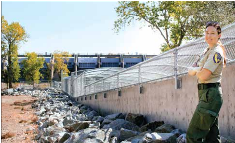
Fish and Wildlife Department staffer Stephanie Ambrosia surveys fish ladder extensions built to conduct spawning salmon to hatchery processing beneath Nimbus Dam. Recently completed, the $9.7 million flume begins operation in November.

Three years in construction, the ladder and its water-level flume are designed to lead those fish that have not spawned naturally to hatchery fertilization. Egg and milt harvesting began here in the 1950s, after dam construction blocked migratory paths for American River salmon and steelhead. To divert returning fish, a picket weir previously spanned the American